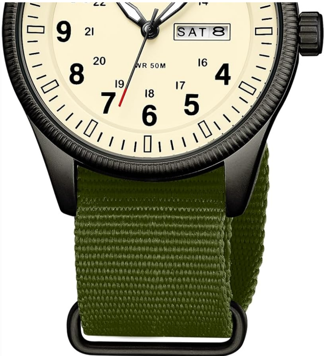
Image: Bomieux L6696 Unisex Military Analog Watch with Green Nylon Strap.