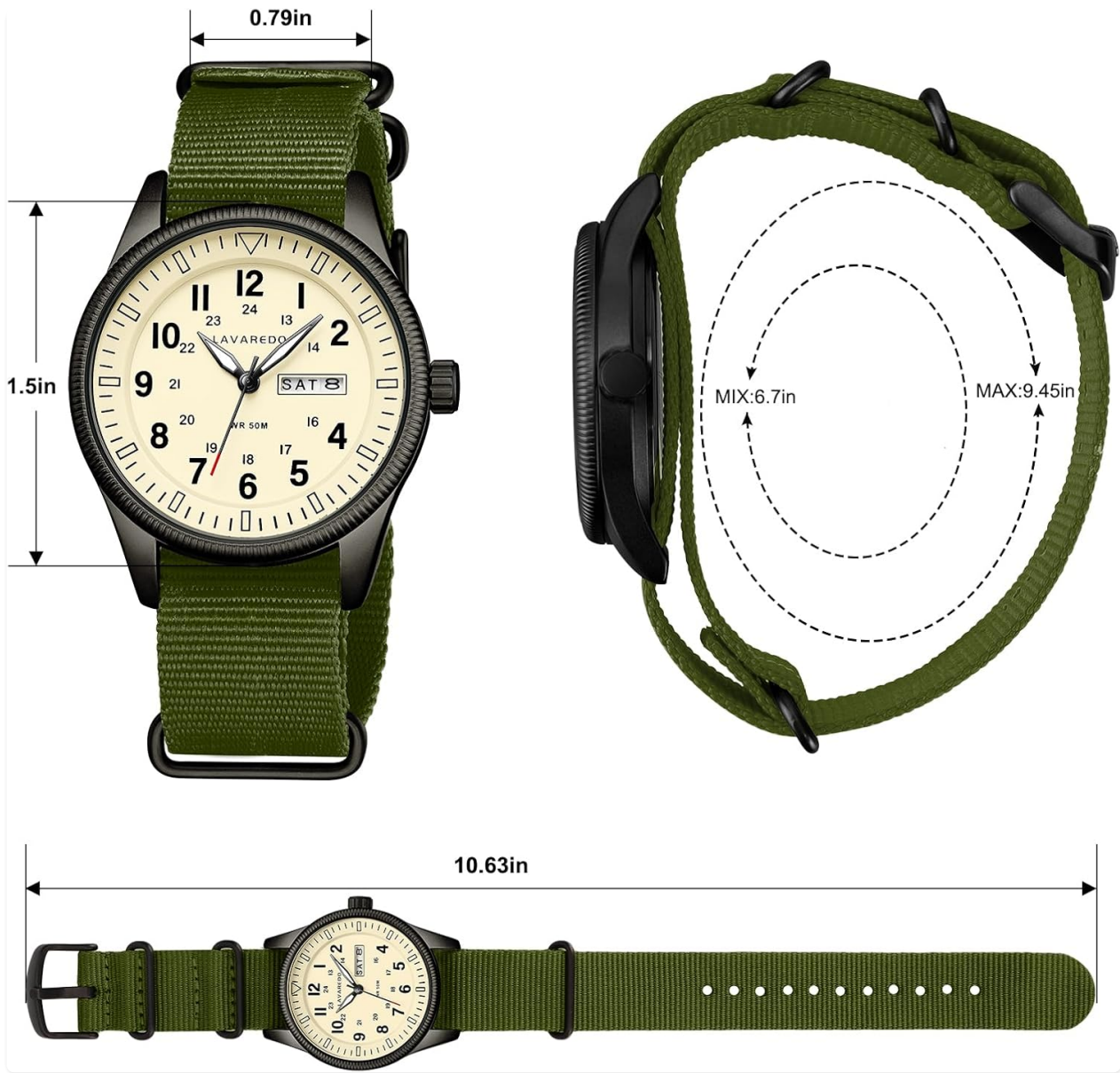
Image: Detailed dimensions of the Bomieux L6696 watch.