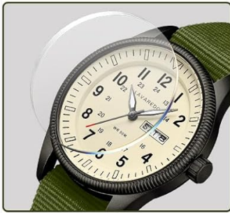
High Hardness Glass Mirror