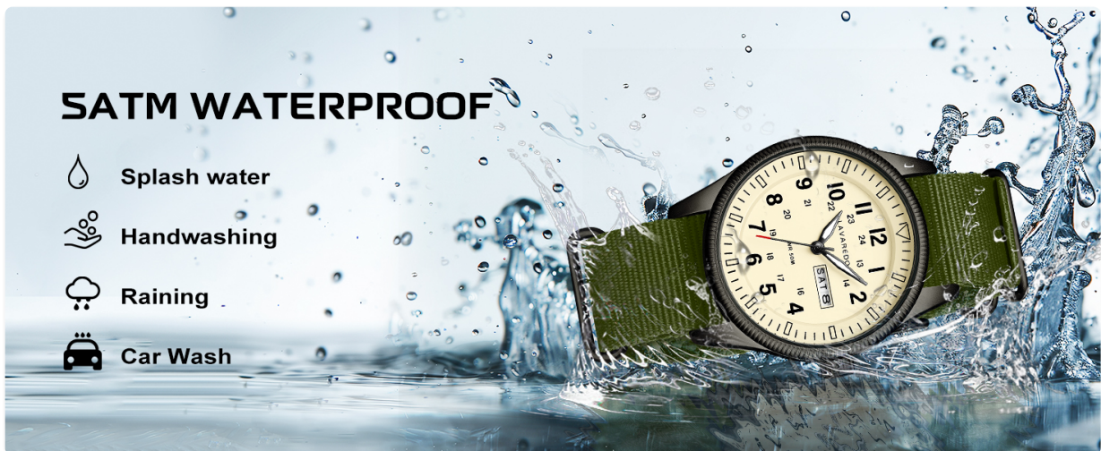
Image: 5ATM Water Resistance for daily activities.