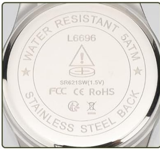
Stainless Steel Cover