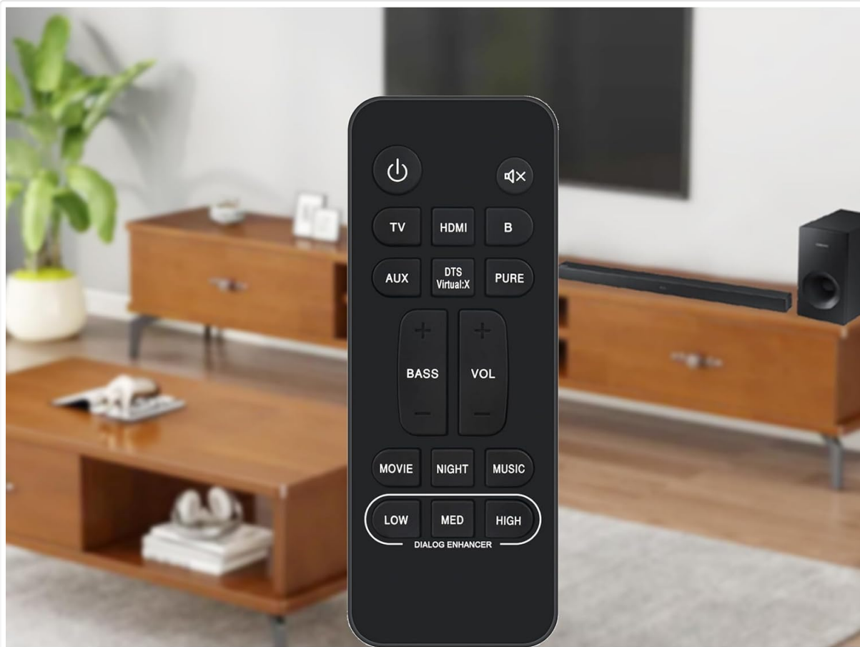
Figure 3: RC-1251 remote control with approximate dimensions.