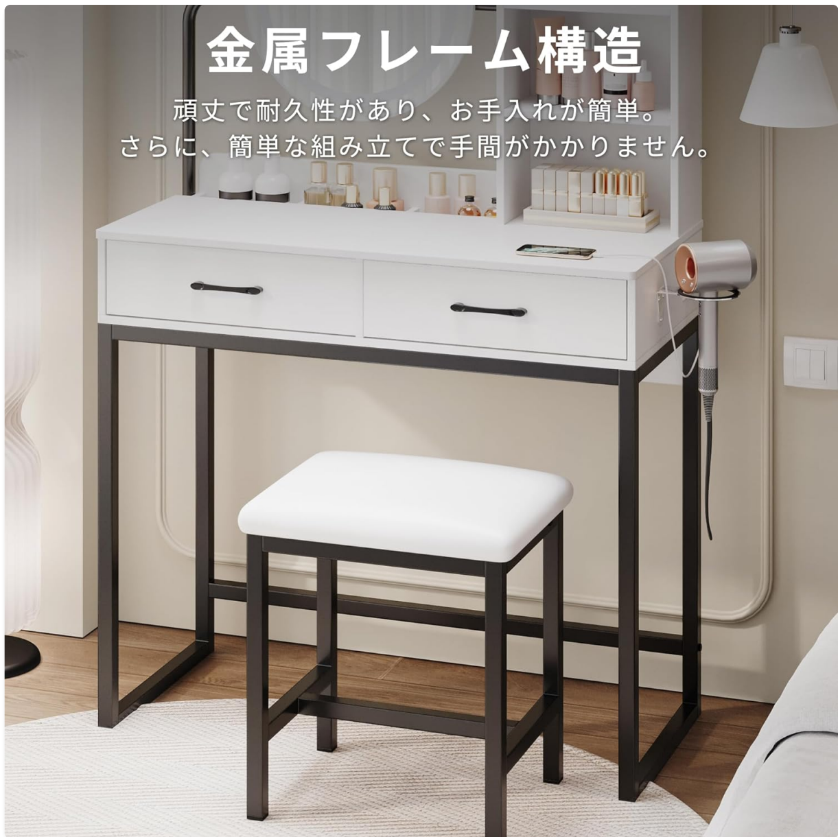
Image 3.1: The robust metal frame structure, highlighting its durability and ease of maintenance.