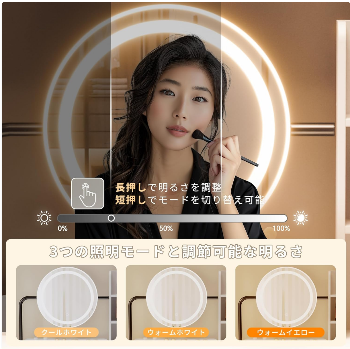
Image 2.2: A close-up of the LED mirror demonstrating the three adjustable light modes (cool white, warm white, warm yellow) and brightness control.