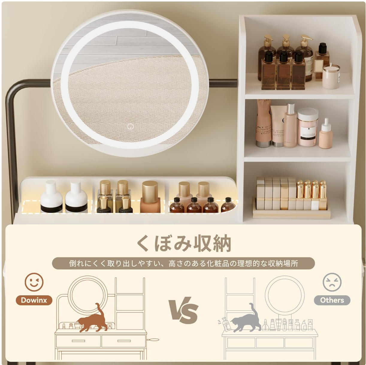
Image 2.4: Illustration of the sunken storage area, designed to prevent items from falling over and provide ideal storage for tall cosmetic bottles.