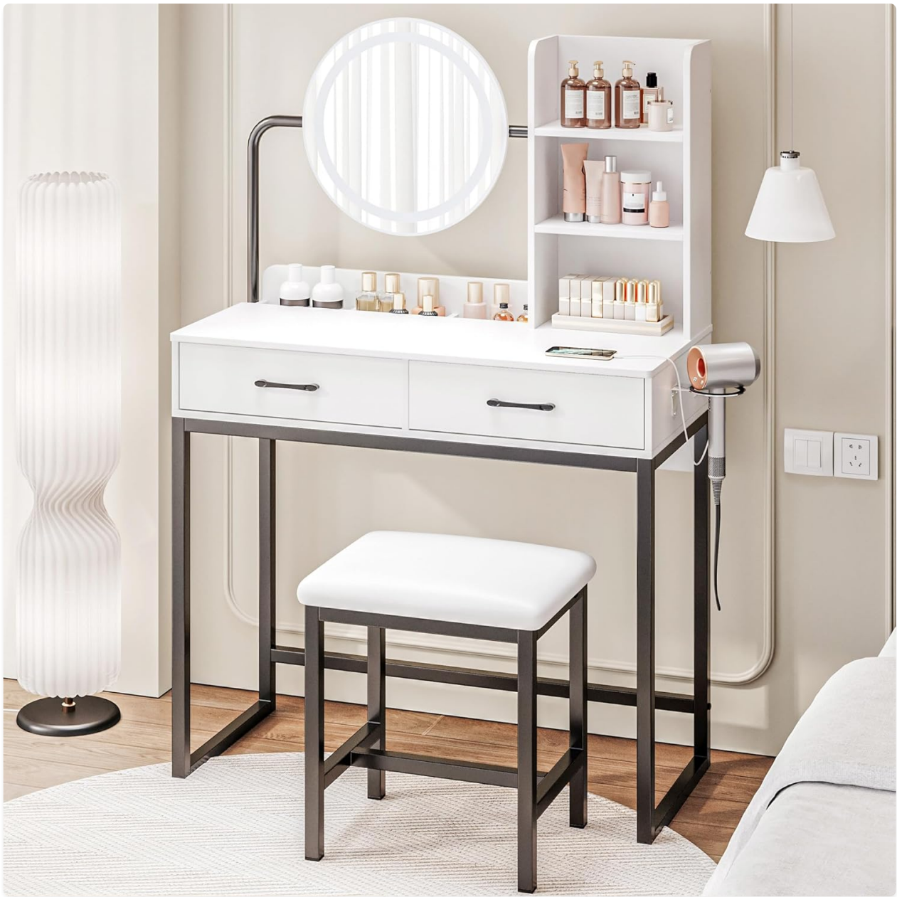
Image 1.1: The Dowinx Compact Vanity Desk, showcasing its sleek design with a white tabletop, black metal frame, round LED mirror, and matching stool.