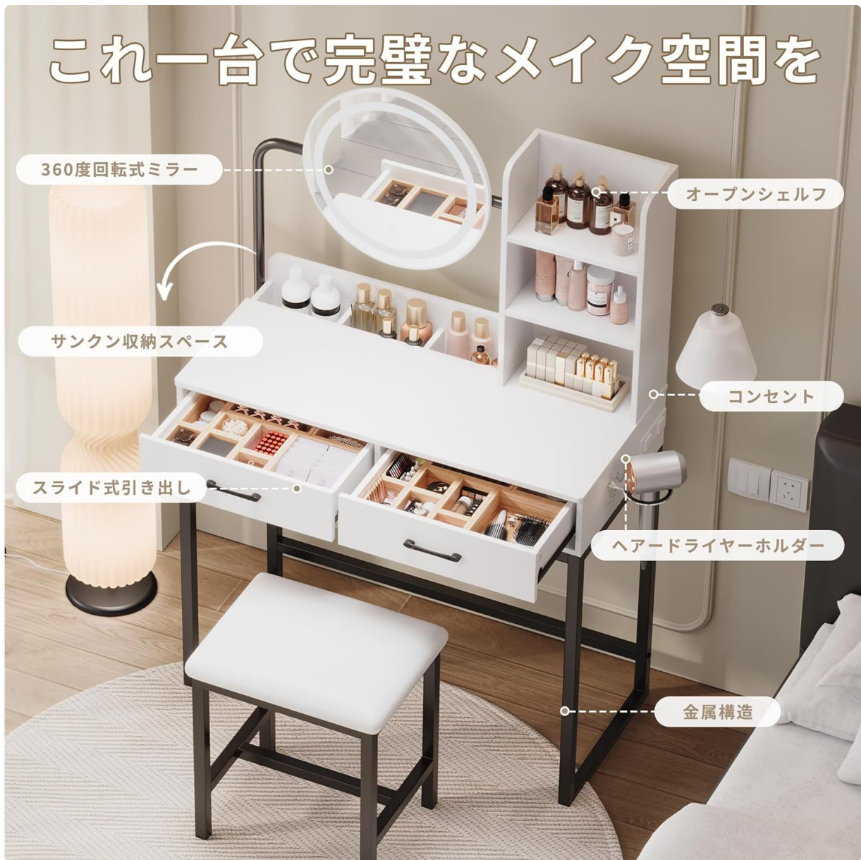
Image 2.1: A detailed diagram highlighting key features such as the 360-degree rotating mirror, open shelves, power outlets, slide-out drawers, and hair dryer holder.