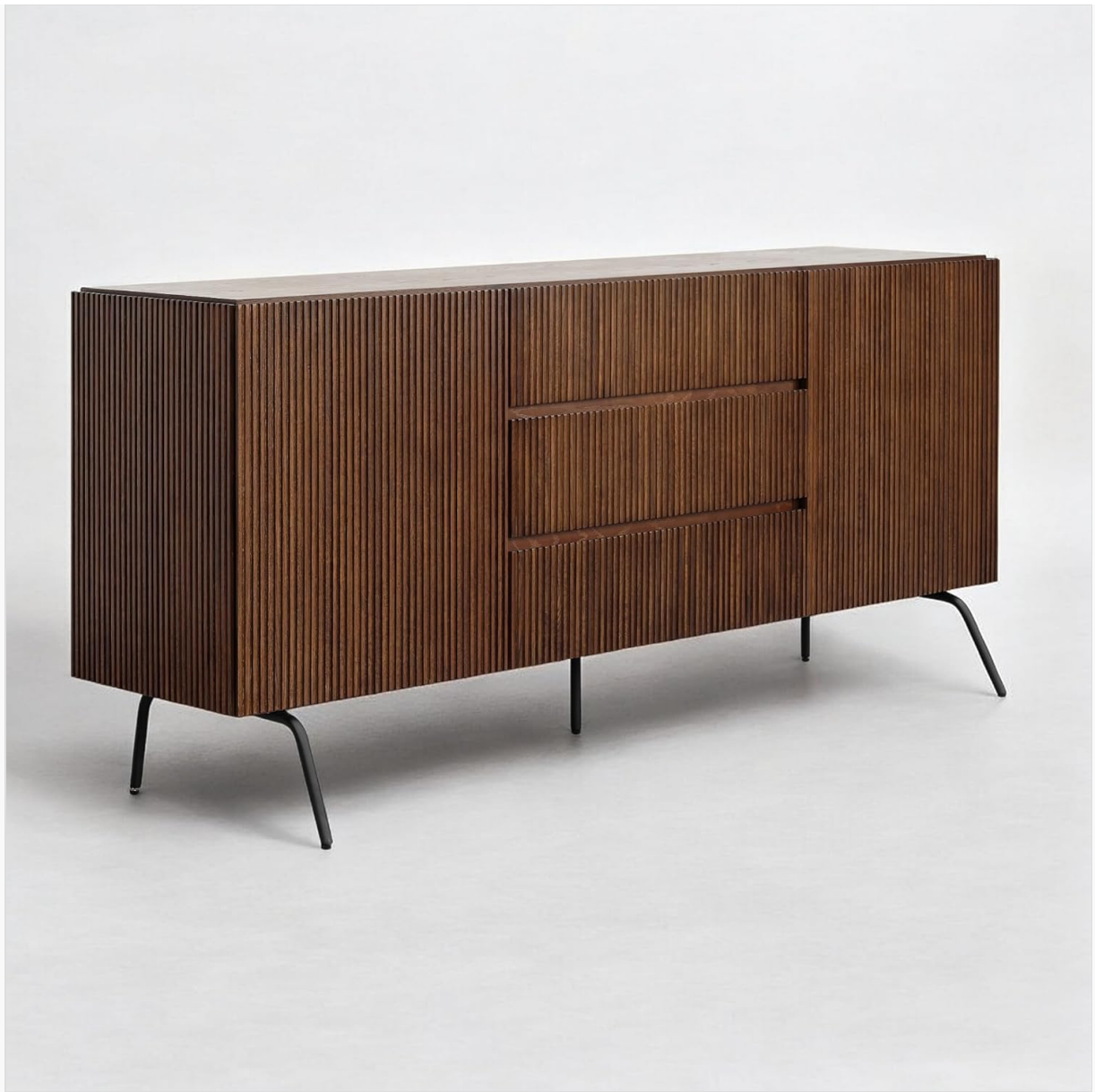
Image: Front view of the NTC Veil Large Sideboard in Dark Walnut.