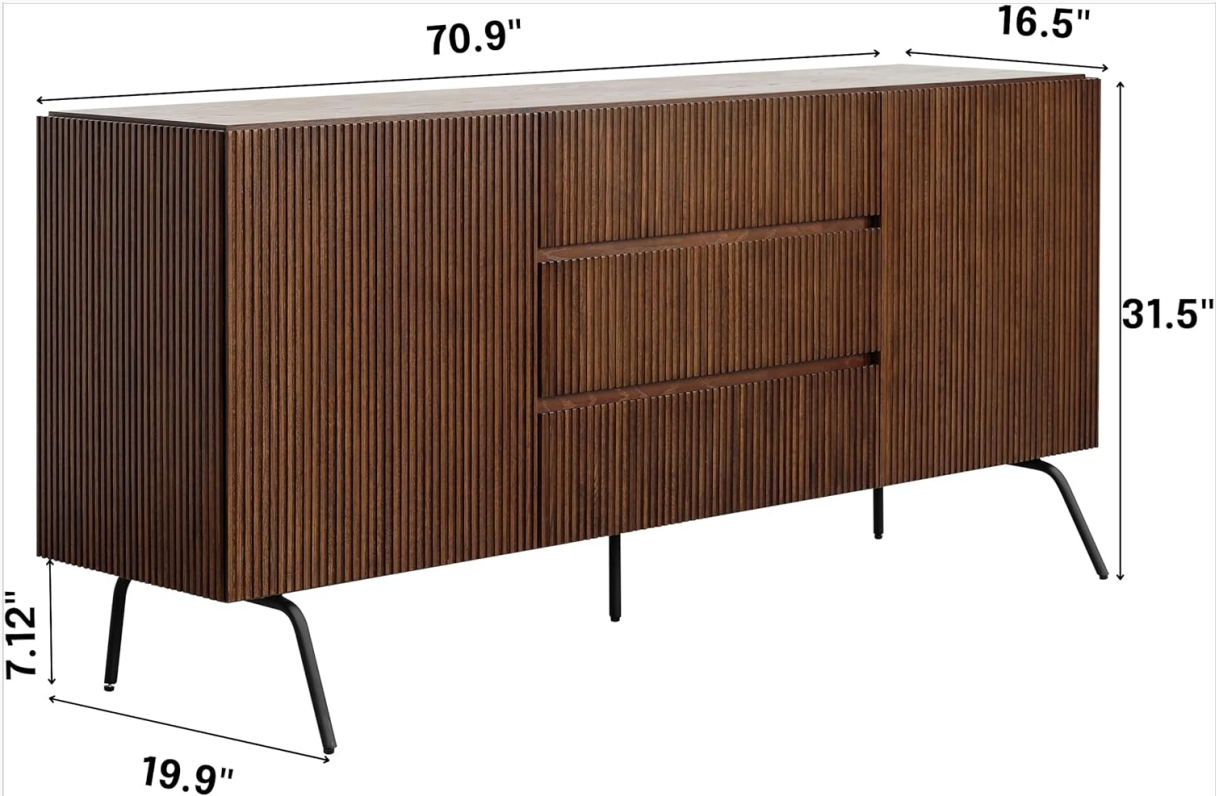
Image: Detailed product dimensions including width, depth, and height.