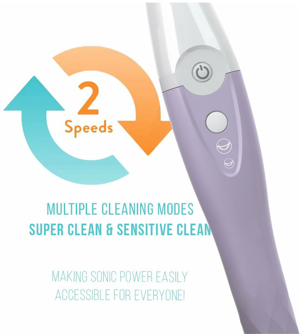
Image 3: Visual representation of the dual speed settings for customized brushing.