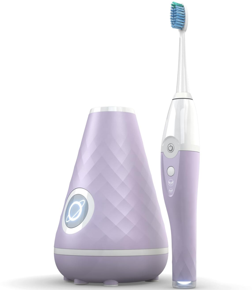
Image 1: TAO Clean UV Sanitizing Sonic Toothbrush and Cleaning Station.