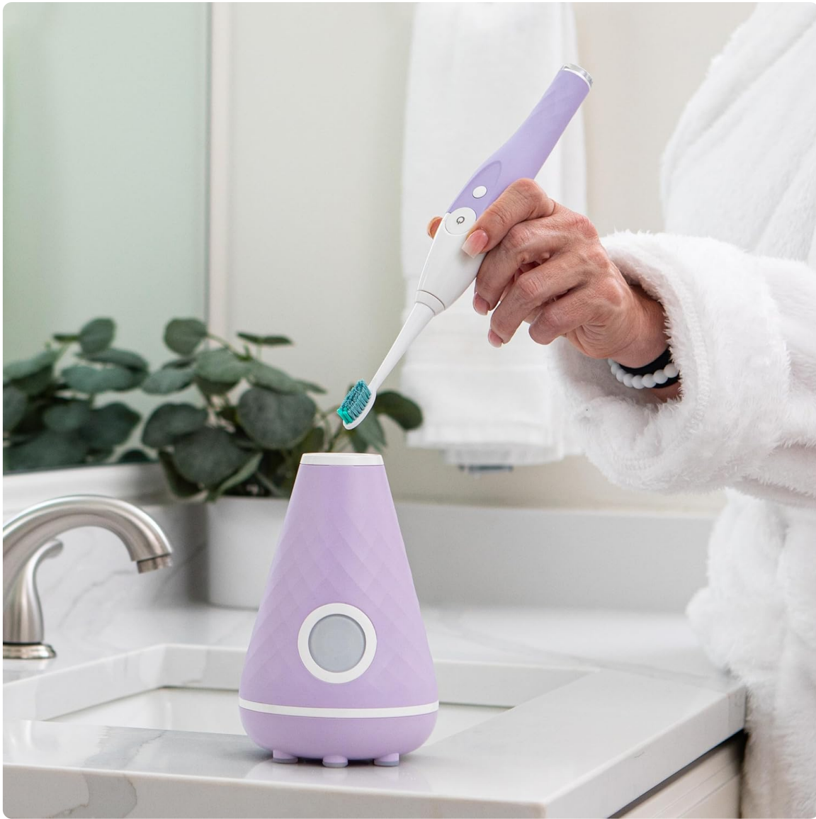
Image 5: Placing the toothbrush into the station for sanitization and charging.