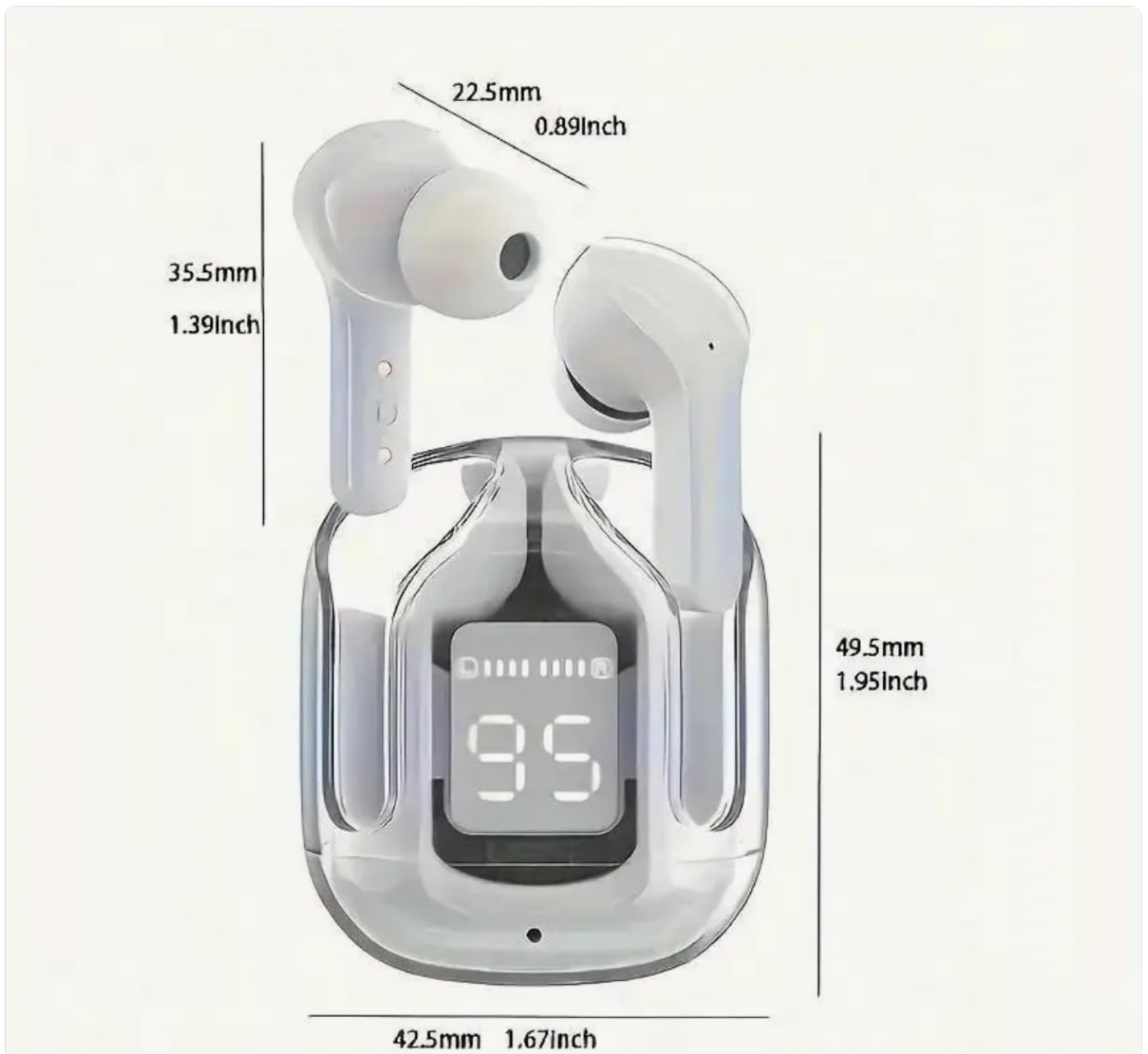
Image: A diagram illustrating the precise dimensions of the earbuds and their charging case in both millimeters and inches, providing a clear understanding of their compact size.