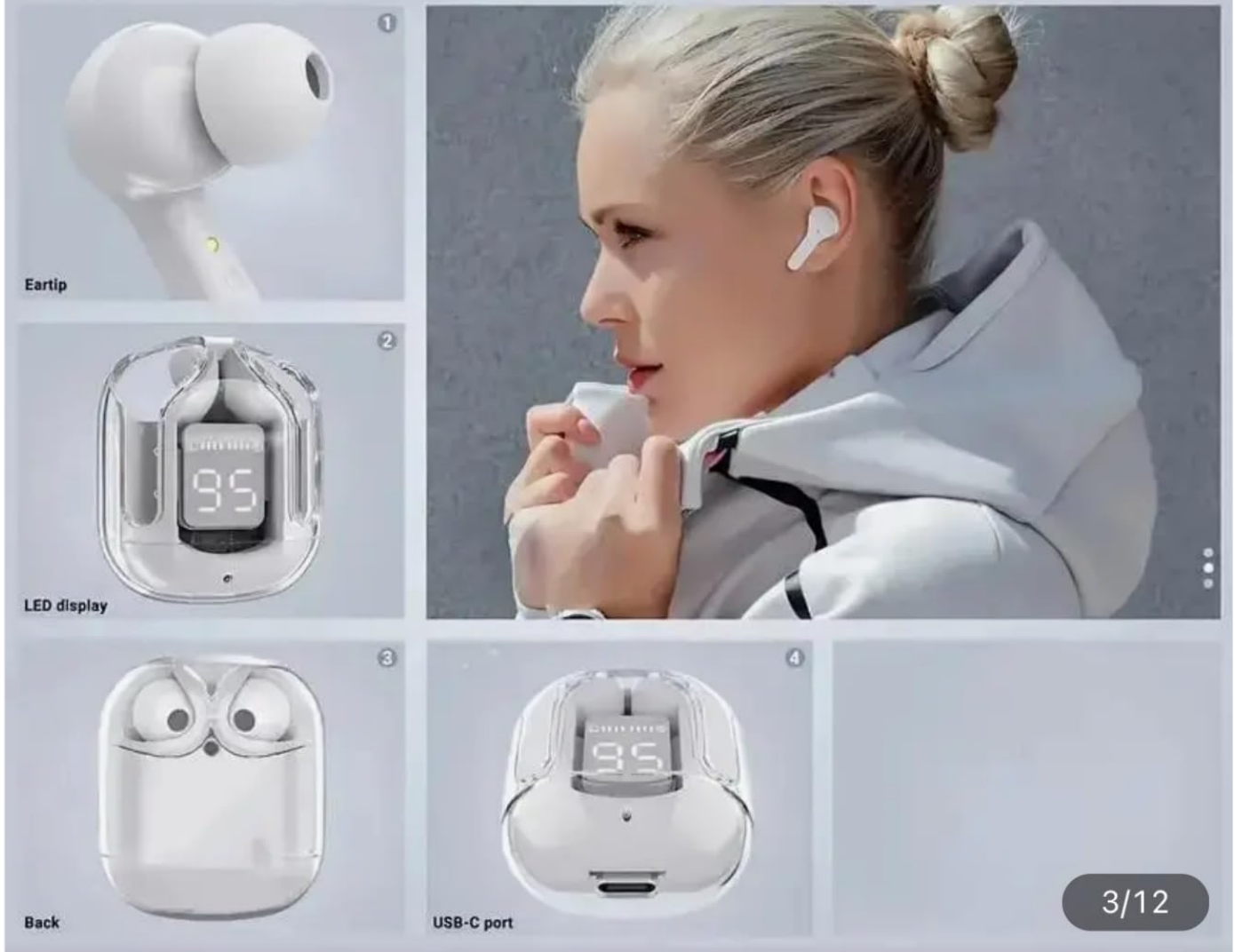
Image: A composite image showing various details of the earbuds and charging case. It highlights the ear-tip, the LED display on the case, the back view of the case, and the USB-C charging port. This illustrates the physical features relevant to charging and handling.