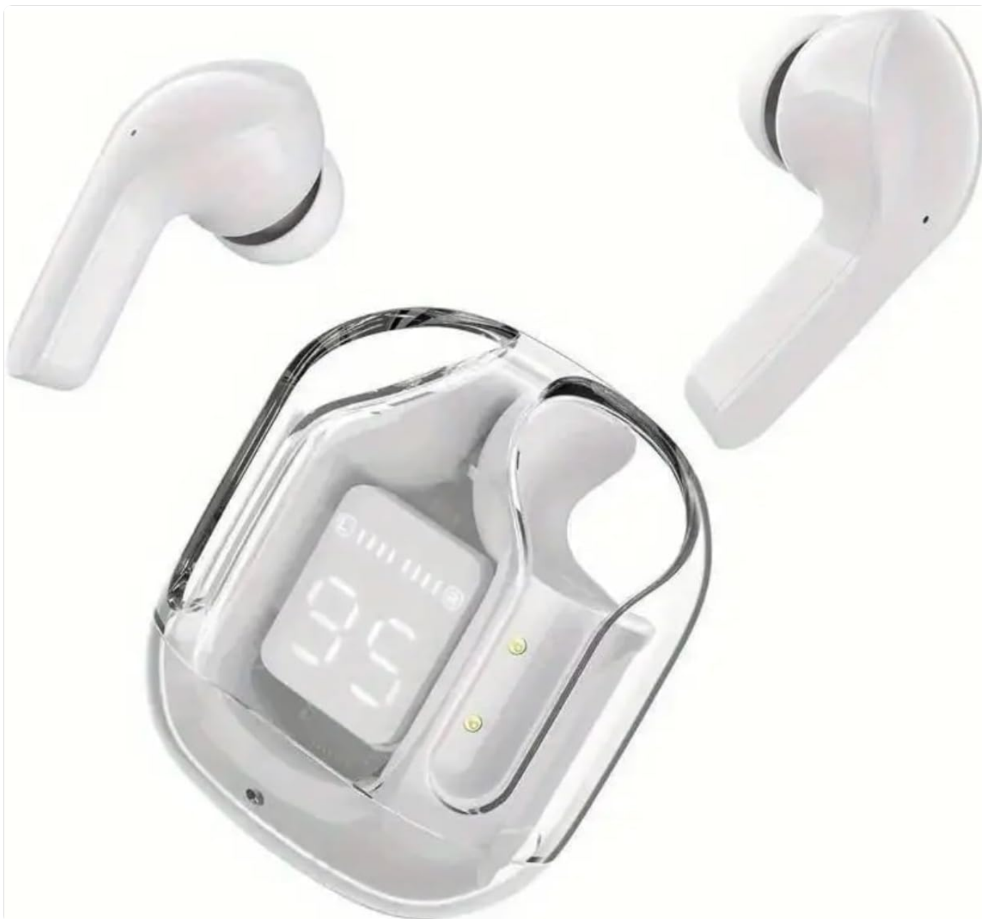
Image: The wireless earbuds, white in color, are shown alongside their transparent charging case. The case features a digital display indicating battery percentage and charging status. The earbuds are designed to fit snugly within the case for charging and storage.