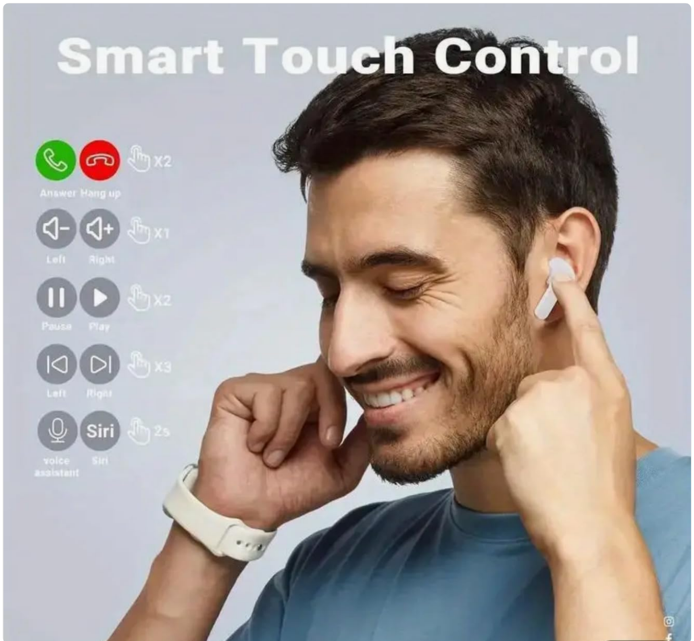
Image: A visual guide demonstrating the touch control functions of the earbuds. It shows gestures for answering/hanging up calls, playing/pausing music, skipping tracks, adjusting volume, and activating voice assistants like Siri.

The earbuds feature intuitive touch controls for various functions: