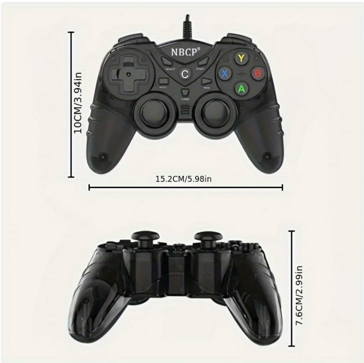
Figure 8: Controller Dimensions