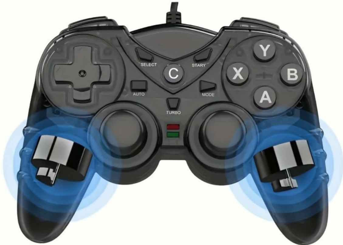
Figure 4: Controller Button Layout