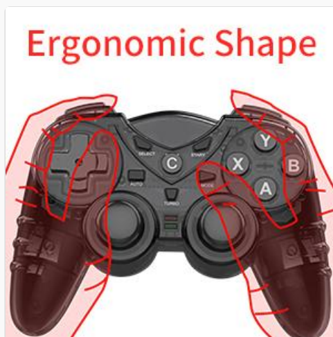
Figure 7: Ergonomic Controller Shape

The controller is designed with an ergonomic shape and asymmetrical joystick layout for comfortable and extended gameplay sessions. The analog sticks offer 360-degree ultra-accuracy for precise control.