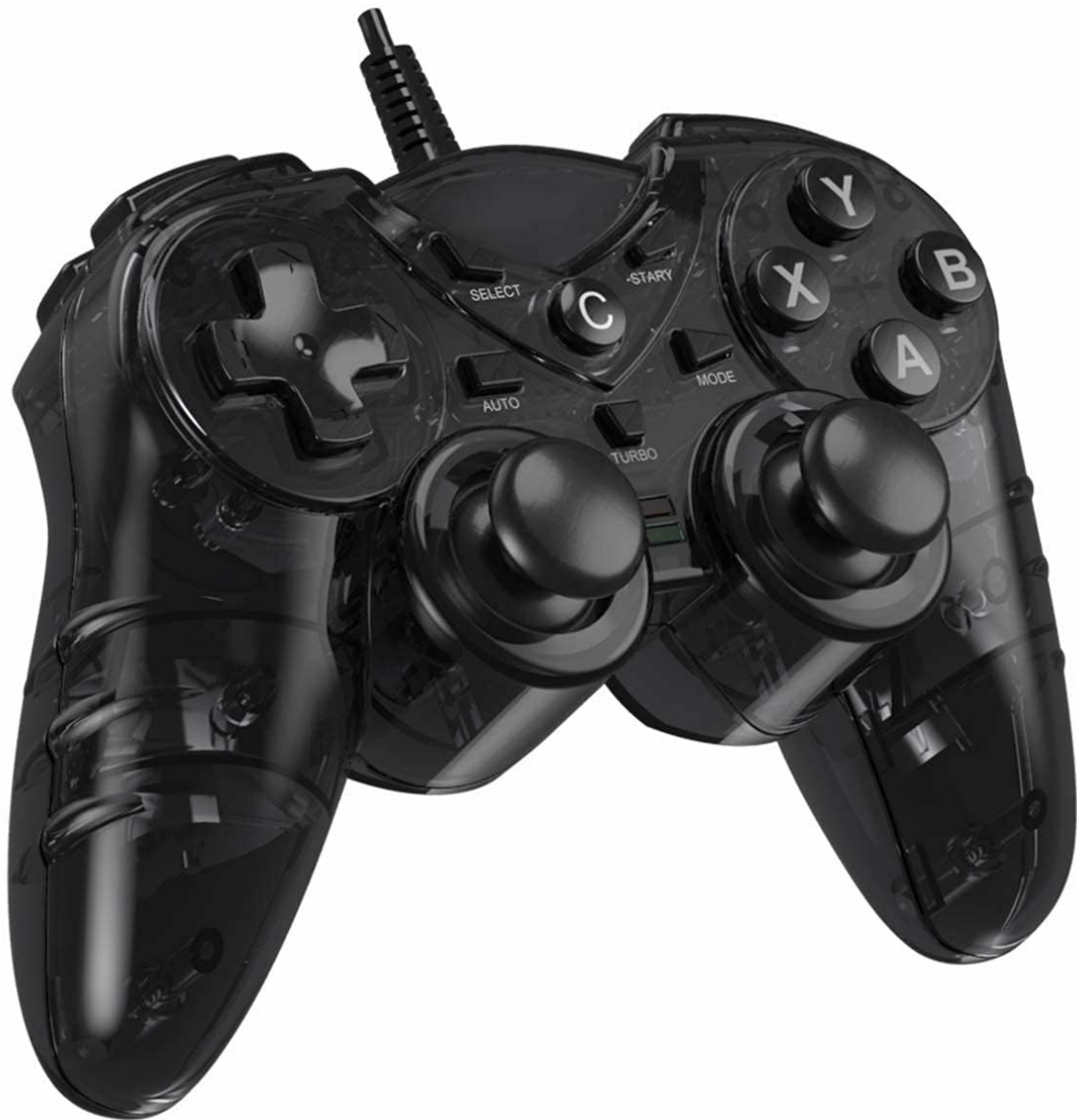
Figure 1: NBCP Wired PS3 PC Game Controller