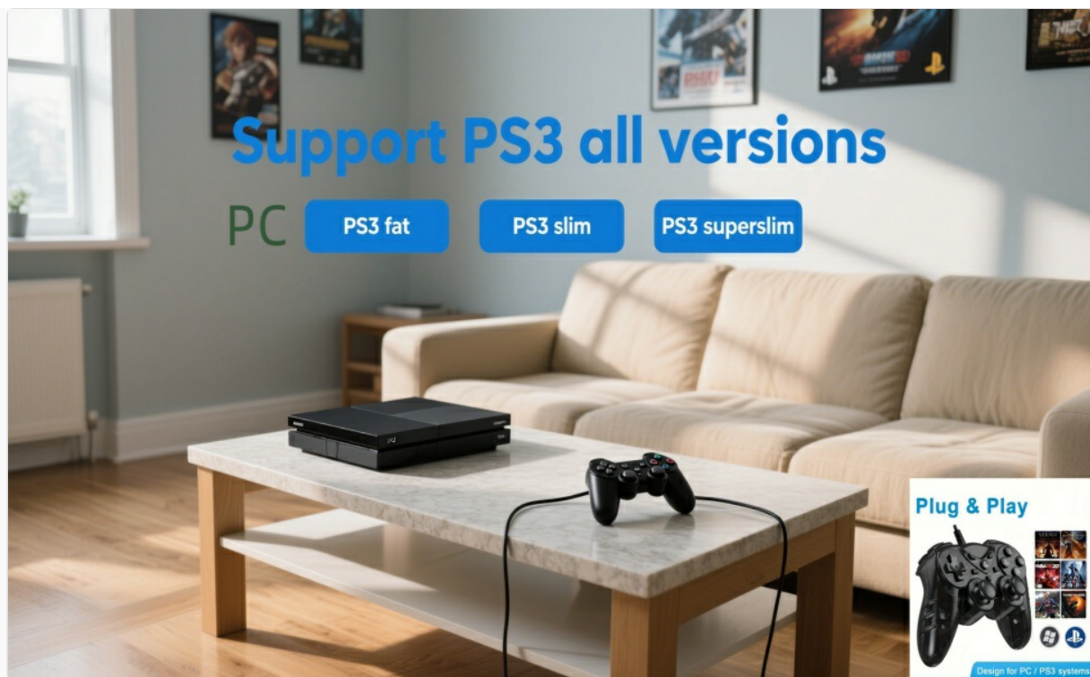
Figure 3: Controller connected to a PS3 console