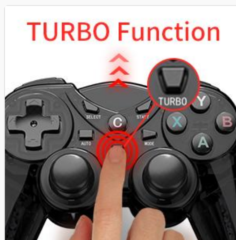
Figure 6: Turbo Function Button

The Turbo function allows for rapid, continuous pressing of a button with a single hold, which can be advantageous in certain games.