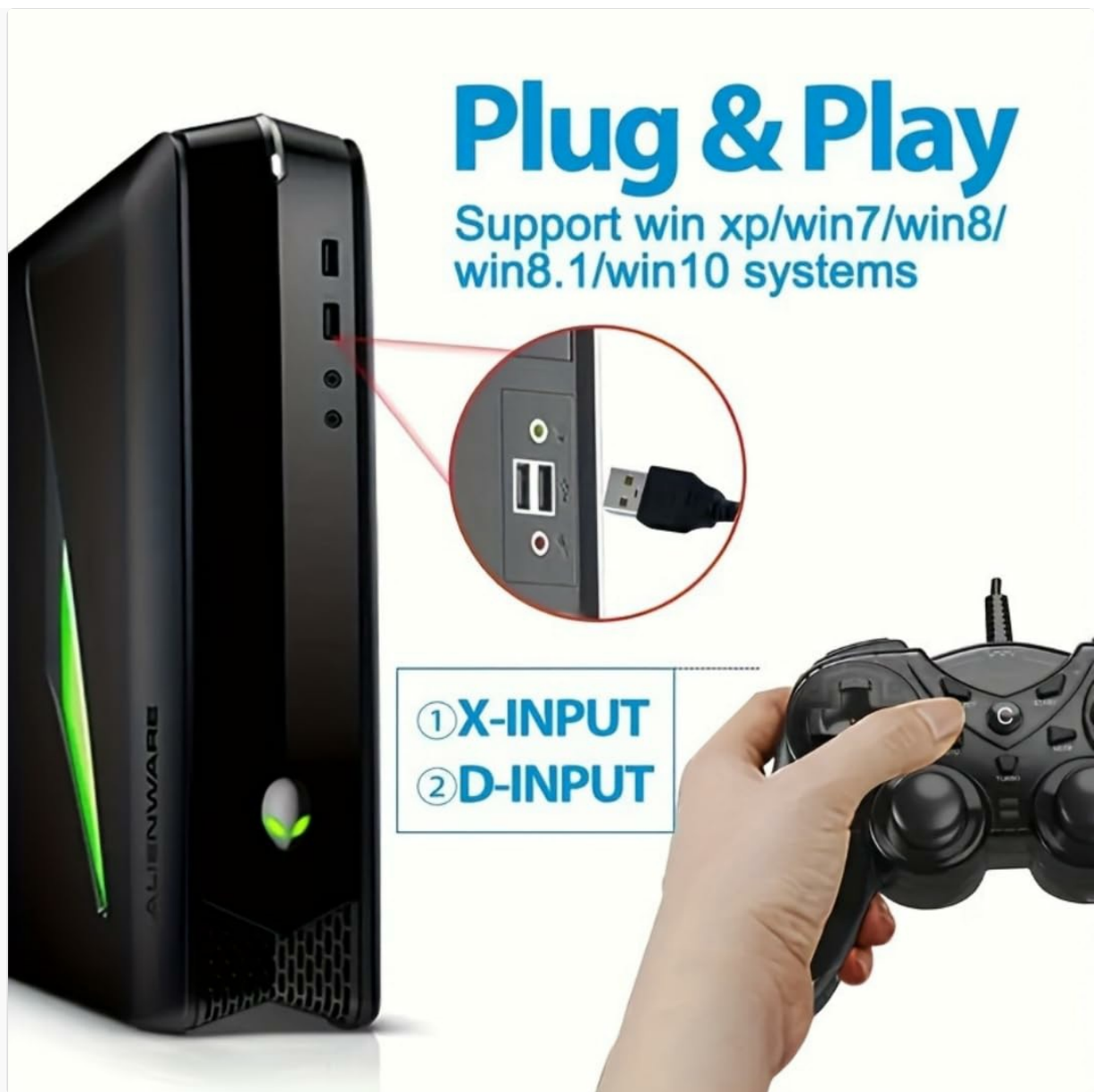
Figure 2: Connecting the controller to a PC via USB