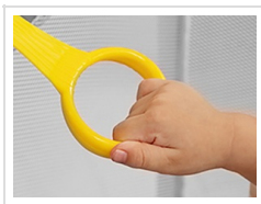
Image: Close-up of a pull ring, designed to help babies stand.

Four plastic pull rings are included to assist babies in pulling themselves up to a standing position, encouraging their development and providing additional play options. Attach them securely to the top rails of the playpen.