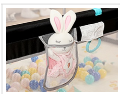
Image: Close-up of the integrated toy storage bag.

A convenient mesh storage bag is attached to the side of the playpen, perfect for keeping small toys, pacifiers, or other essential items within easy reach.