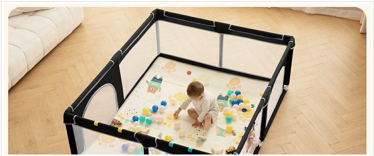
Image: Overview of the dearlomum 71"x59" Baby Playpen, showcasing its large size and a baby playing comfortably inside.

The dearlomum Baby Playpen provides a spacious and secure environment for babies and toddlers. Measuring 71x59x26 inches, it offers ample room for play, exploration, and interaction. This playpen is designed to help children develop motor skills by providing a safe space for standing, walking, and playing. It also serves as a safe activity center, allowing parents to attend to other tasks while ensuring their child's safety.