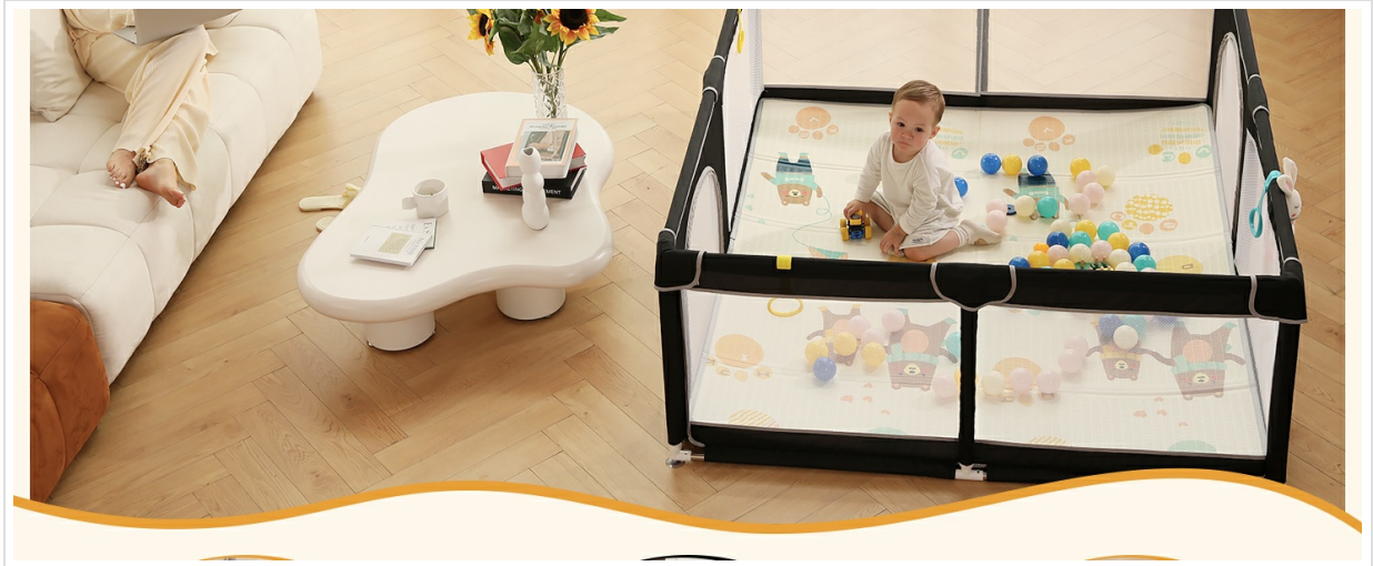
Image: Key safety and convenience features of the playpen, including height, padded corners, and suction cups.