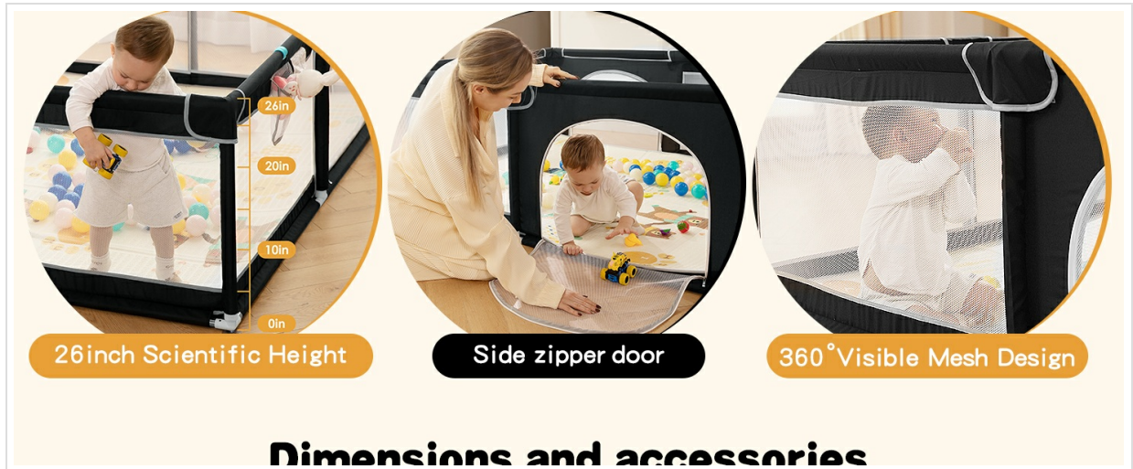
Image: A mother and child using the convenient zippered door for interaction.

The playpen features an external gate with a zipper design, allowing easy access for parents to interact with the baby or for the baby to crawl in and out when supervised. This design provides double protection when closed. Always ensure the zipper is fully closed when your child is inside and unsupervised.