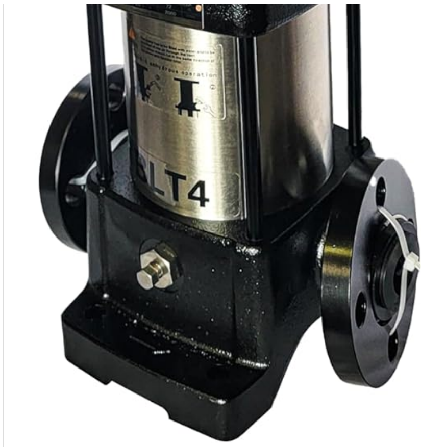
Figure 1: Overview of the Shimge BL(T)8-3-2.2 Vertical Multi-stage Centrifugal Pump. This image shows the main pump unit with its motor, pump head, and flange connections.