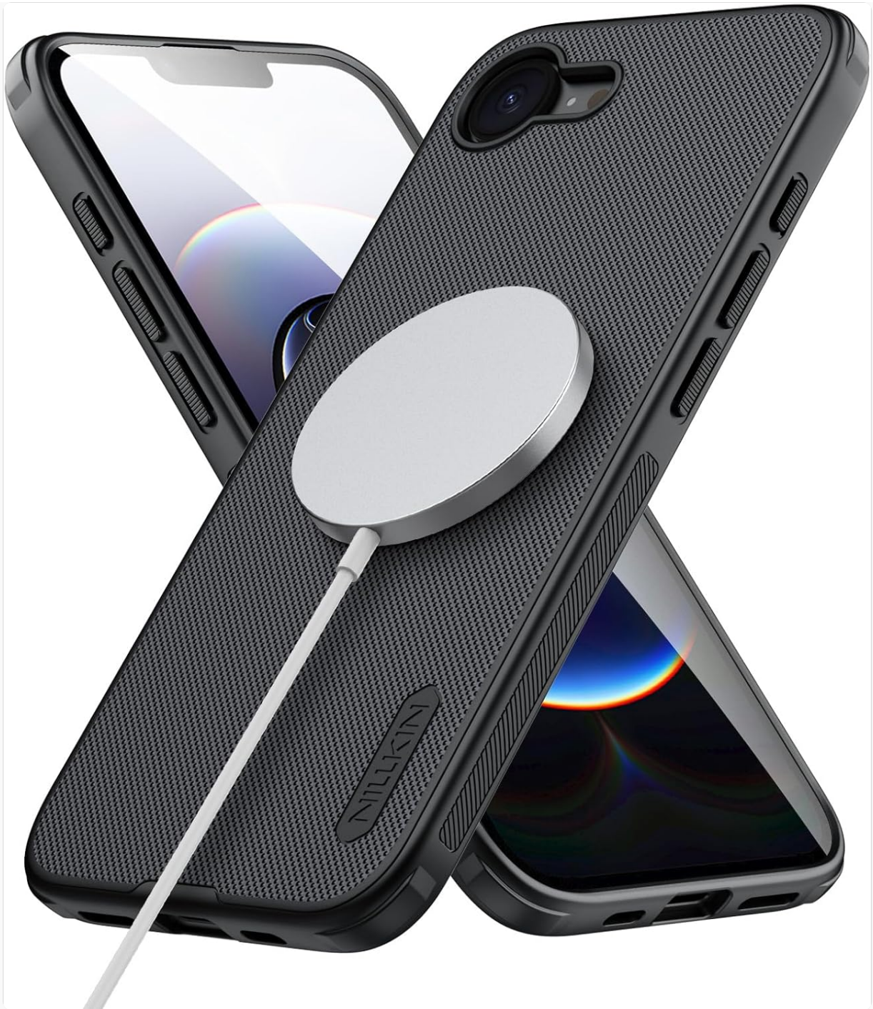
Image 1.1: The Nillkin Magnetic Frosted Shield Pro Case for iPhone 16E, showcasing its design and MagSafe compatibility.