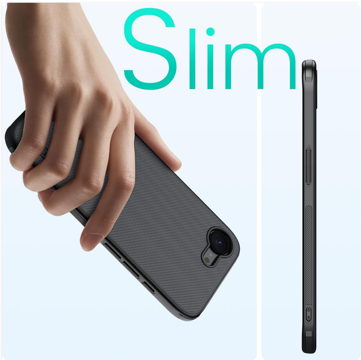
Image 2.1: Demonstrating the slim profile of the case, highlighting ease of handling.