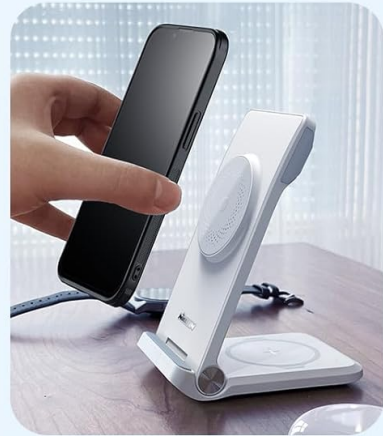
Image 3.1: Illustrates the case's compatibility with MagSafe chargers, wallets, and stands.