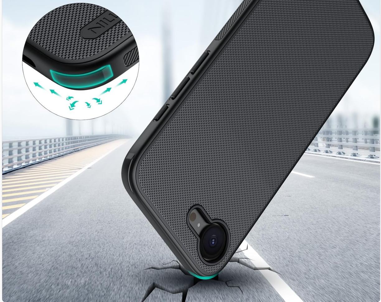
Image 3.3: Depicts the case's high-strength drop protection capabilities.