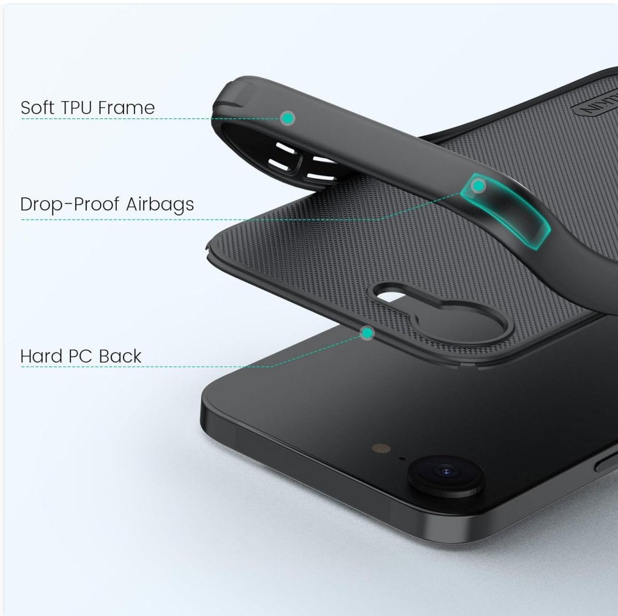
Image 3.5: Exploded view showing the soft TPU frame, drop-proof airbags, and hard PC back.