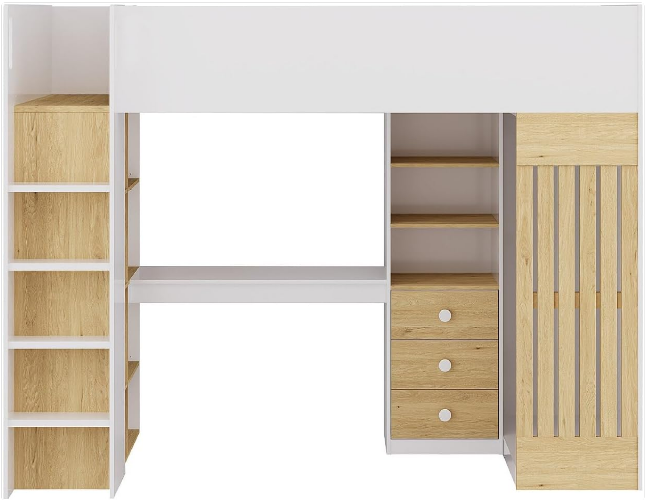
Figure 2: View of the integrated desk, drawers, and shelving units, part of the LORINTI Loft Bed assembly.