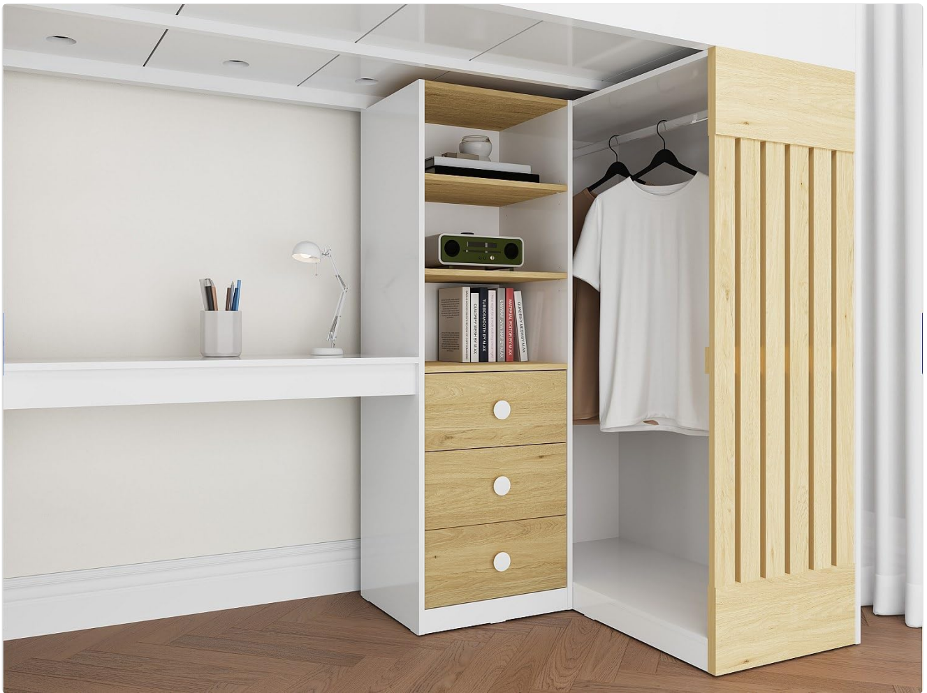
Figure 3: Detailed view of the desk area with integrated drawers and the wardrobe section with a hanging rail.