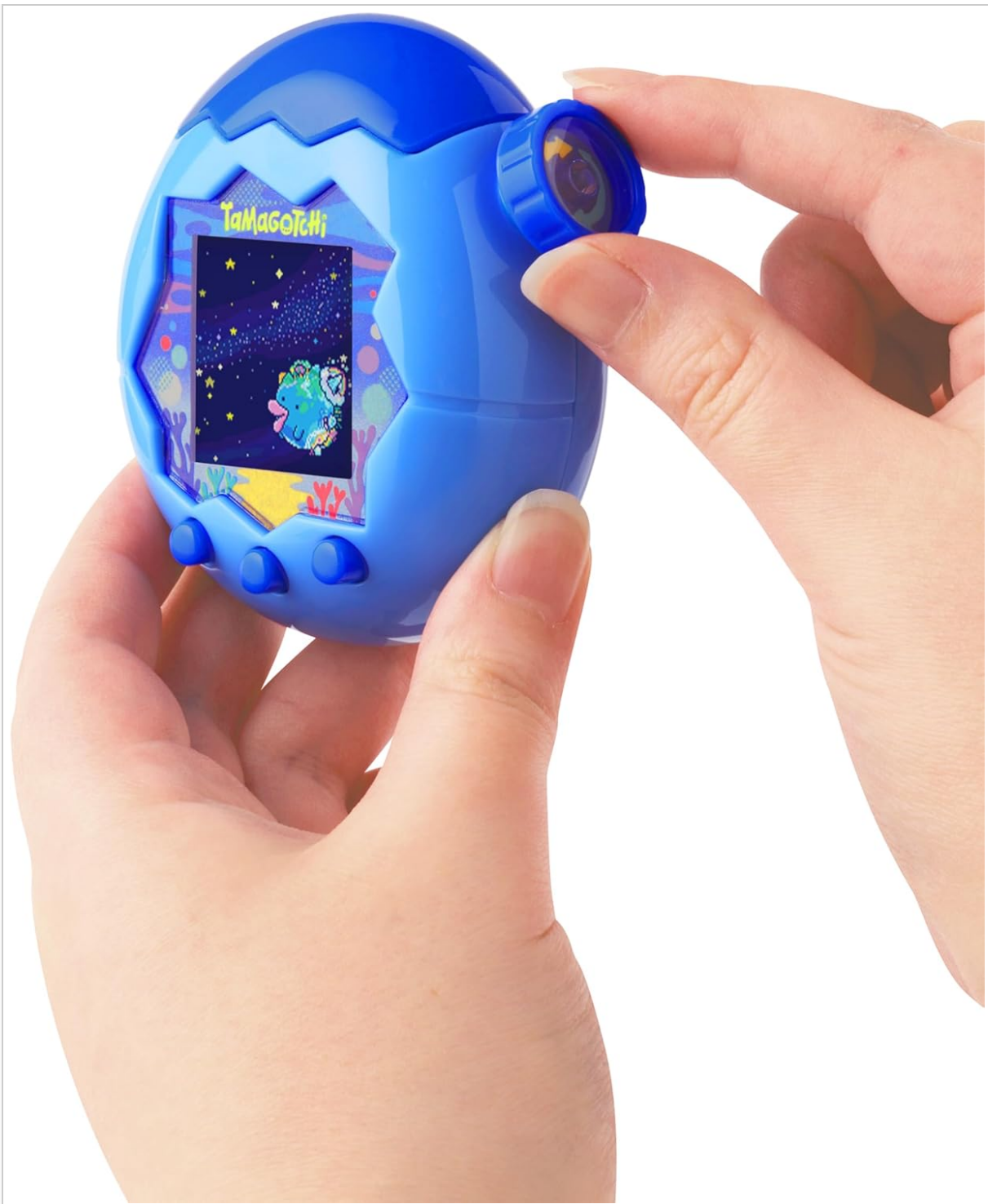
Image: A user's hands operating the Tamagotchi Paradise device, demonstrating the zoom dial and button interactions.