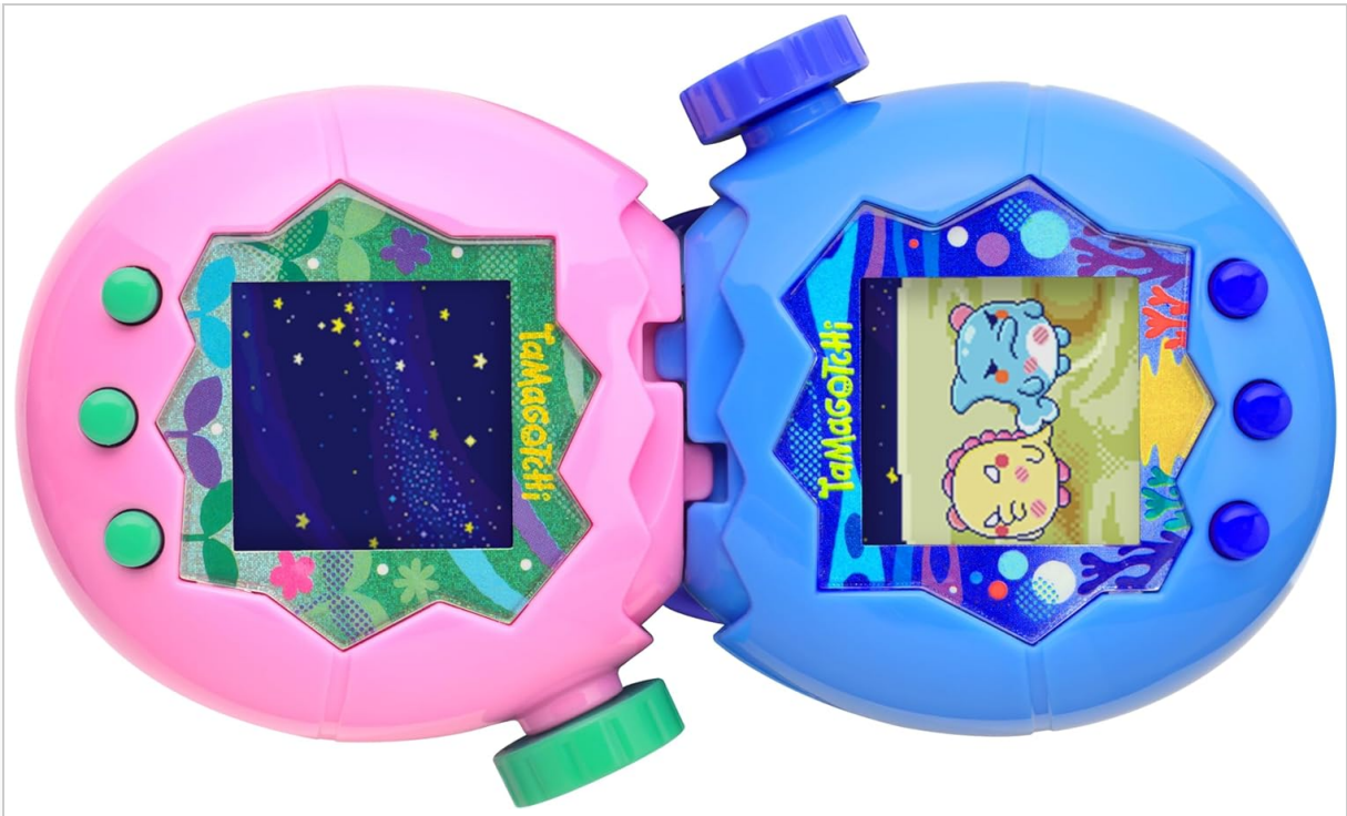
Image: Two Tamagotchi Paradise devices, one pink and one blue, connected side-by-side, illustrating the connection feature.