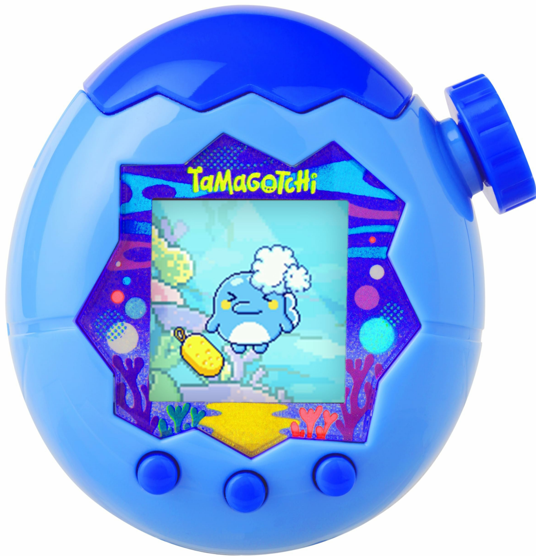
Image: The Tamagotchi Paradise Blue Water device, showcasing its vibrant blue shell and digital screen.