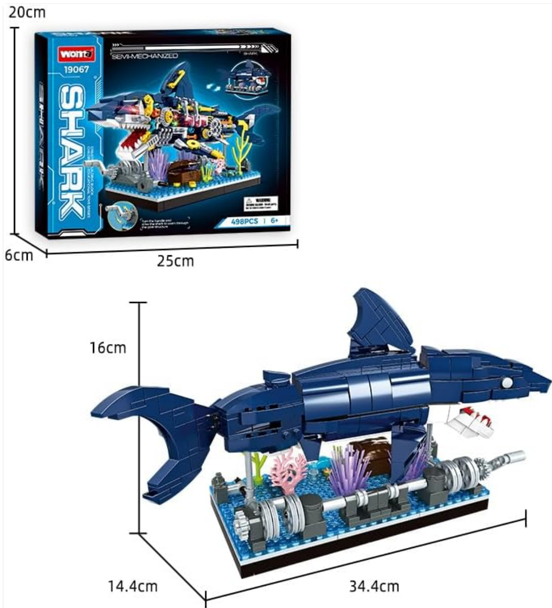
Figure 6: An image providing the physical dimensions of both the product packaging and the assembled shark model, useful for understanding its size.