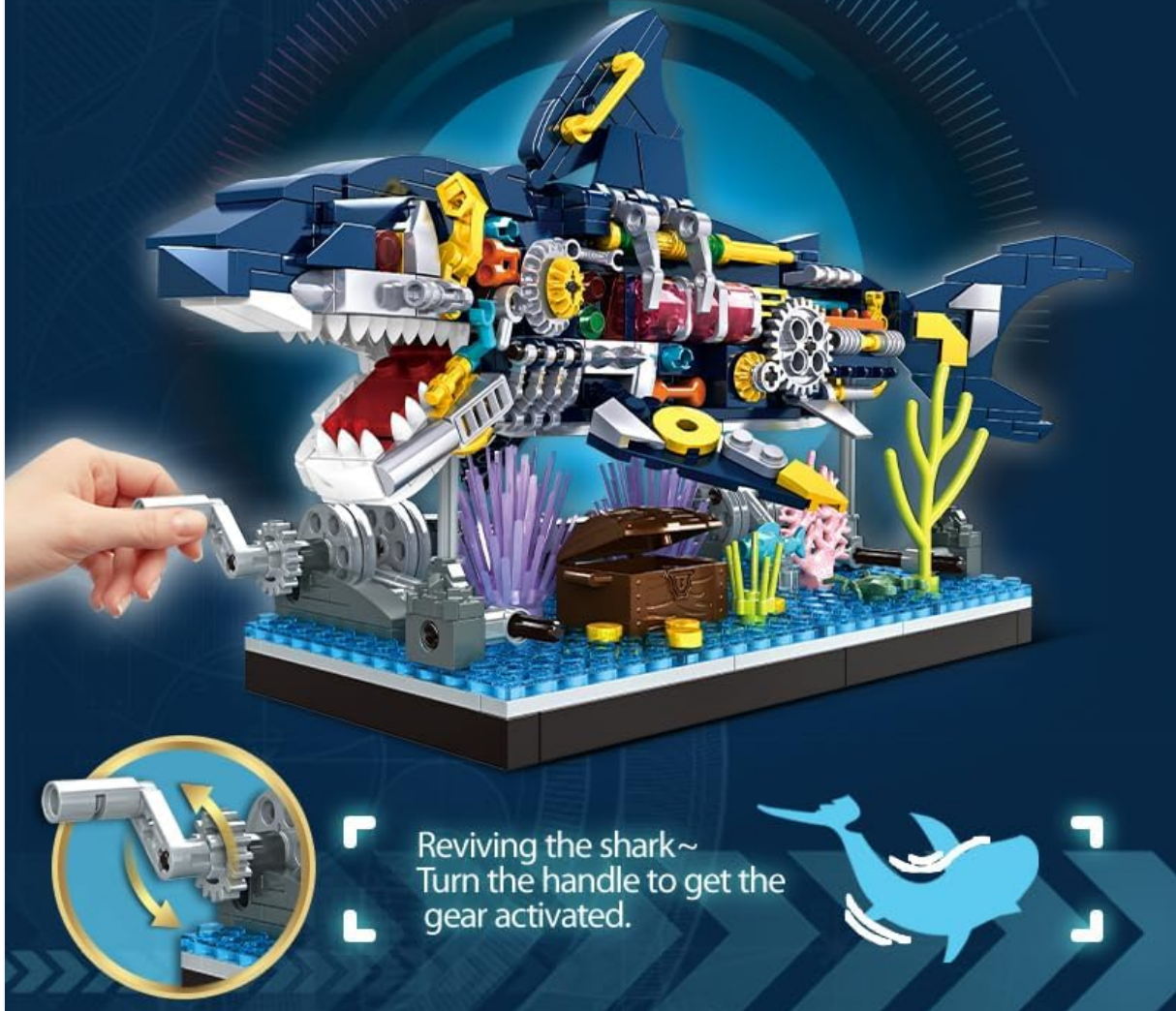
Figure 5: This image illustrates the operation of the semi-mechanized shark, with a hand turning a crank to engage the internal gears, bringing the model to life.