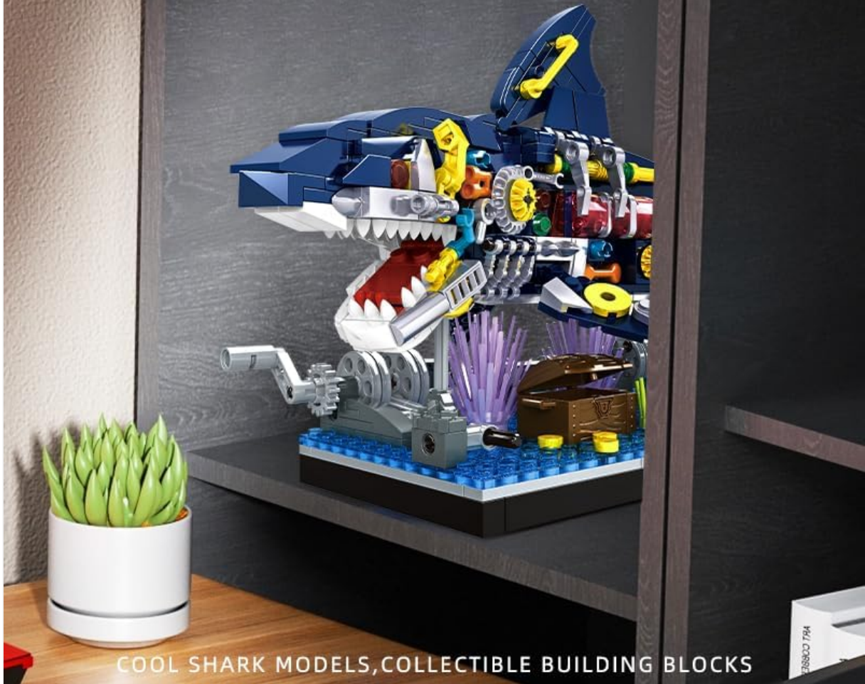
Figure 7: The assembled shark model is shown as a decorative item on a shelf, demonstrating its aesthetic appeal as a tabletop display piece.