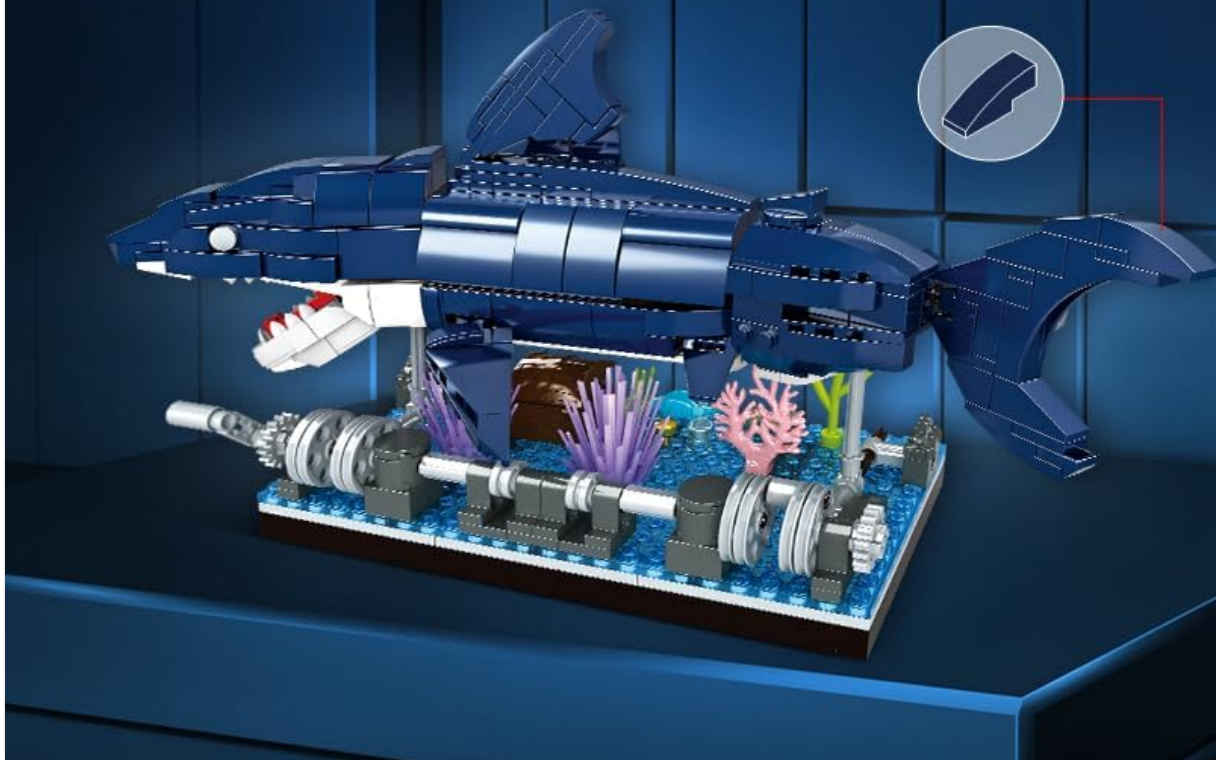
Figure 3: A detailed view emphasizing the mechanical design of the shark model, showcasing how the building blocks form a functional and smooth mechanism.

THE MECHANICAL STRUCTURE IS WELL DESIGNED AND PLACED SMOOTHLY