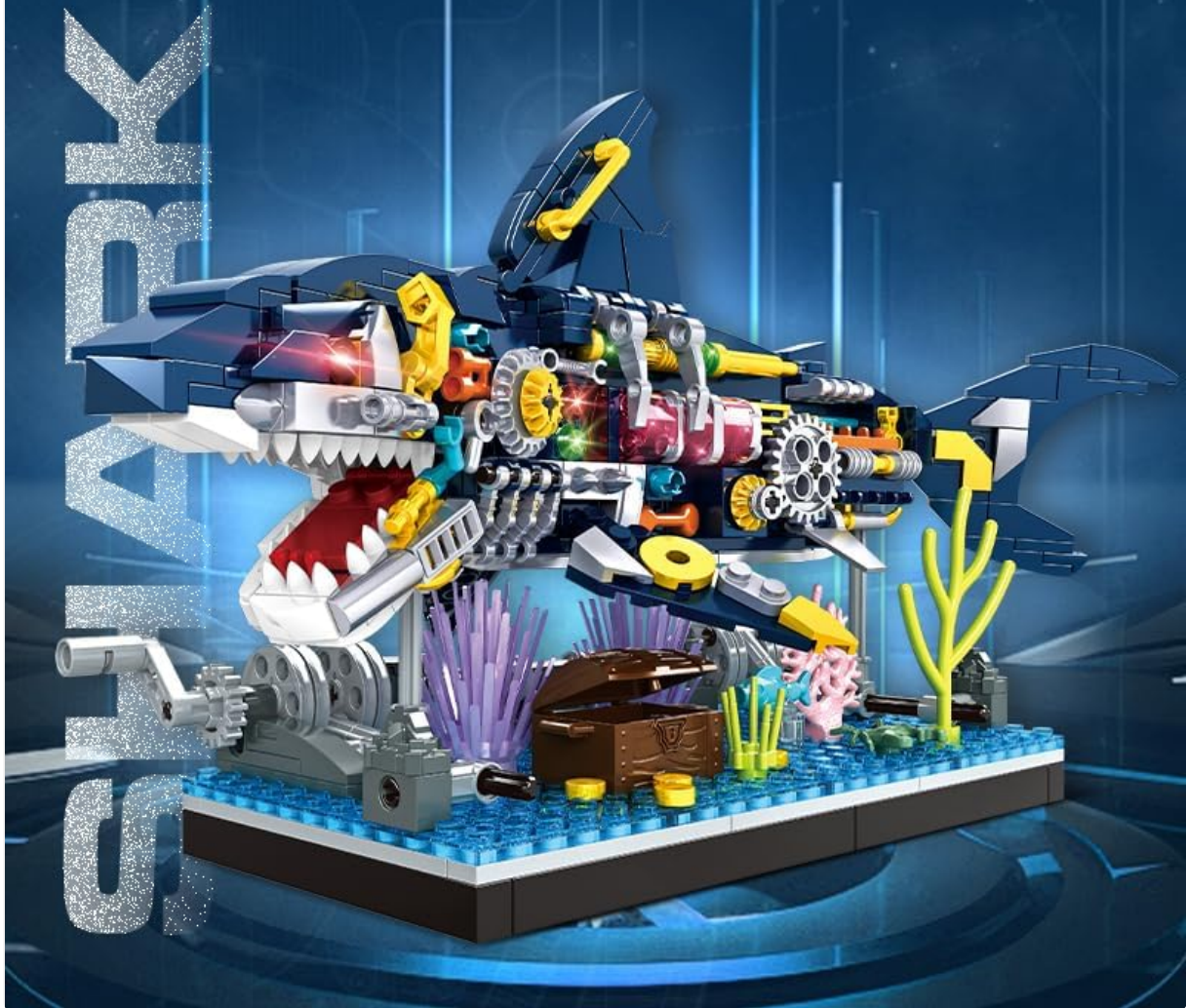
Figure 1: The fully assembled WOMA 19067 Shark Semi-Mechanized Building Block Set, featuring visible internal gears and a detailed seabed base with coral and a treasure chest.