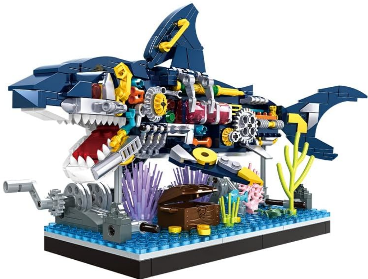
Figure 2: A side view of the assembled shark model, providing a clearer look at the intricate semi-mechanized gears and components within its structure.