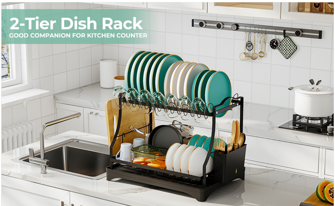
Image: The HANLE 2-Tier Dish Drying Rack, showcasing its design and functionality as a good companion for kitchen counters.

The HANLE 2-Tier Stainless Steel Dish Drying Rack is designed to efficiently organize and dry your kitchenware, saving valuable counter space. Constructed from durable carbon steel, this rack offers a robust and rust-resistant solution for your daily dish drying needs. Its thoughtful design includes a large capacity, a 360° rotatable auto-draining drainboard, and dedicated holders for utensils and cups.