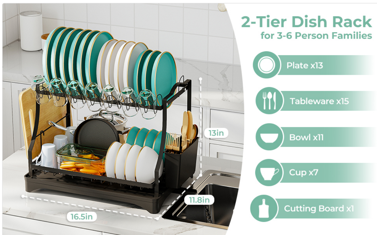
Image: A visual guide detailing the capacity of the dish rack, indicating space for plates, tableware, bowls, cups, and a cutting board.

The HANLE dish drying rack is designed for optimal drying and organization. Utilize its features to maximize efficiency in your kitchen.