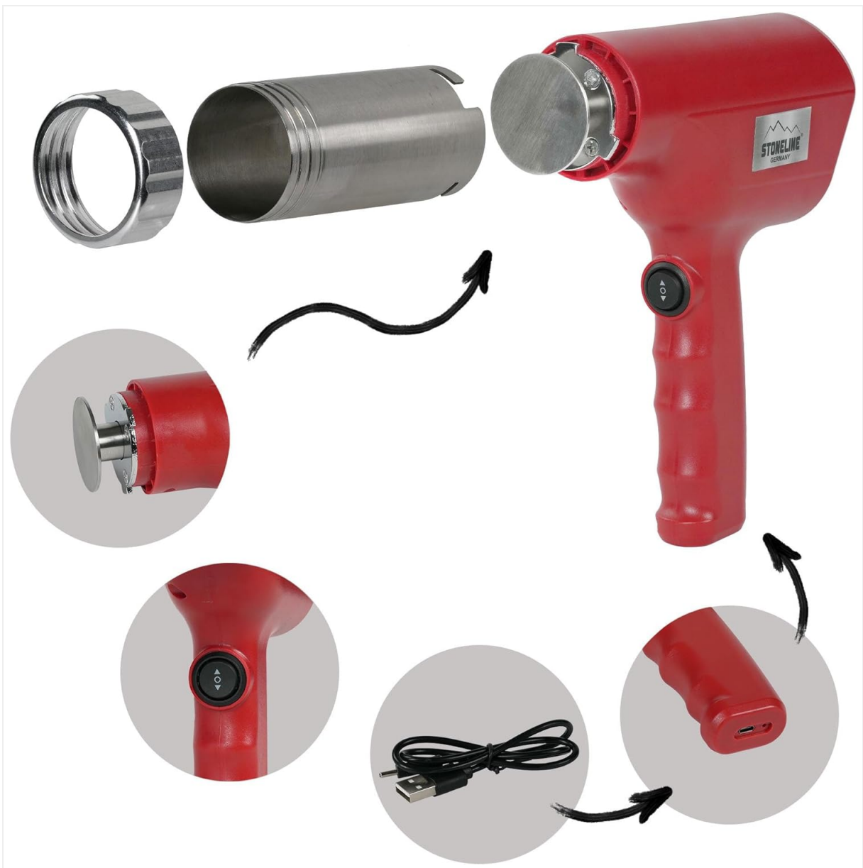
Image: An exploded diagram illustrating the main components of the pasta maker, including the motor unit, dough tube, and end cap with attachment.