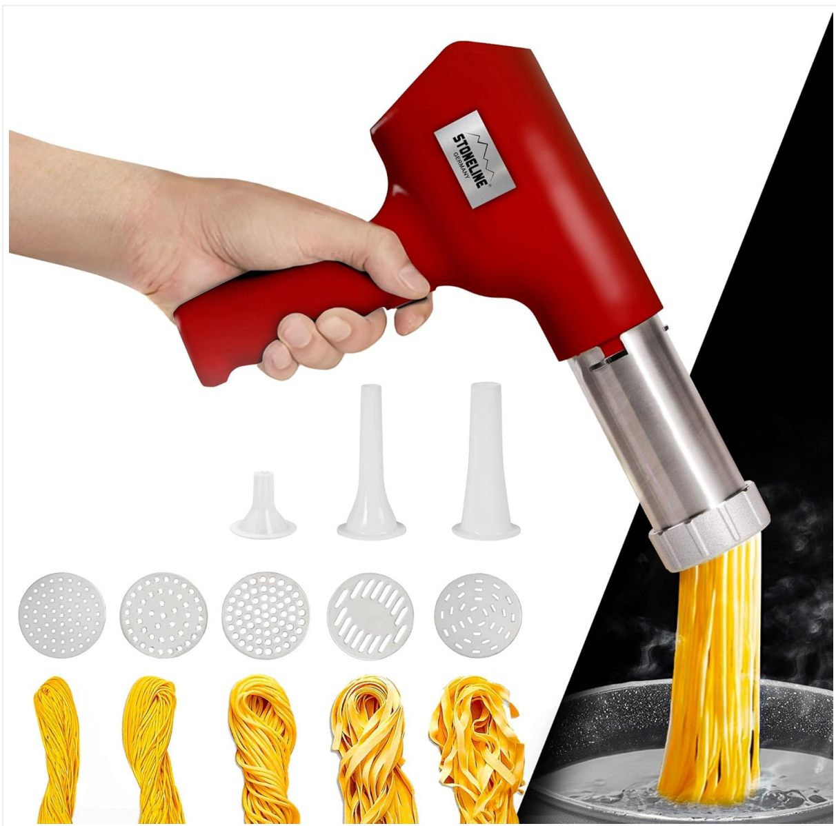
Image: The pasta maker shown alongside different pasta shapes it can produce, including spaghetti, tagliatelle, and gnocchi, highlighting its versatility.