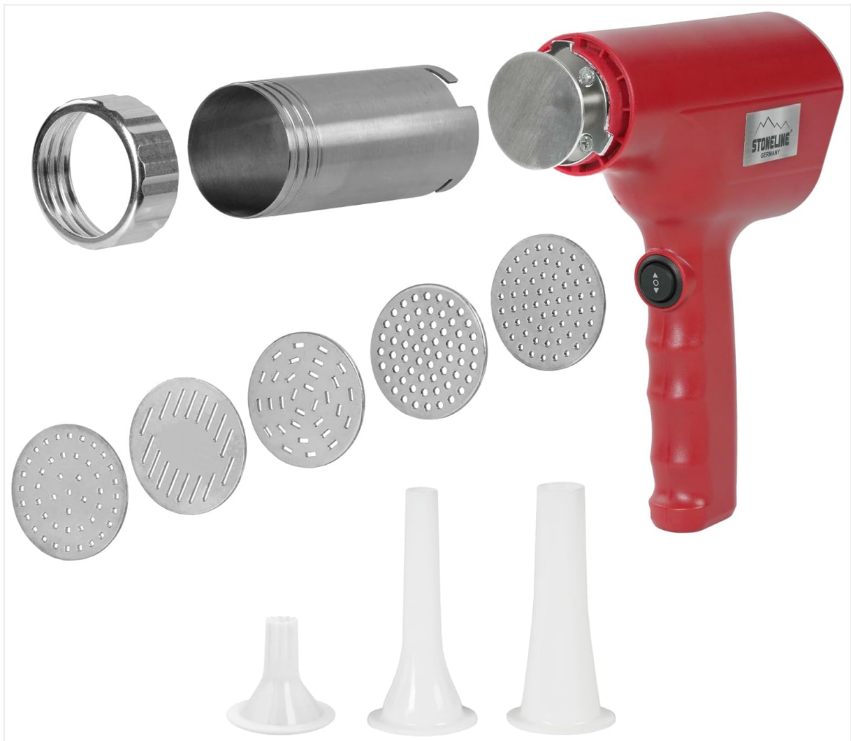
Image: All components of the STONELINE Electric Pasta Maker, including the main unit, various pasta discs, and gnocchi funnels.