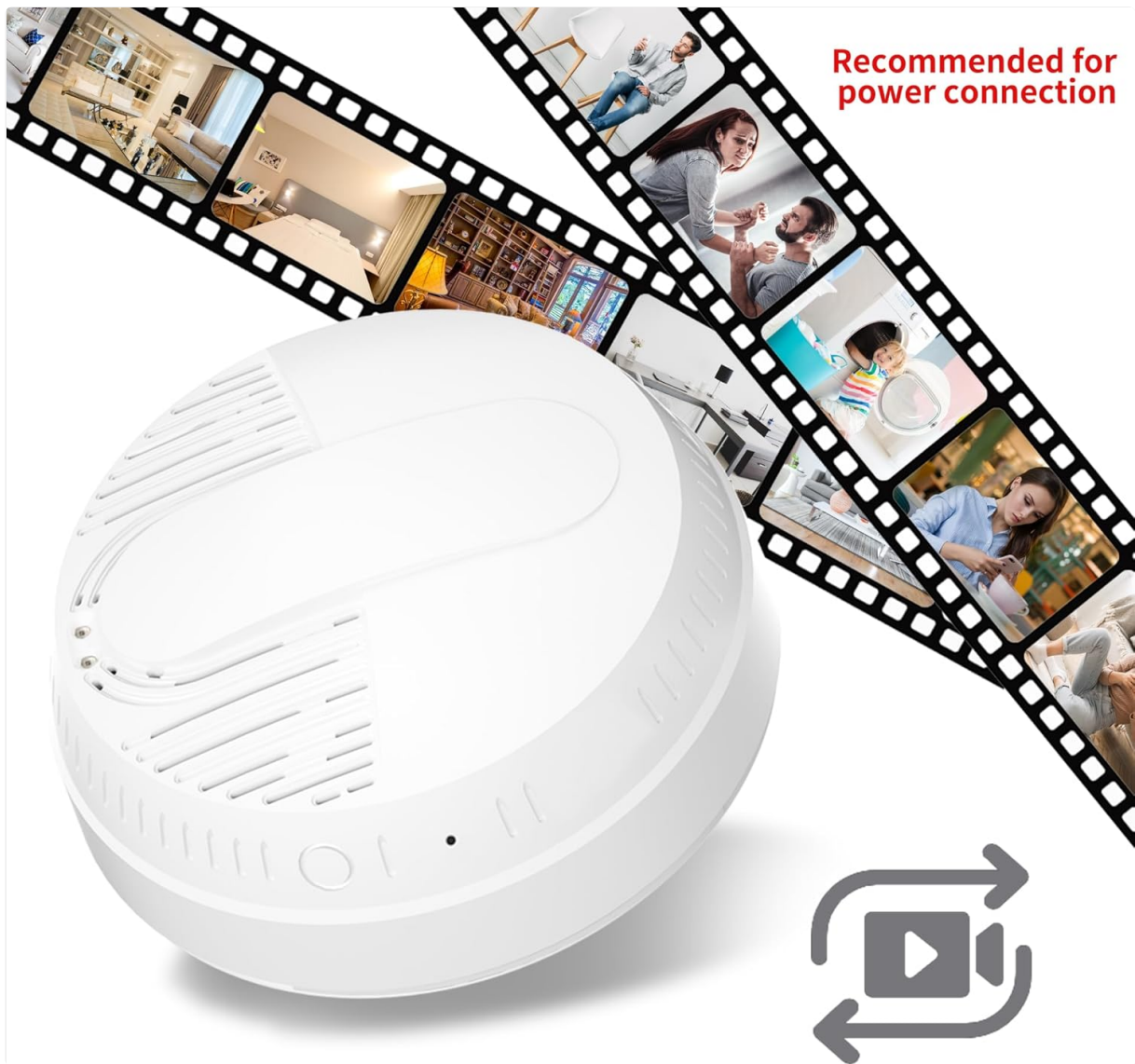
Image: Visual representation of the motion detection feature of the LIZVIE S100-10 camera, showing alerts on a smartphone when suspicious activity is detected.