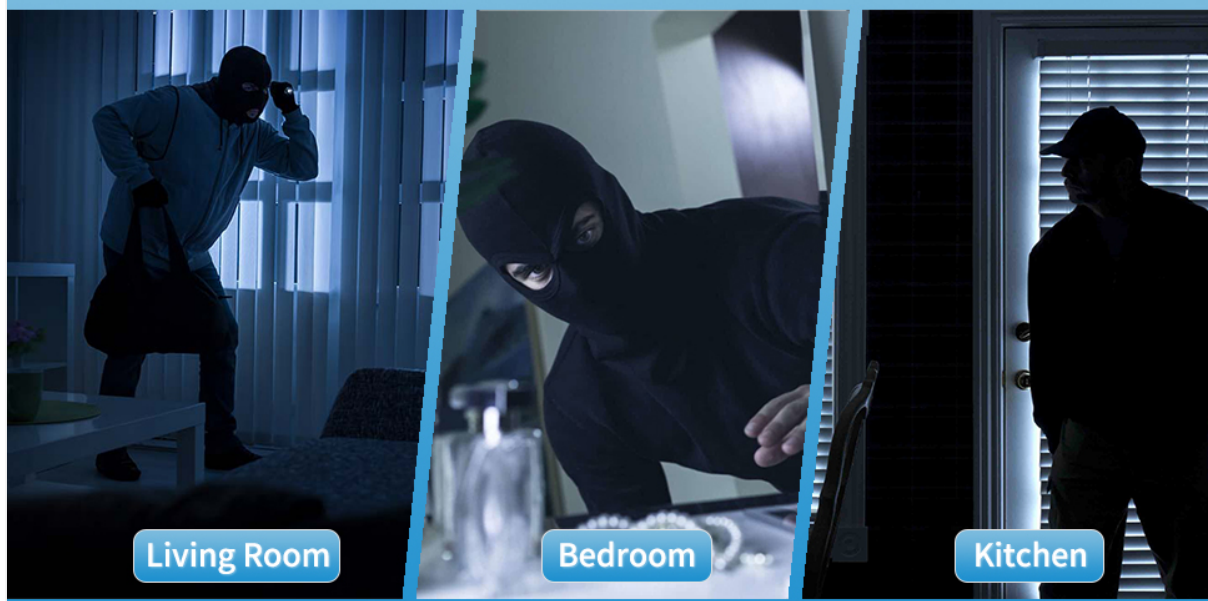
Image: Depiction of the LIZVIE S100-10 camera's night vision feature, showing enhanced image clarity in a dark room with a person in the foreground.