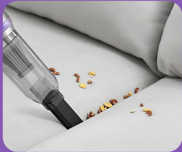
Figure 5: Versatile use in car and home. This image shows the vacuum cleaner being used to clean a car's cup holder and a sofa, highlighting its adaptability for both automotive and household cleaning tasks.

Interior spaces such as beds, sofas, carpets, etc.