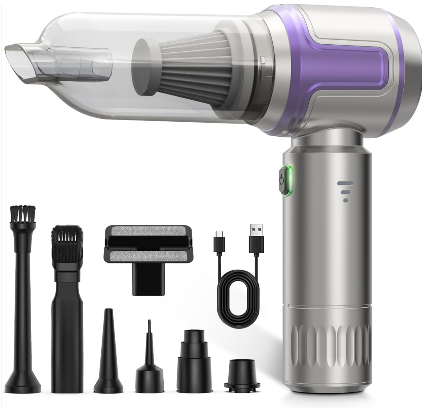
Figure 1: Main unit and included accessories. This image displays the compact handheld vacuum cleaner along with its various attachments, including brush nozzles, crevice tools, and charging cable.