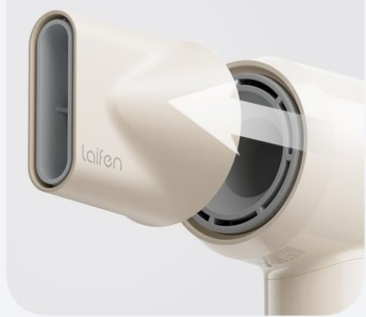
Image: Highlights the dual-layer filter and the snap-on nozzle, key features for maintenance and styling.