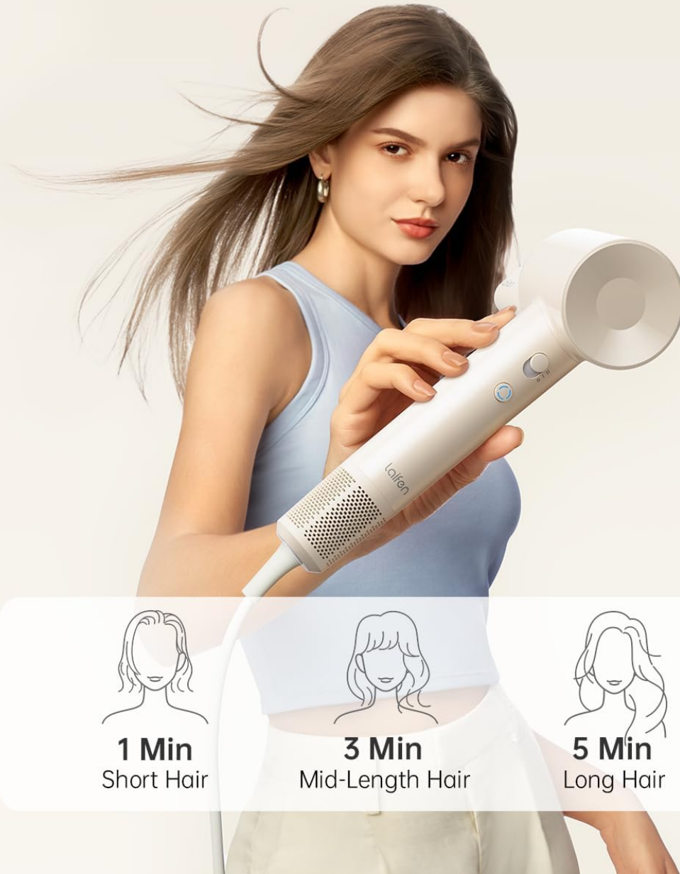
Image: Demonstrates the quick drying capability of the Laifen SE Lite for various hair lengths.