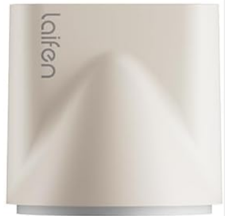
Image: The Laifen SE Lite Hair Dryer in Milktea color, shown with its single nozzle attachment.