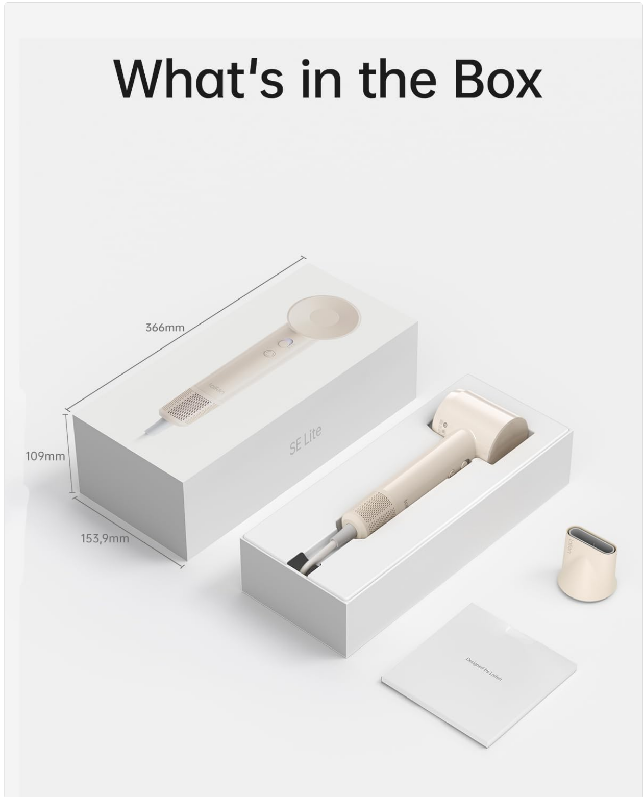
Image: The Laifen SE Lite Hair Dryer and its accessories neatly arranged within its packaging.