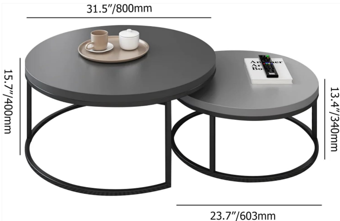
Image: Detailed dimensions of the nesting coffee tables.