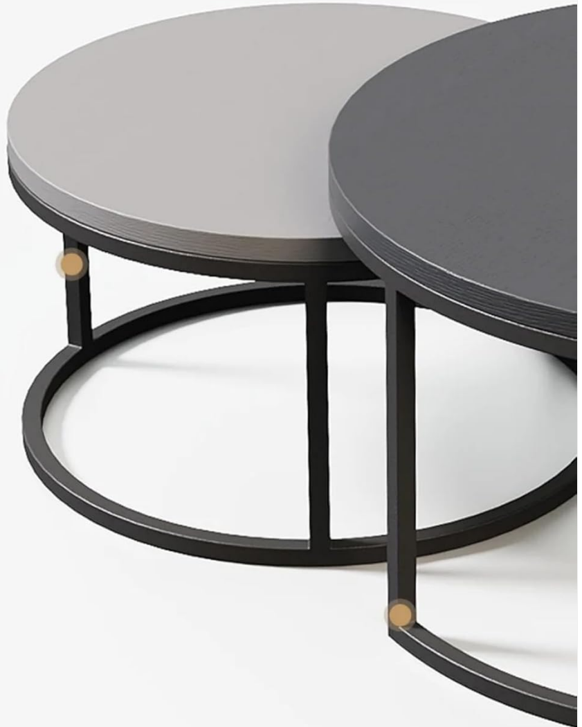
Image: Detail of the carbon steel frame providing stability to the nesting coffee tables.