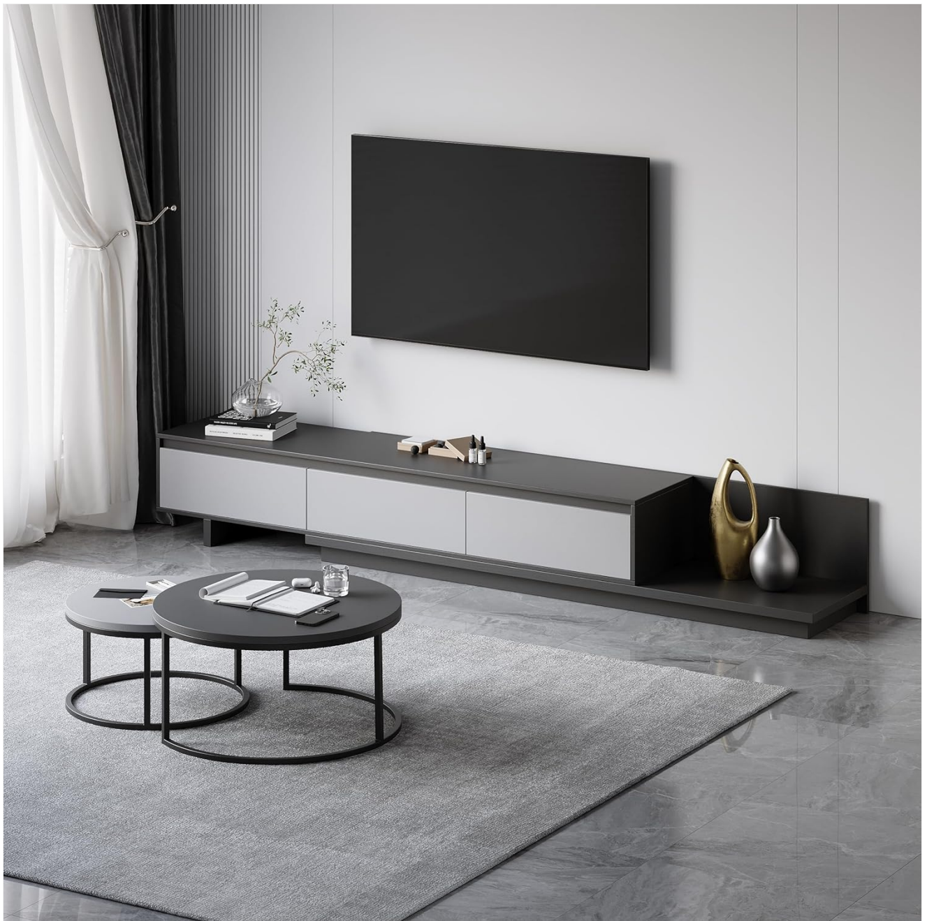
Image: The TV stand features three spacious drawers with a hidden pull design for organized storage.