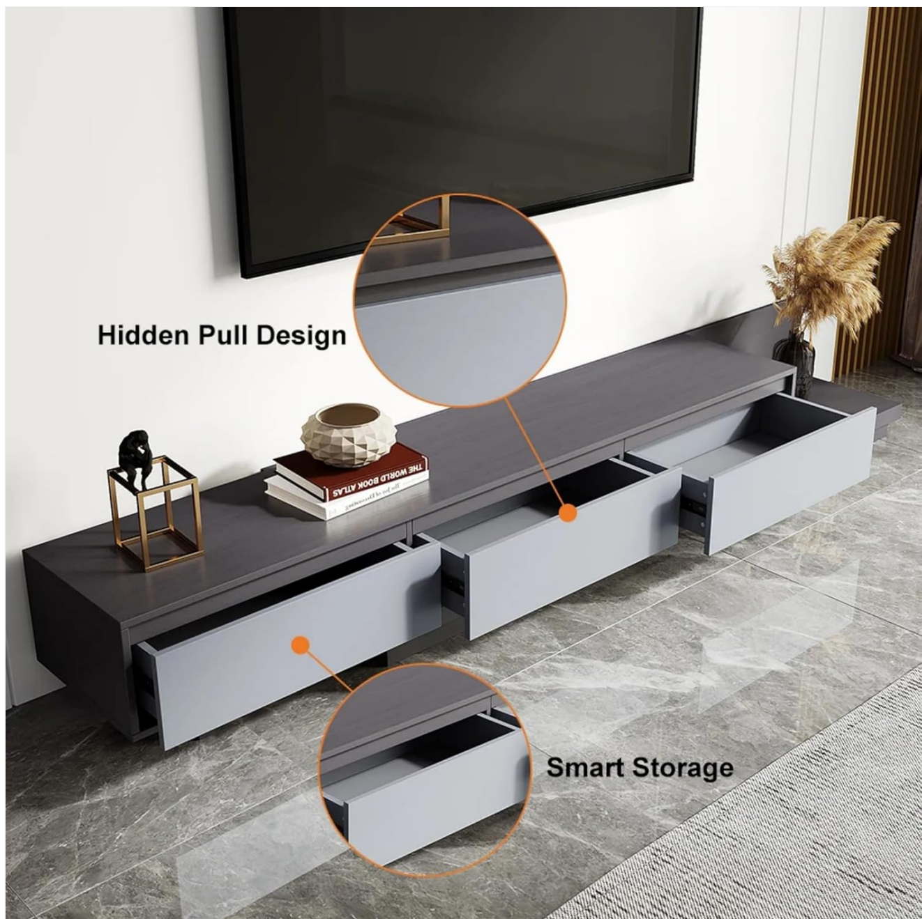
Image: The TV stand demonstrating its partially extended and fully retracted configurations.