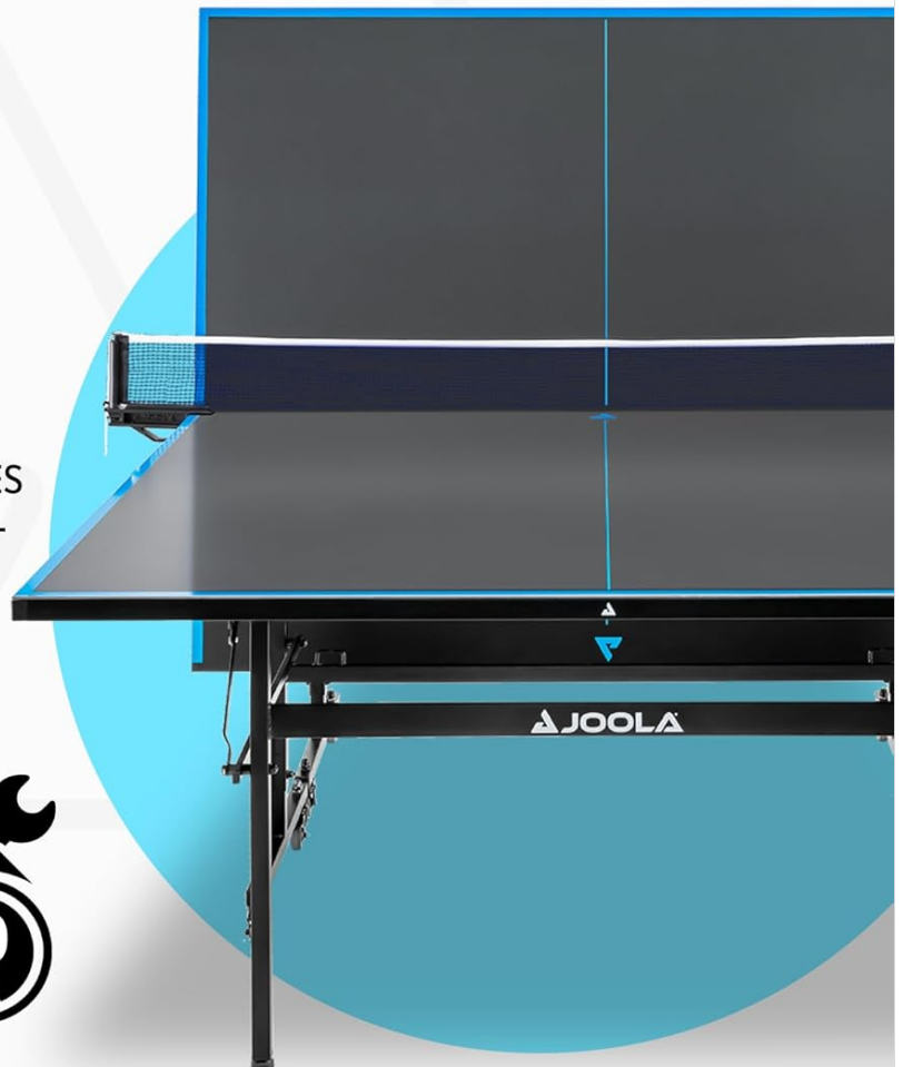
Figure 2: Visual representation of the quick assembly process and key features.