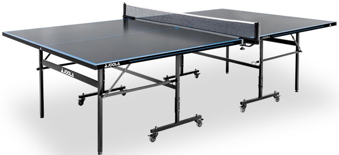
Figure 1: Fully assembled JOOLA NOVA Outdoor Table Tennis Table.