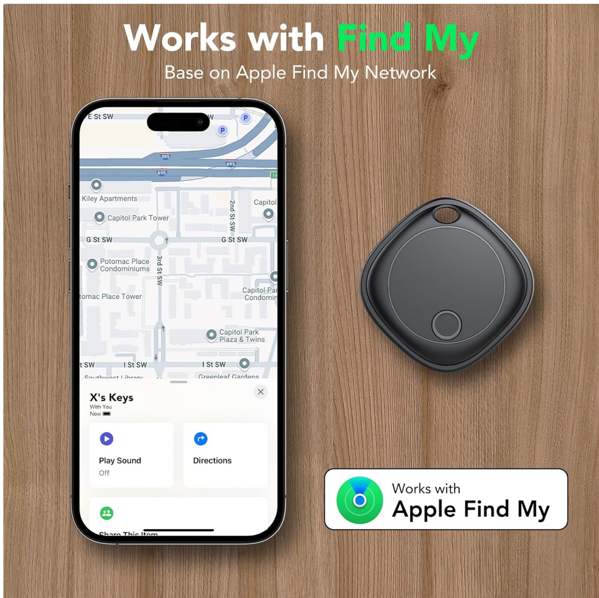
Image: An iPhone screen showing the "Play Sound" option within the Find My app, next to an Ajblg Air Tracker Tag. This illustrates how to make the tracker emit a sound to find nearby items.