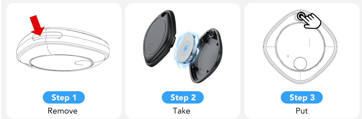
Image: A three-step diagram illustrating the process of replacing the battery: Step 1 shows how to remove the cover, Step 2 shows taking out the old battery, and Step 3 shows putting in a new battery.