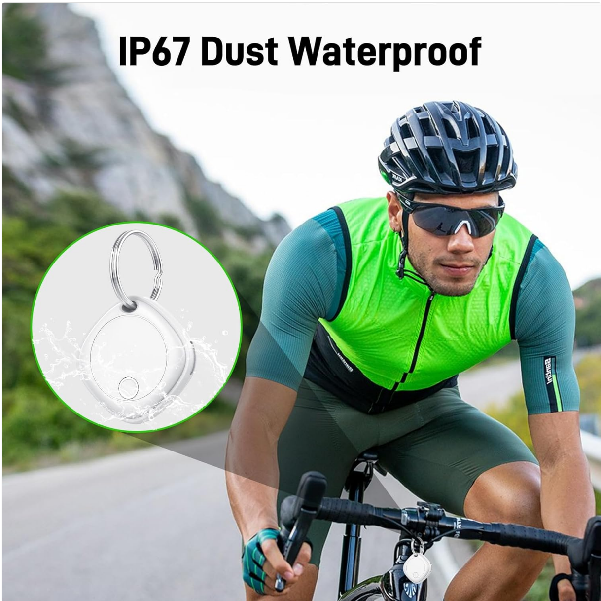
Image: An Ajblg Air Tracker Tag with water droplets on its surface, demonstrating its IP67 dust and water resistance. The image shows the tracker attached to a cyclist's gear.