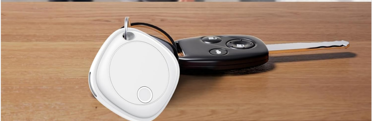
Image: An iPhone displaying a "Key left behind" notification, indicating the item is no longer detected nearby. An Ablg Air Tracker Tag attached to a set of keys is shown in the foreground.

This item is no longer detected near you. It was last seen near Home.