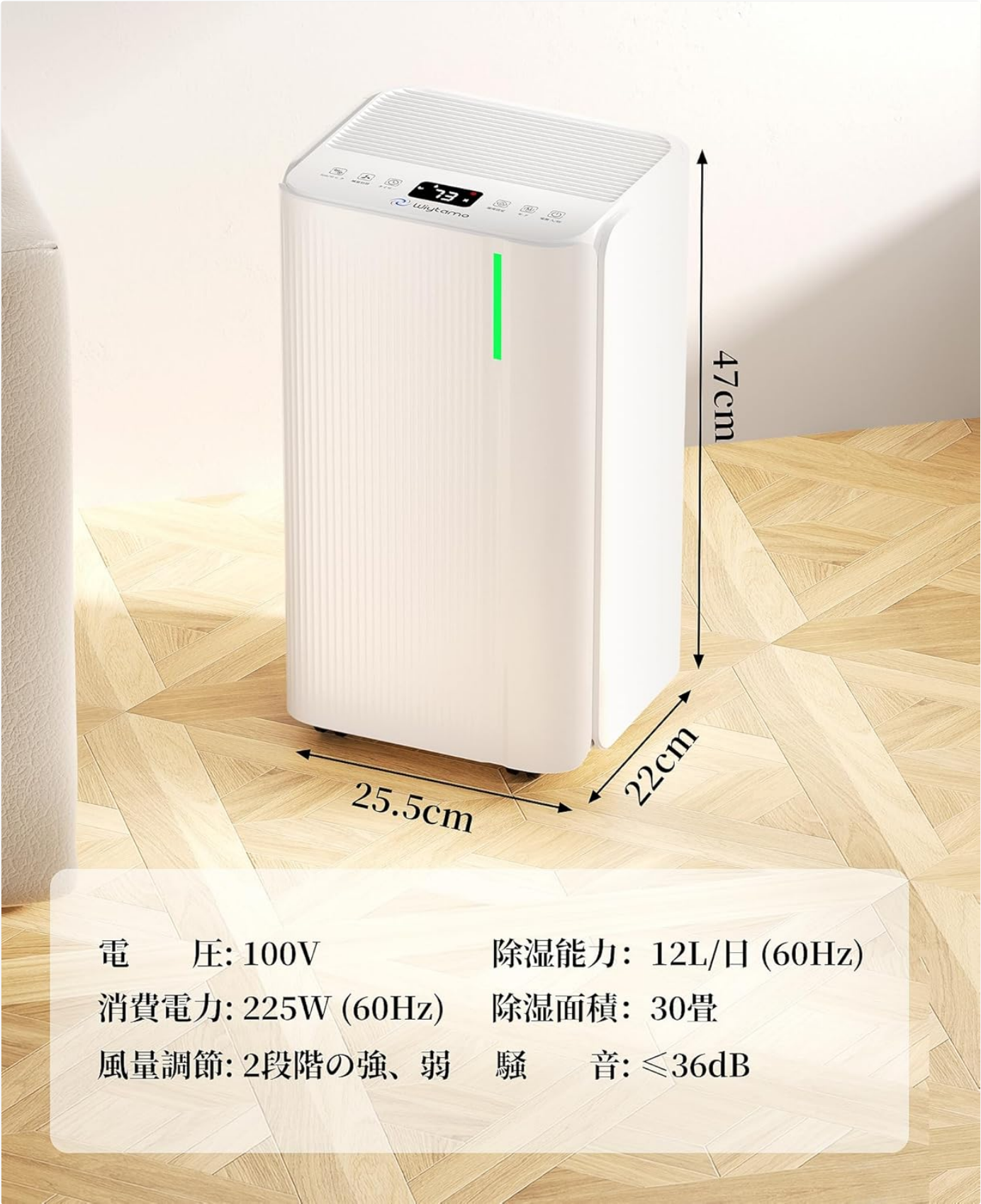
Visual representation of the dehumidifier's dimensions and key specifications.