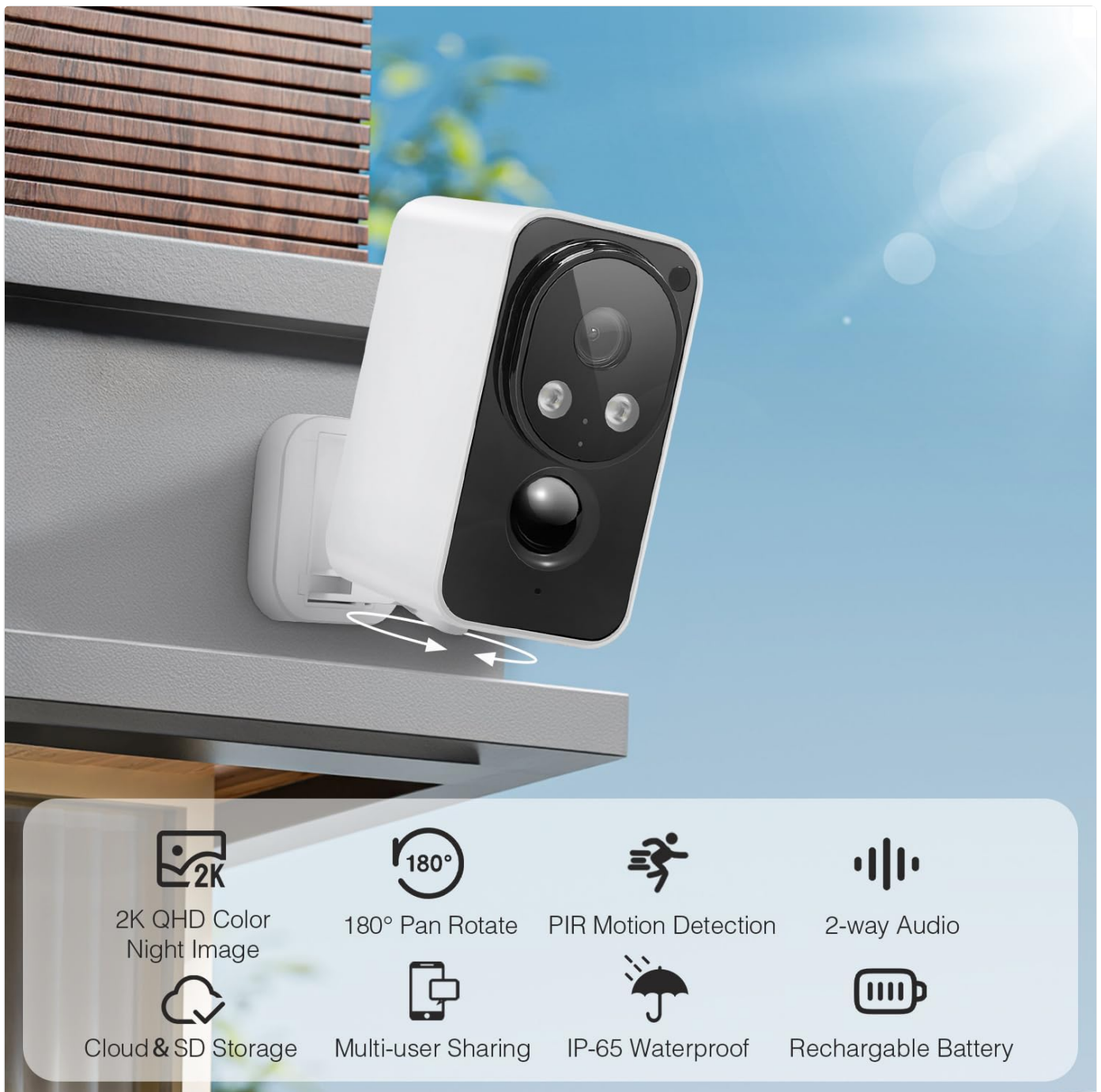
Figure 2: Overview of Camera Features.