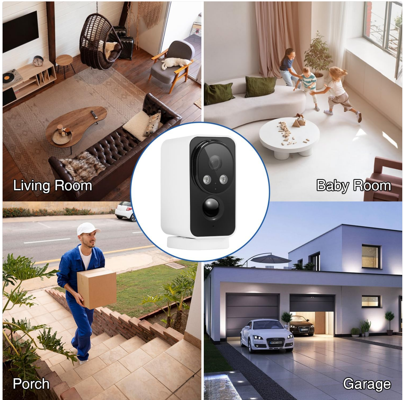
Figure 3: Versatile Placement Options for Your Camera.

The camera supports both desktop placement and wall hanging. For wall installation, use the provided mounting bracket, screws, and wall anchors. Drill holes as indicated by the positioning sticker, then secure the bracket and hang the camera. Adjust the camera angle for optimal viewing. A screwdriver may be needed to tighten the screw on the camera holder for desired angle.