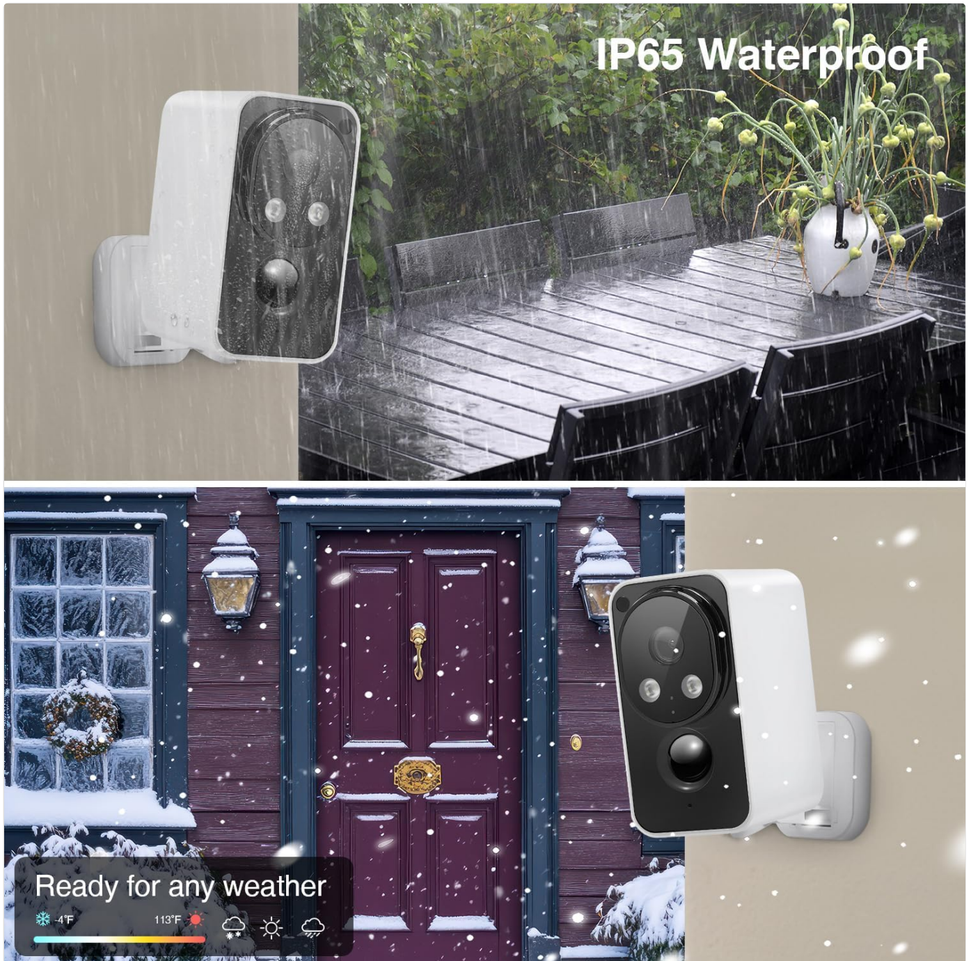
Figure 8: IP65 Waterproof and All-Weather Durability.

The camera has an IP65 waterproof rating, making it resistant to dust and water jets. It is designed to withstand various weather conditions, including rain and snow, within its specified temperature range.