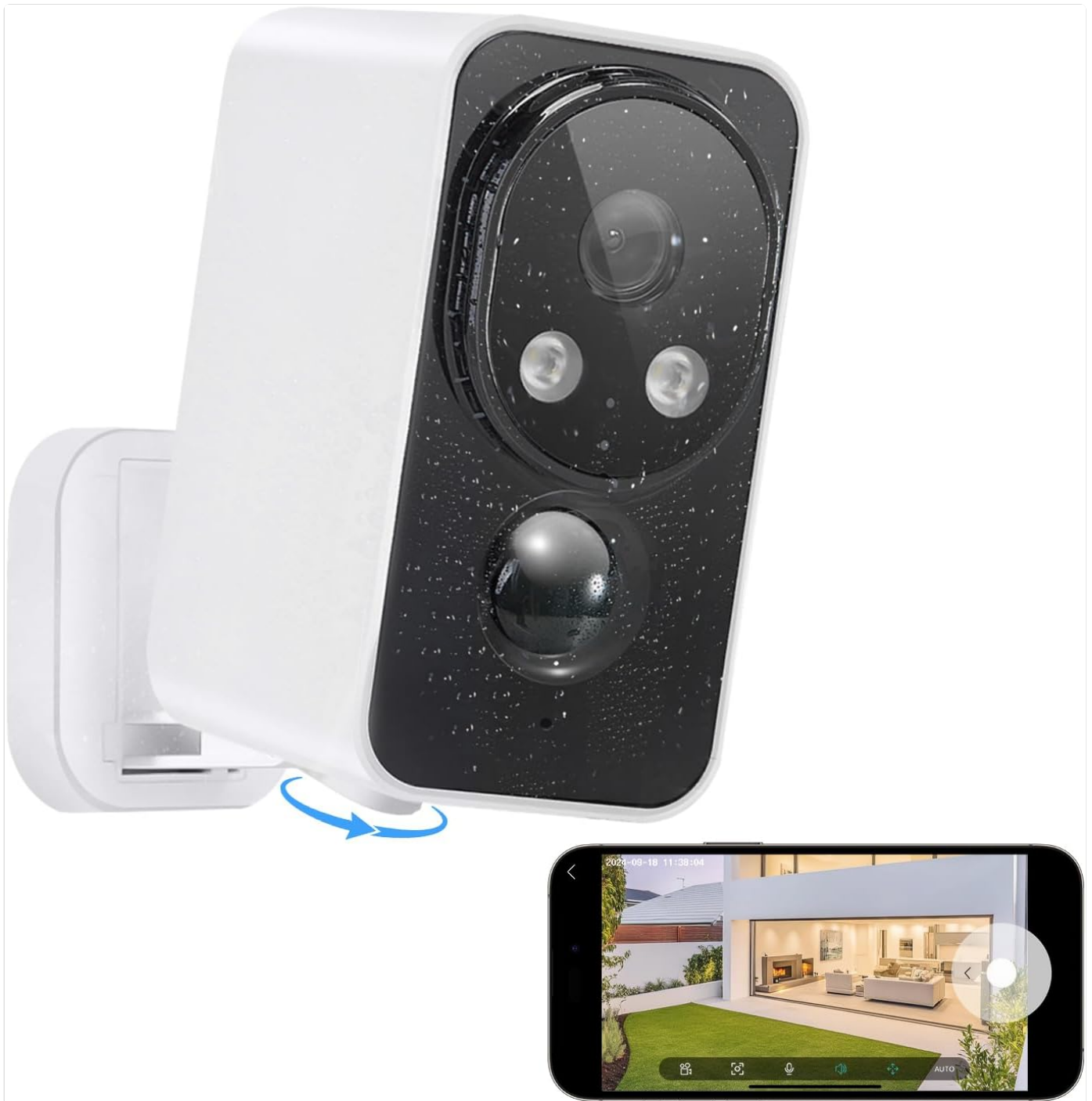
Figure 1: ObbmoX Wireless Outdoor Security Camera and Live View on Smartphone.