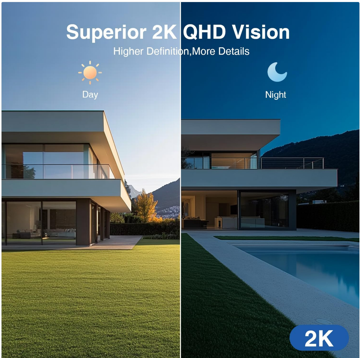
Figure 6: Superior 2K QHD Vision Day and Night.