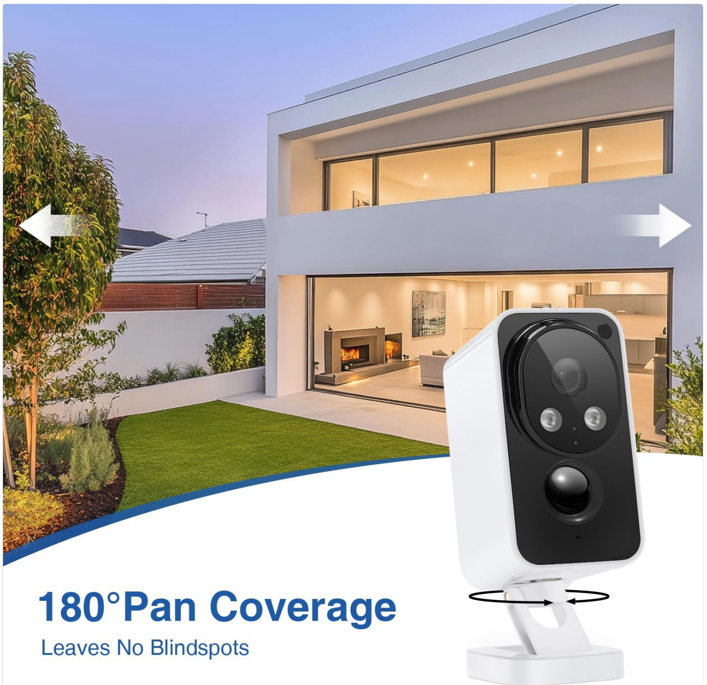
Figure 5: 180° Pan Coverage for Comprehensive Monitoring.