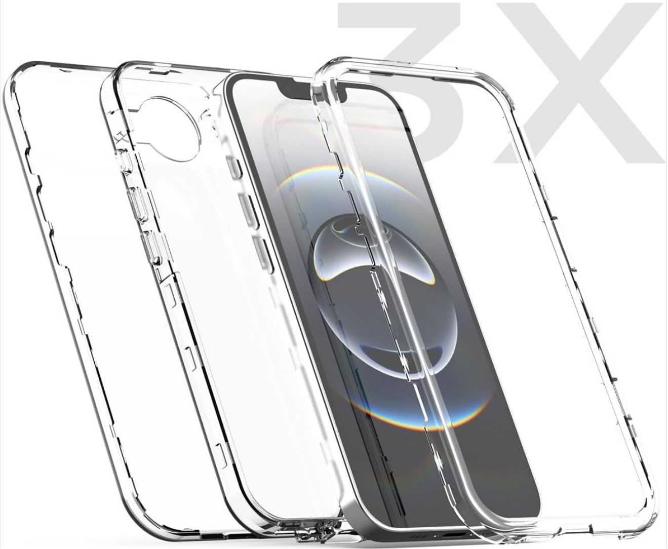
Image: The multi-layer design of the AICase Clear Case, illustrating the three distinct protective components.

3 LAYERS OF FRONT AND REAR FOR DROP PROOF PROTECTION