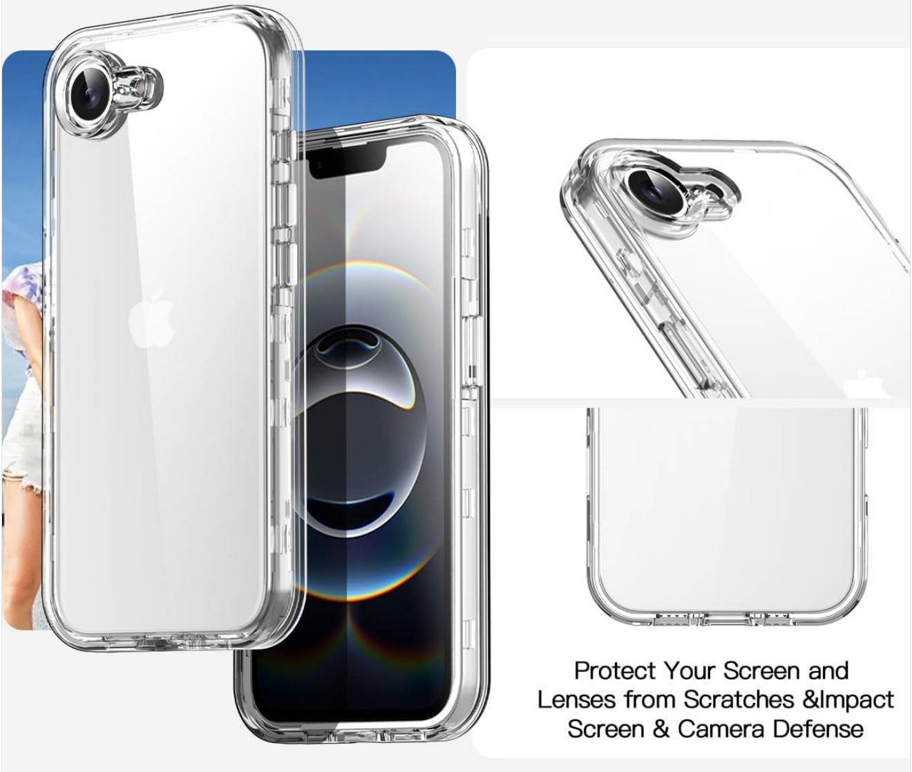
Image: The AICase Clear Case highlighting the integrated camera shield and overall drop protection for the iPhone 16E.