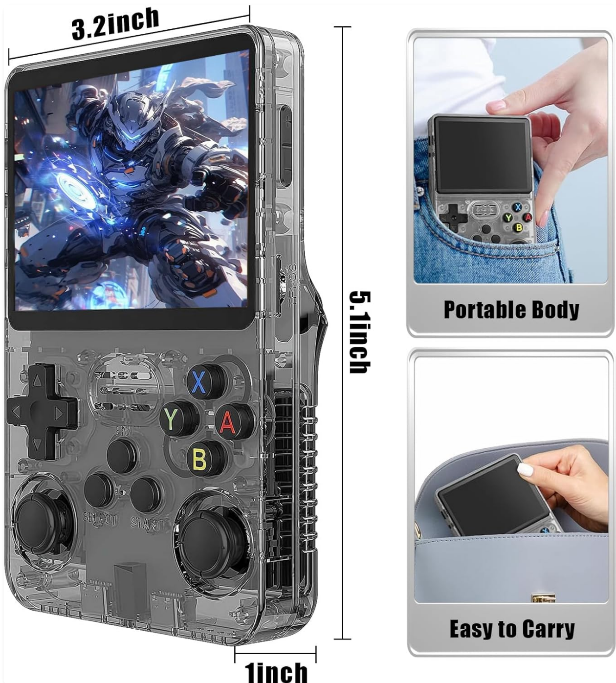
Figure 2: QISHENKOLA R36S Dimensions and Portability. The console measures approximately 5.1 inches in height, 3.2 inches in width, and 1 inch in thickness, making it easy to carry in a pocket or bag.