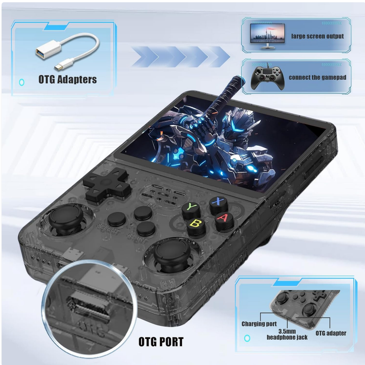
Figure 3: External Device Connectivity. The console can connect to a large screen output and external gamepads via an OTG adapter.