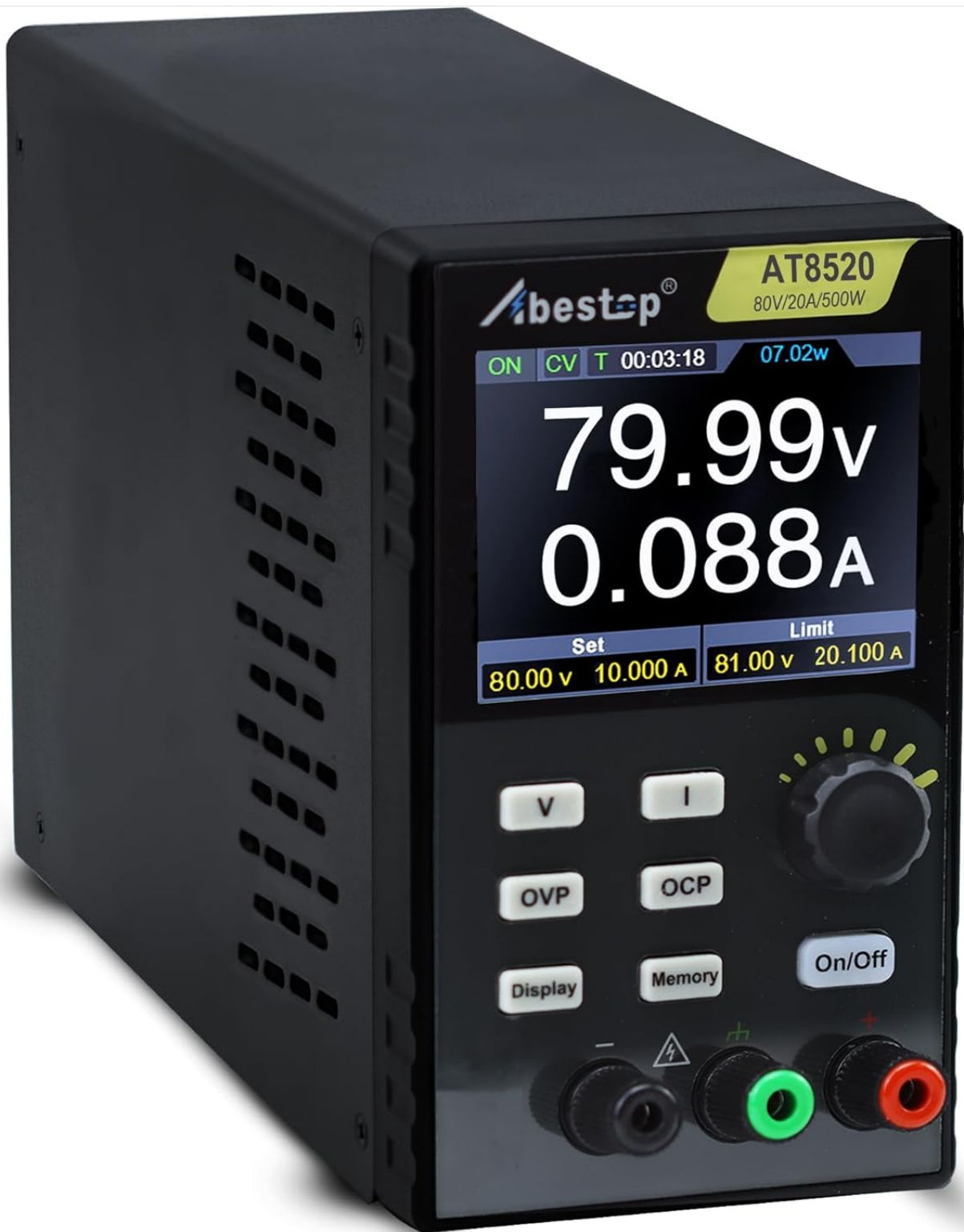
Figure 1.1: Front view of the Abestop AT8520 DC Power Supply, showing the display and control interface.