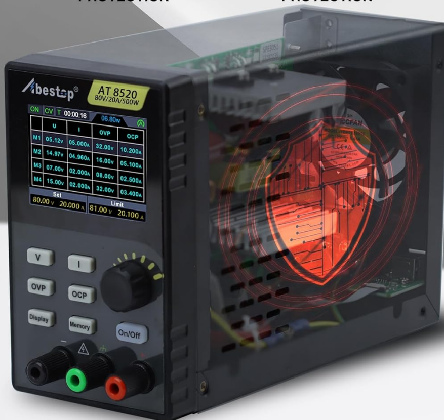
Figure 6.2: Visual representation of the AT8520's integrated protection mechanisms.