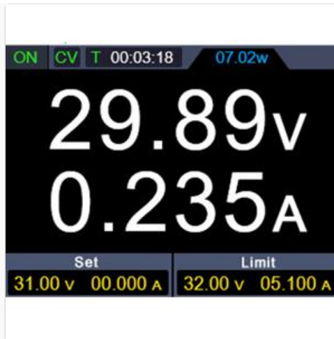
Figure 6.1: The 2.8-inch IPS LCD displaying set and actual voltage/current values.