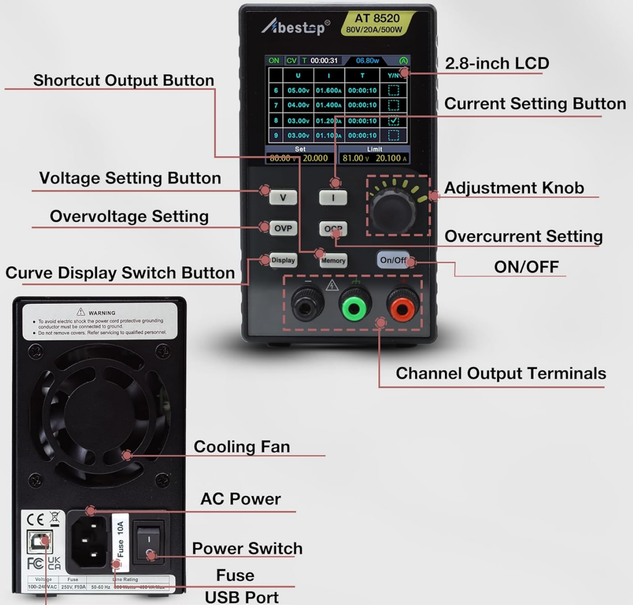
Figure 4.1: Front and rear panel components of the AT8520.