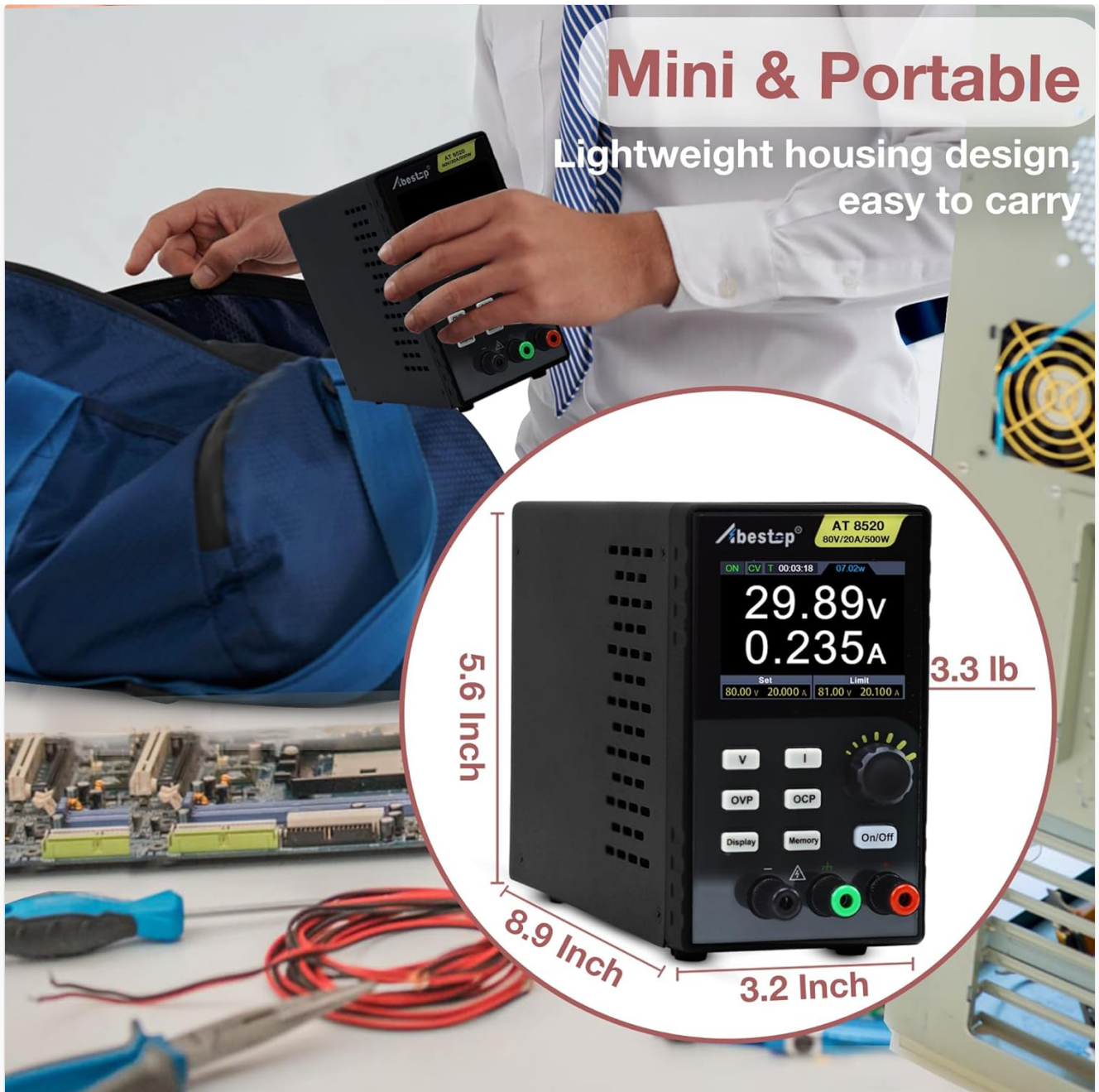
Figure 9.1: Dimensions of the Abestop AT8520 power supply.

Lightweight housing design, easy to carry