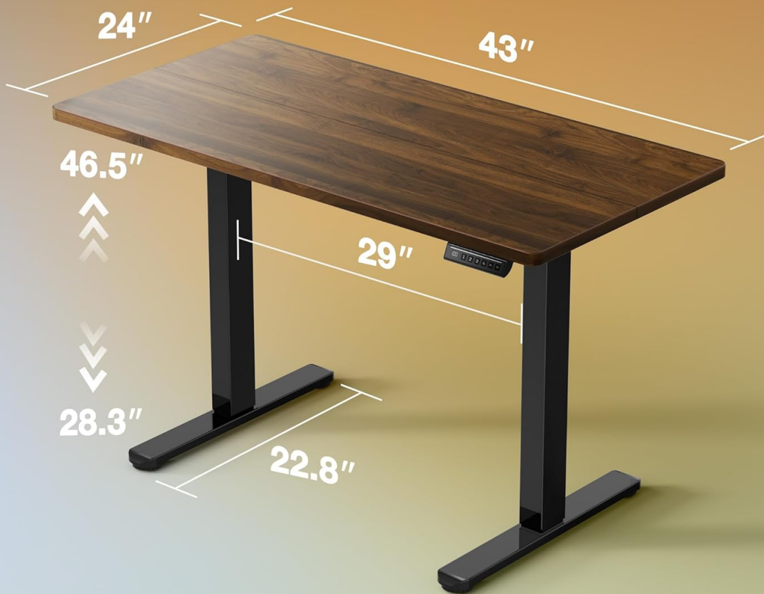
Image: Visual representation of the desk's dimensions, including its width, depth, and adjustable height range.