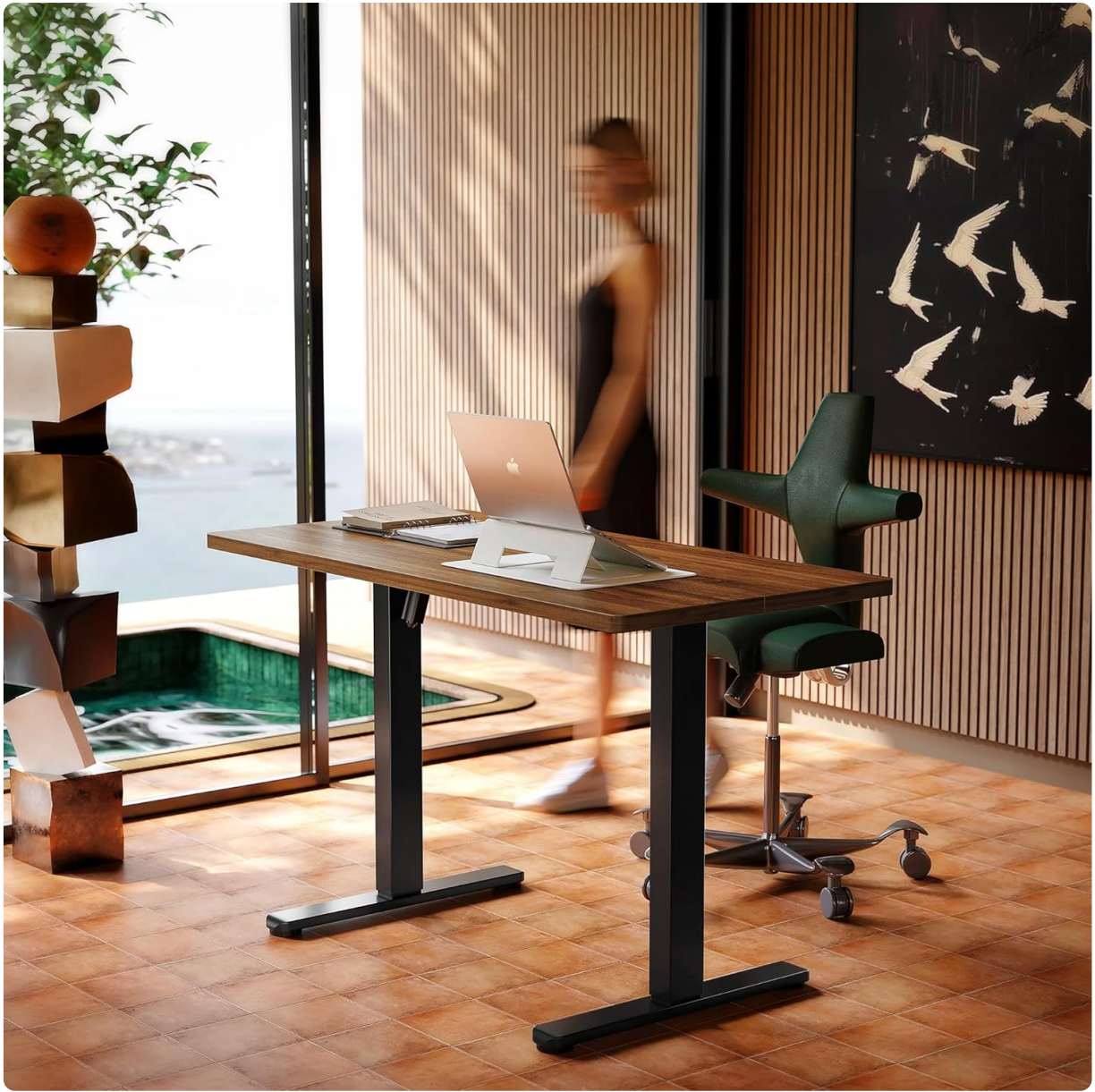
Image: The HUANUO Electric Standing Desk, showcasing its sleek design and integration into a modern workspace.