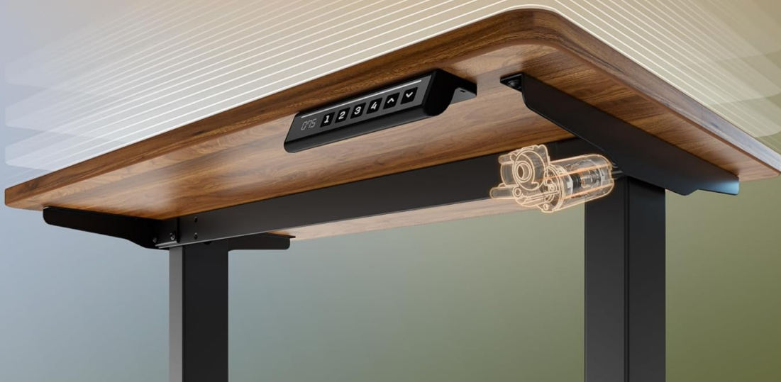
Image: Detail of the smart control panel, highlighting the LED display, four memory height settings, and smooth up/down controls.