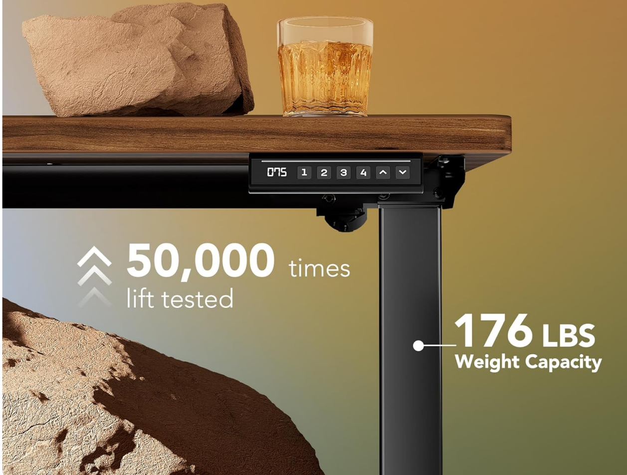
Image: Reliable Lifting. This image highlights the desk's durability, stating it is 50,000 times lift tested and has a weight capacity of 176 lbs (note: specifications list 154 lbs, using the more conservative value from specifications). It shows a sturdy desk with items on top, emphasizing stability.

Sturdy structure gives you peace of mind