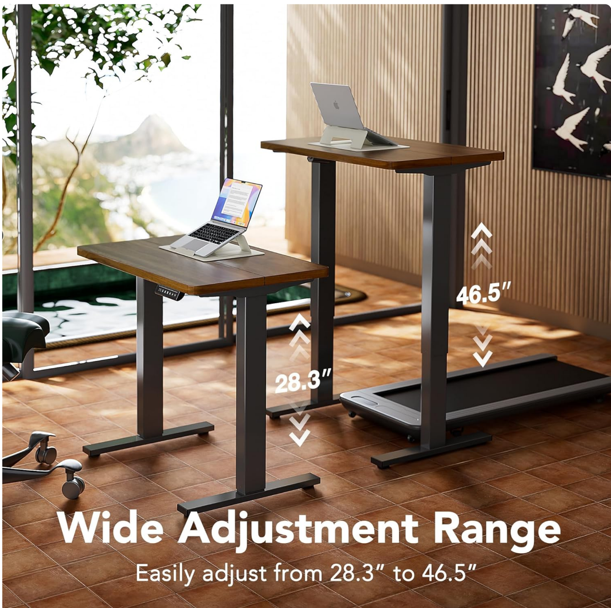
Image: Wide Adjustment Range. This image demonstrates the desk's ability to adjust from a sitting height of 28.3 inches to a standing height of 46.5 inches, accommodating various user preferences and postures.

The desk offers a wide height adjustment range from 28.3" to 46.5", allowing you to easily switch between sitting and standing positions. The electric lifting mechanism operates smoothly and quietly, ensuring minimal disruption.