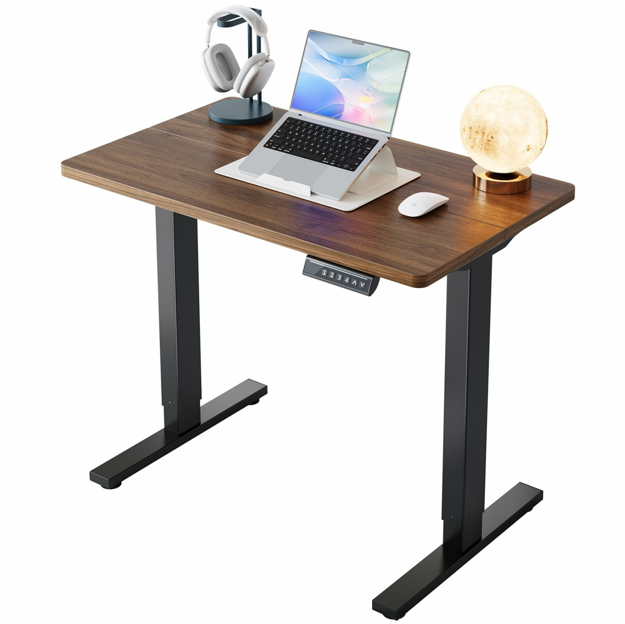
Image: Desk Dimensions. This image illustrates the compact dimensions of the HUANUO 32" Electric Standing Desk, showing a width of 32 inches, a depth of 19 inches, and an adjustable height range from 28.3 inches to 46.5 inches. The desk features a black walnut desktop and black alloy steel legs.