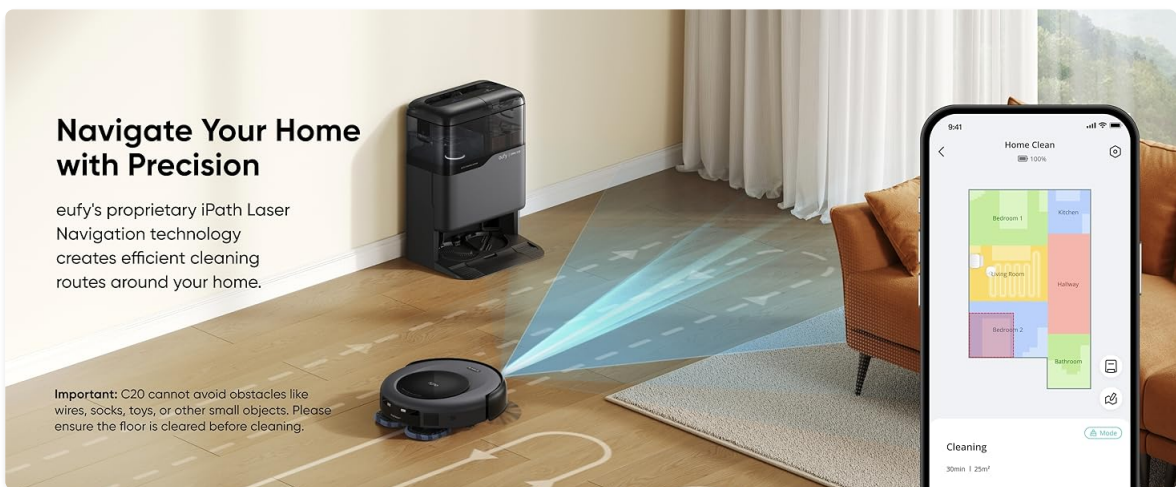
Figure 5: The eufy Clean app displaying multi-level mapping capabilities for efficient cleaning across different floors.