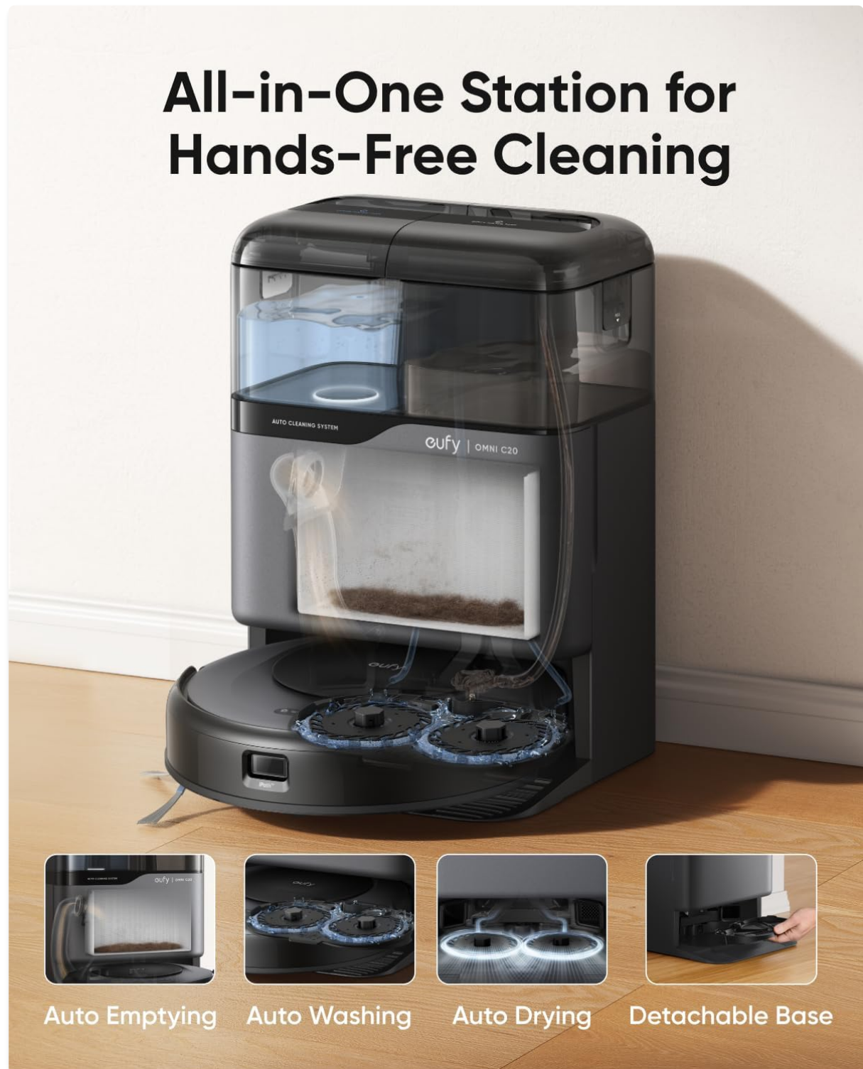
Figure 2: The eufy Omni C20 robot and its station, ready for setup.

Carefully remove all components from the packaging. Ensure all included components are present: the robot, Omni Station (with dust bag), roller brush, side brush, dust bin, 2 mop pads, and safety document.