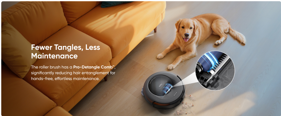
Figure 12: Close-up of the robot's roller brush with detangling comb.