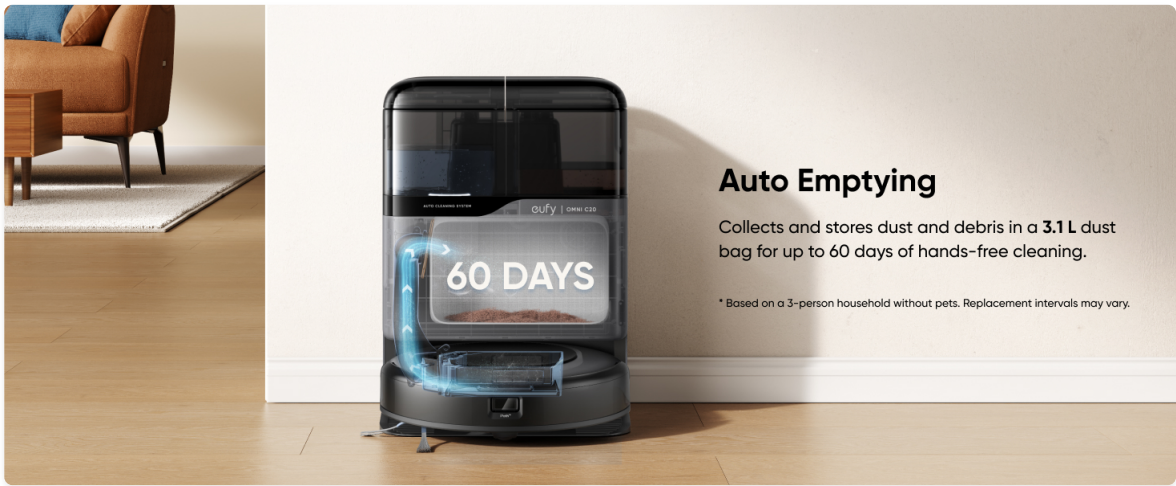
Figure 9: The Omni Station's auto-emptying function, collecting debris into a dust bag.