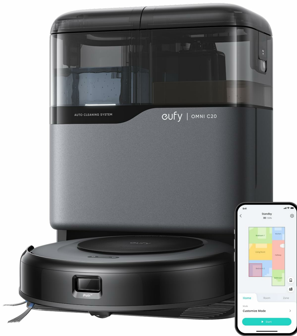
Figure 1: eufy Omni C20 Robot Vacuum and Mop Combo with its All-in-One Station.