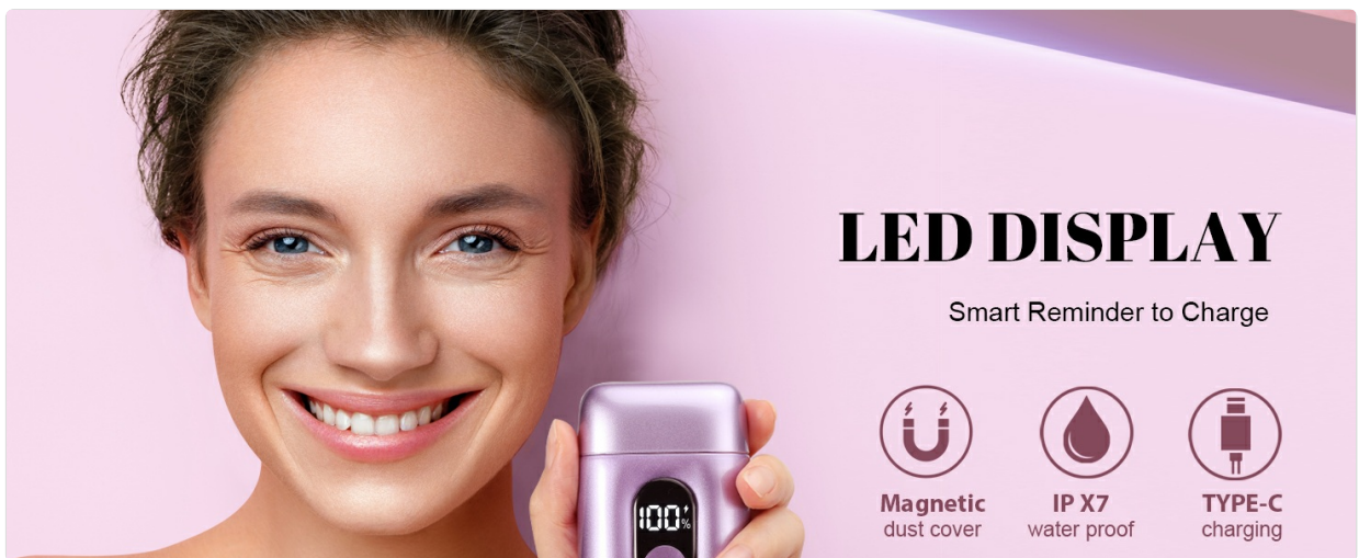
Image: Close-up of the Fangaci razor's LED display, indicating battery charge level.