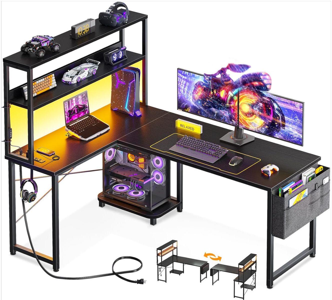
Overall view of the ODK L Shaped Desk, showcasing its design and features.