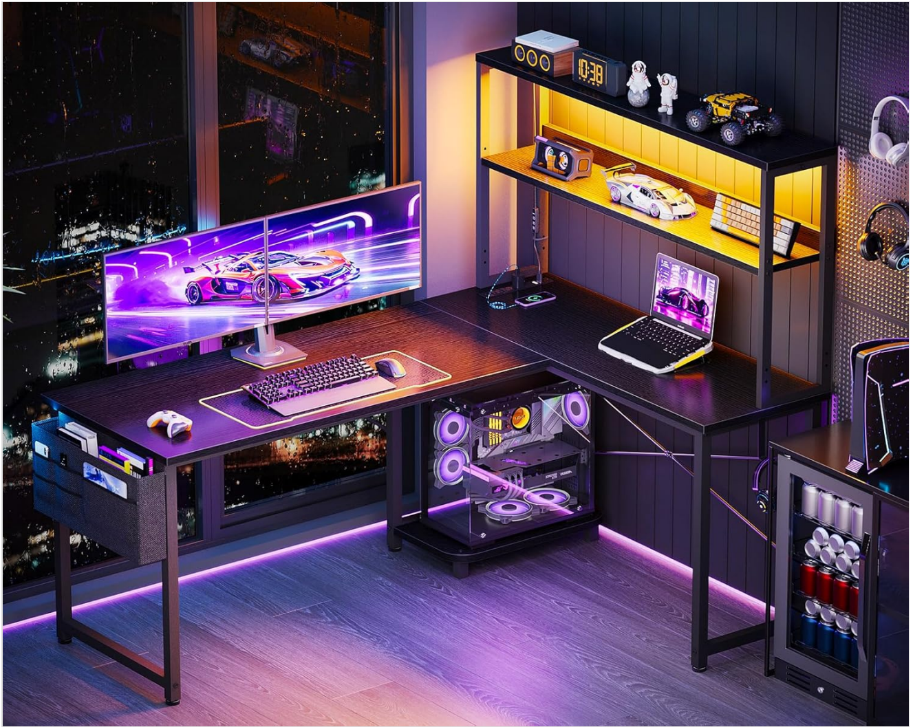
The desk with items on its storage shelves and a computer tower on the CPU stand.