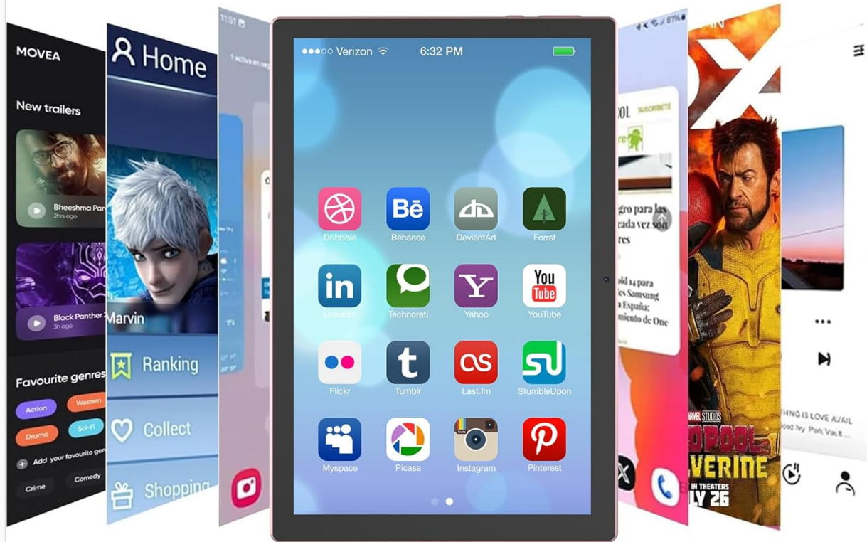
Image: The HDTABLET Android 15 Tablet CP20S, shown with its protective case. This image highlights the overall design and the included accessory.