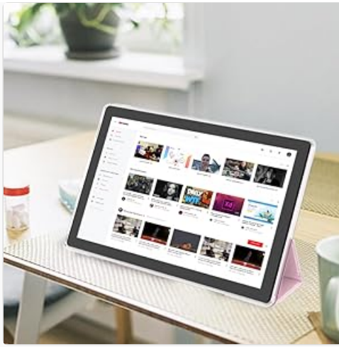
Image: A visual representation of the Android 15 operating system interface, highlighting its personal OS, privacy controls, and access to the Google Play Store.