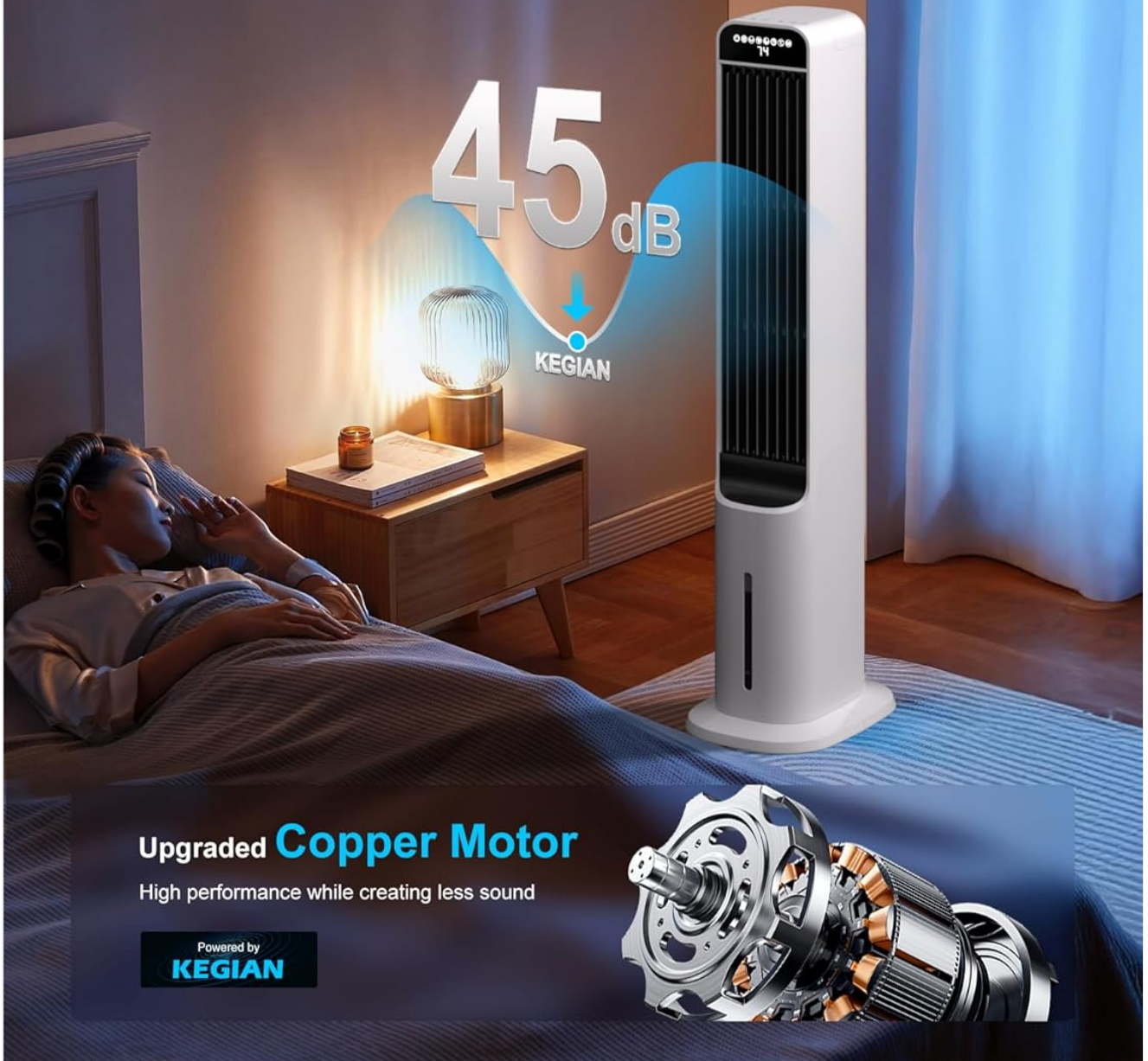
Image: The air cooler providing quiet, uninterrupted comfort in a bedroom, emphasizing its low noise level of 45dB and upgraded copper motor for efficient, silent operation.