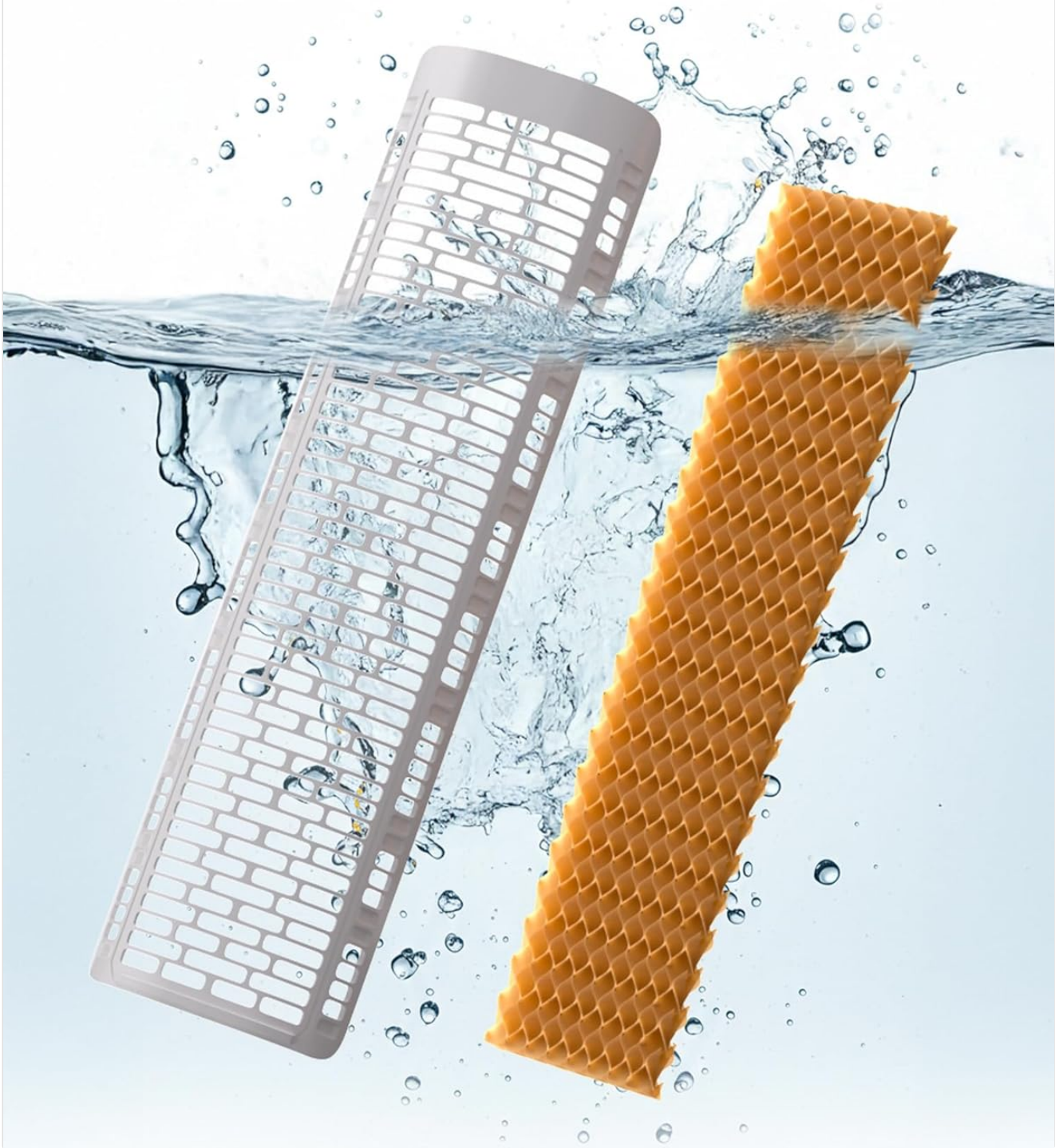
Image: The removable honeycomb cooling pad and grille being rinsed under water, demonstrating the ease of cleaning for maintenance.

Grille and Cooler Pad are Easy to Remove and Clean