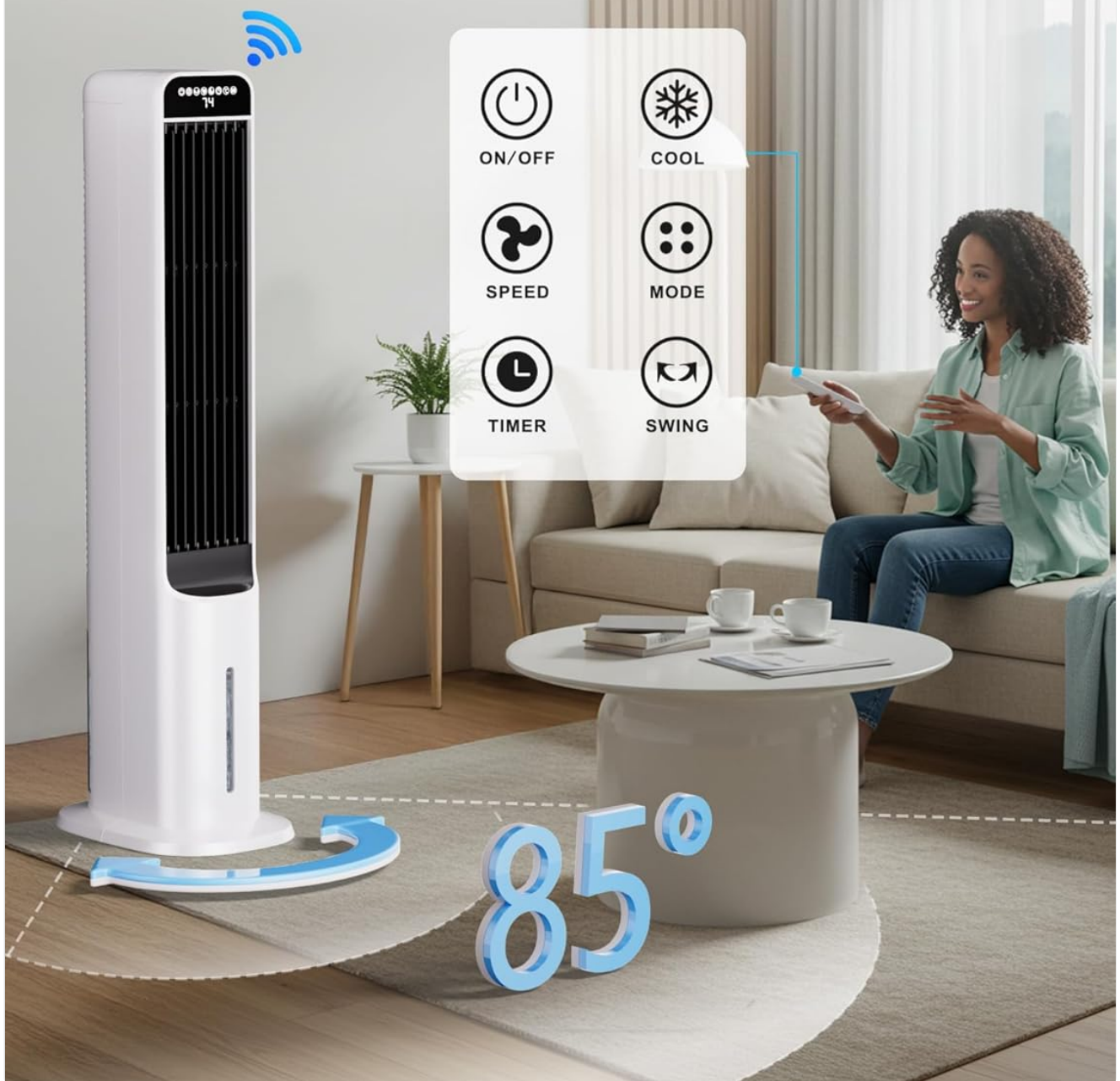
Image: A user operating the air cooler with the remote control, demonstrating the wide 85-degree oscillation and the convenience of a 26-foot remote range.