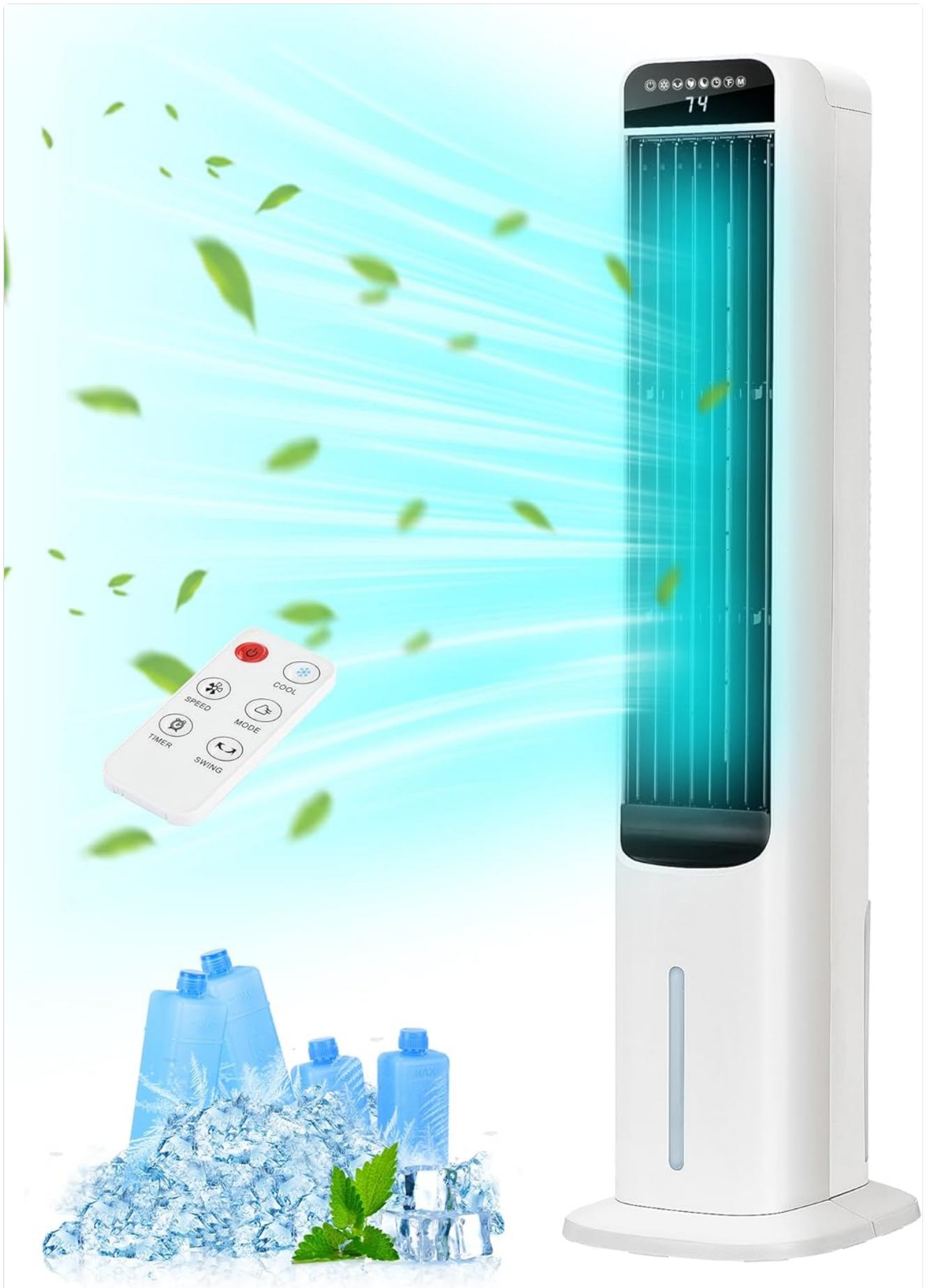
Image: The KEGIAN Evaporative Air Cooler, showcasing its sleek design, remote control, and included ice packs for enhanced cooling.