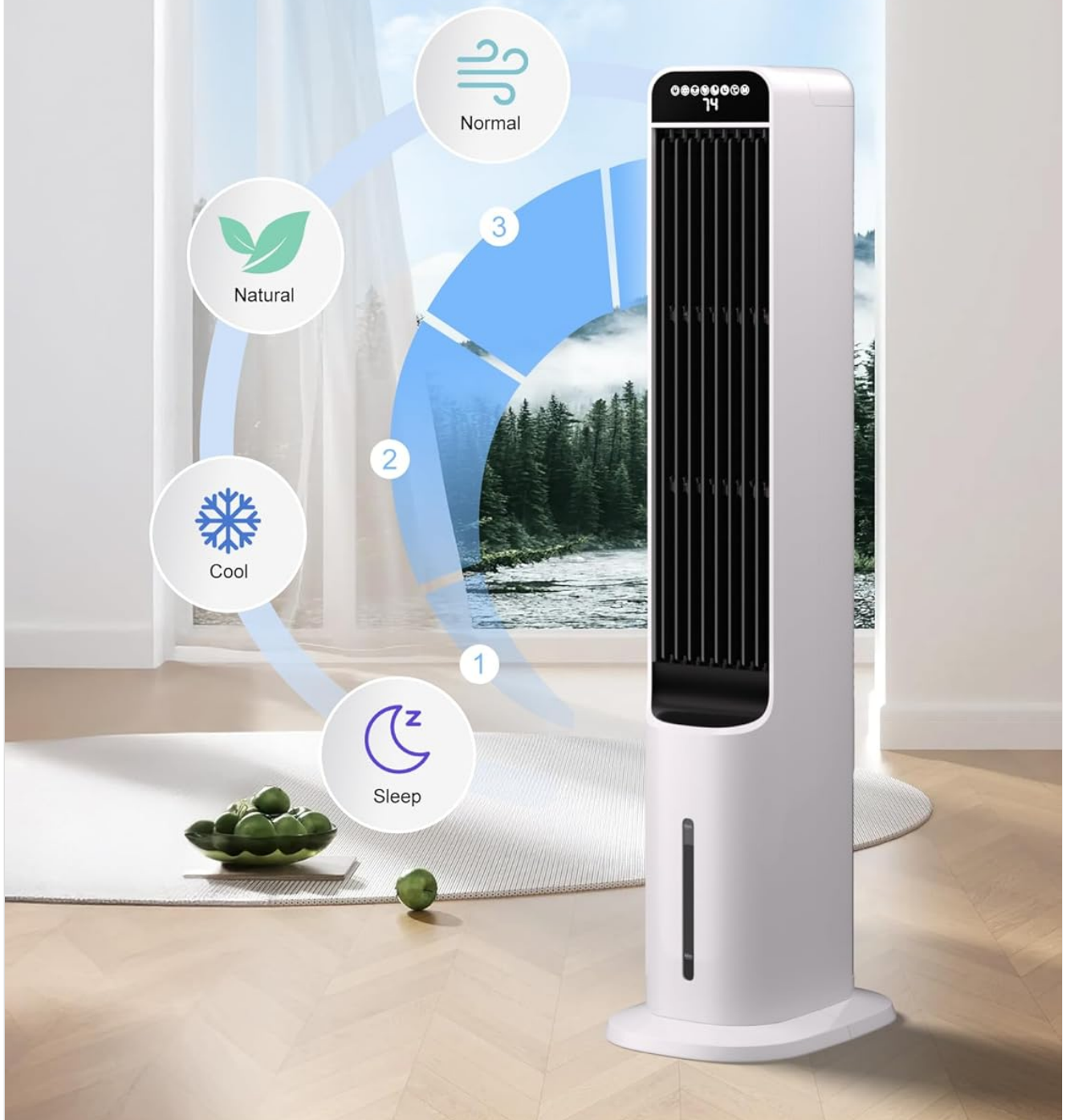
Image: A visual guide to the air cooler's four operational modes (Normal, Natural, Cool, Sleep) and three adjustable wind speeds, allowing for personalized comfort settings.