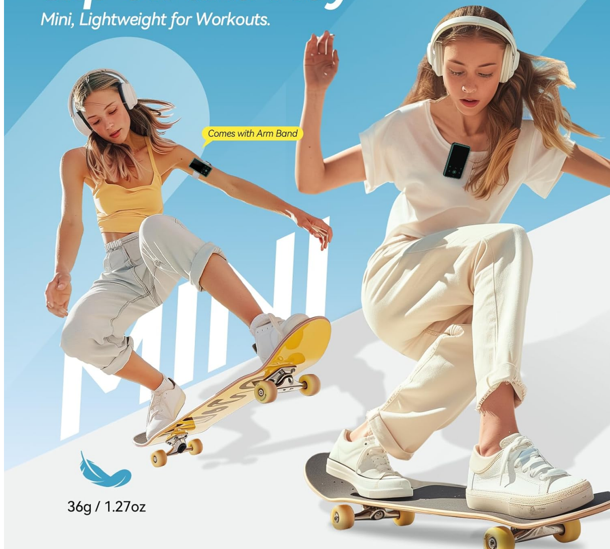
Image: AGPTEK M2 MP3 Player with clip and armband, shown in use during physical activity.