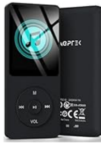
Image: AGPTEK customer service commitments.