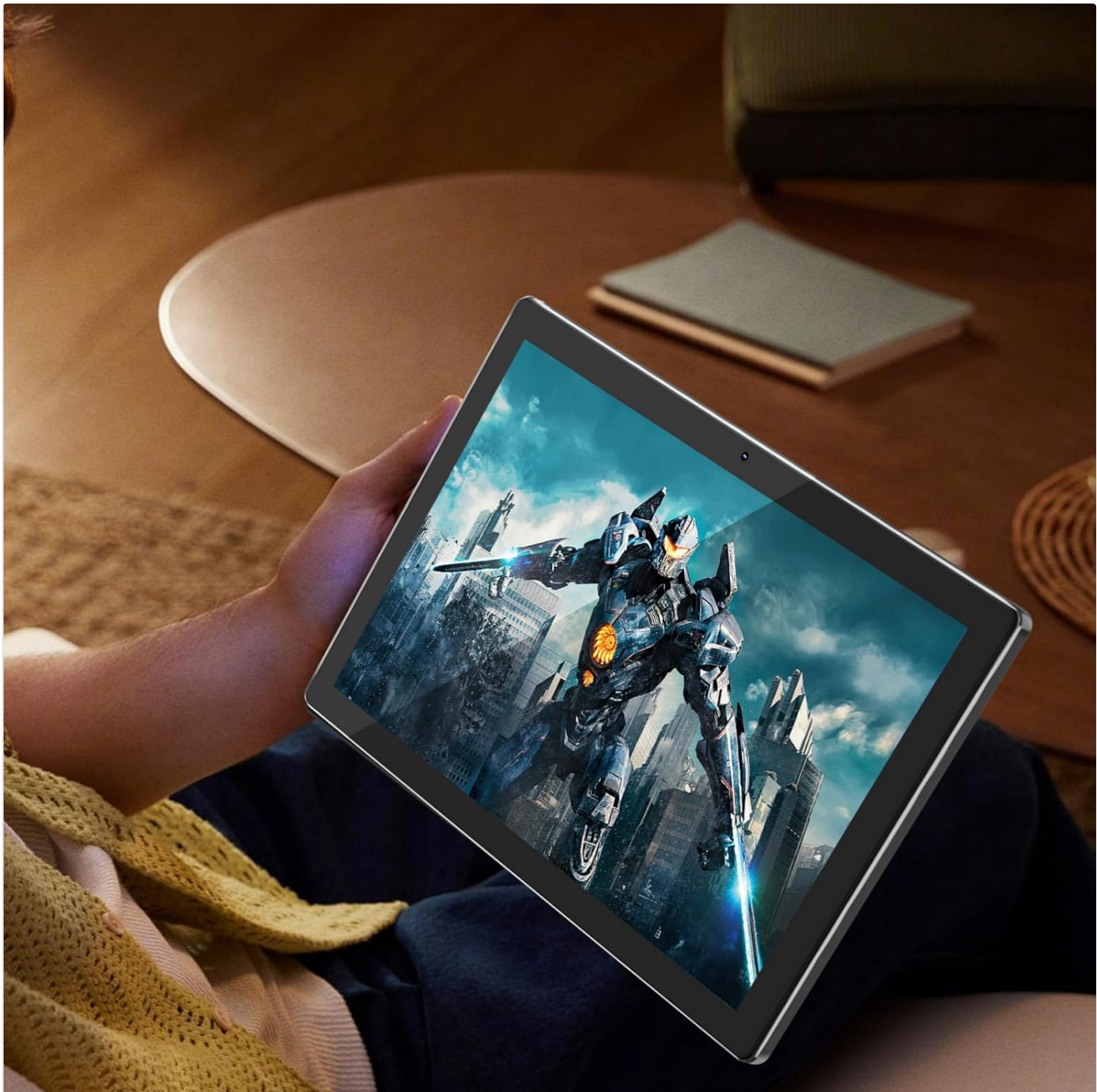
Image: The HDTABLET Android 15 Tablet CP20S set up with its wireless keyboard, mouse, and stylus, demonstrating its 2-in-1 functionality.

The HDTABLET CP20S comes with a wireless keyboard, mouse, and stylus for enhanced productivity and interaction.