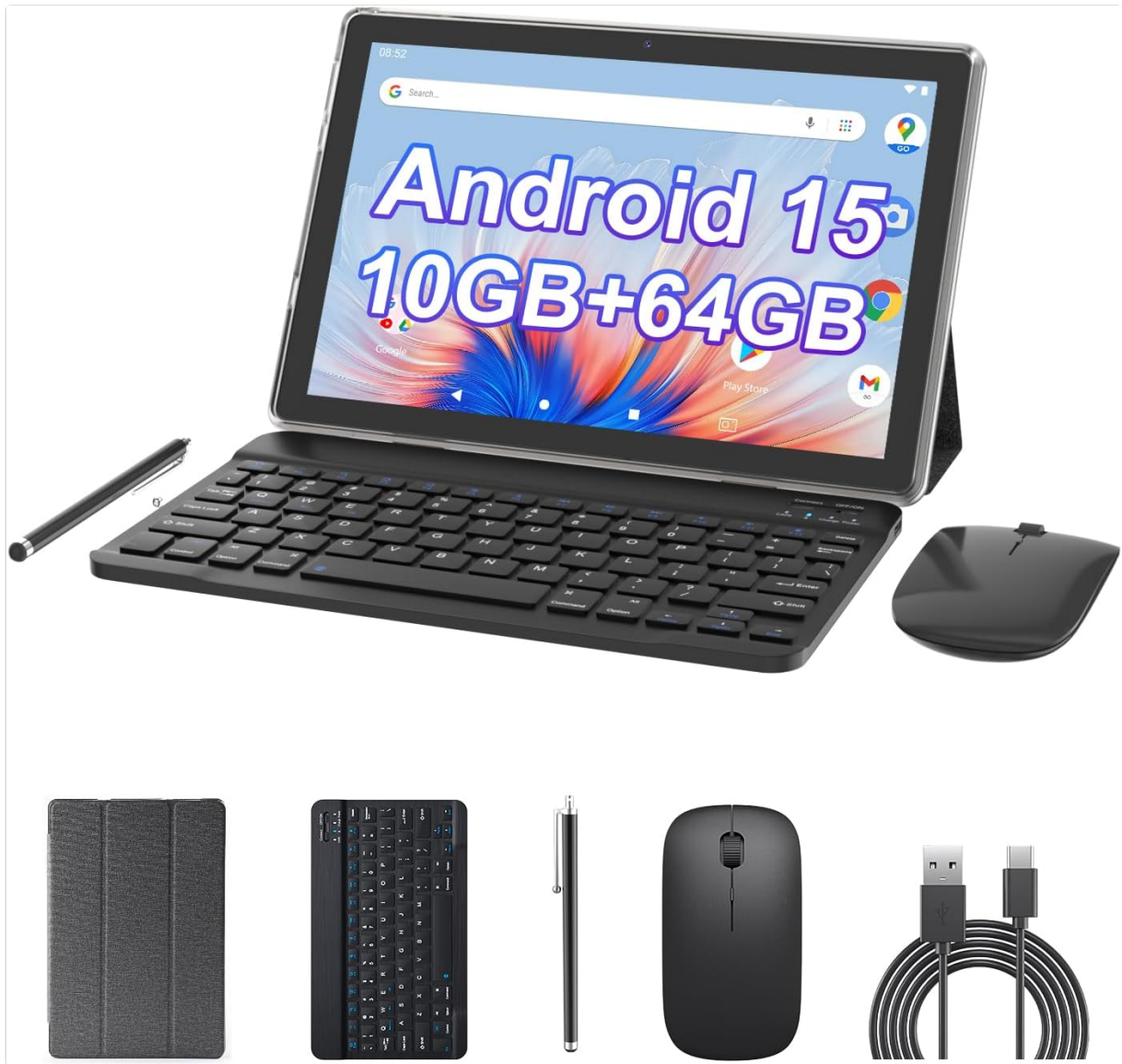
Image: The HDTABLET Android 15 Tablet CP20S displayed with its accompanying accessories, including a wireless keyboard, mouse, stylus, protective case, and USB-C charging cable.