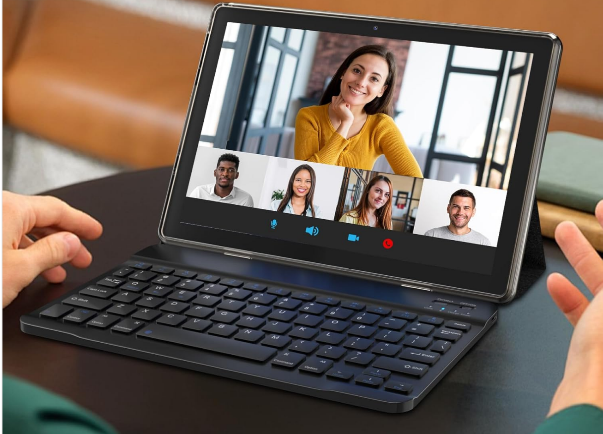
Image: The tablet screen showcasing a wide viewing angle with vivid colors, demonstrating its IPS display capabilities.