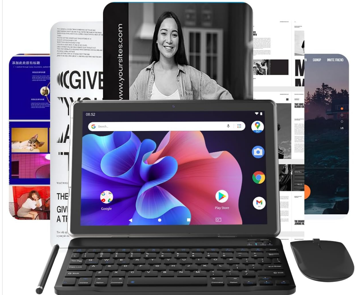
Image: Visual representation of the tablet's memory specifications: 10GB RAM, 64GB ROM, and 10-inch display size.