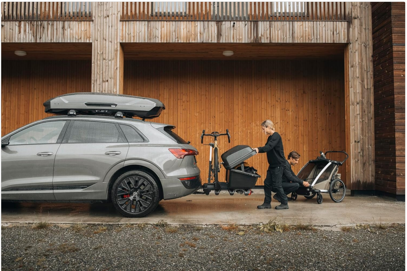
Figure 3: The integrated lock system ensures your cargo is secure during transport.