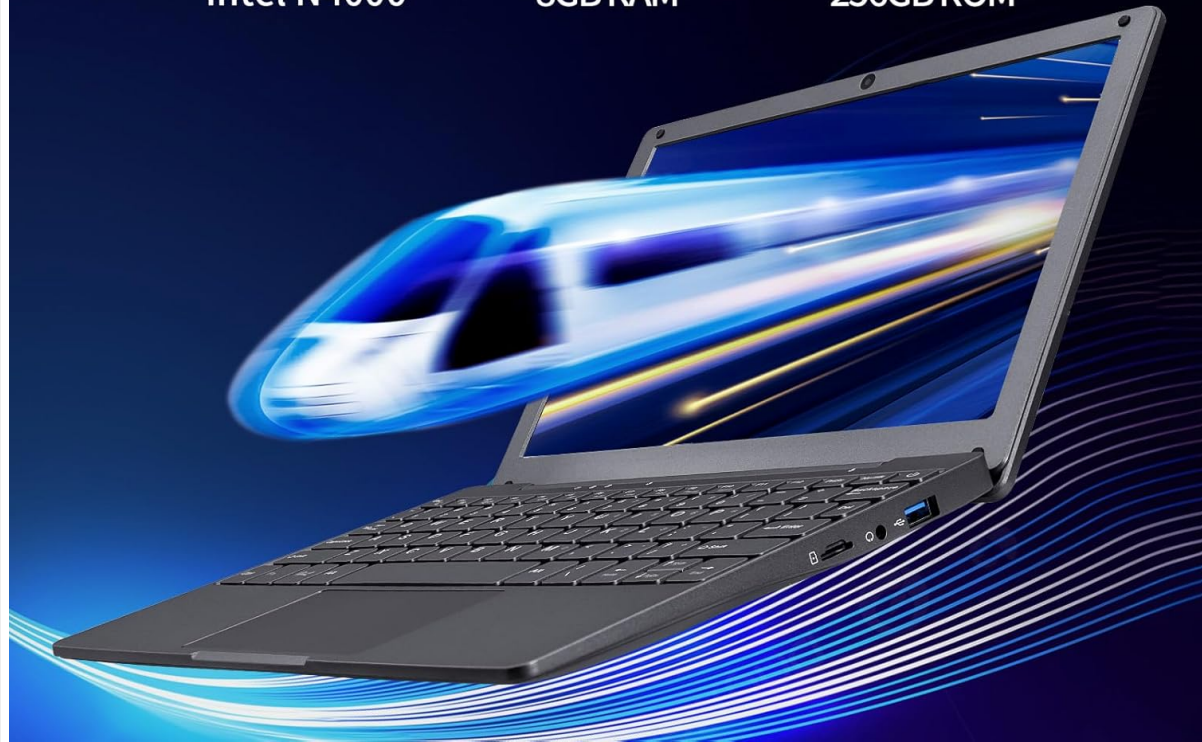
Image Description: A close-up of the laptop's keyboard area highlighting the Intel Celeron N4000 processor. Text on the image indicates 2 Cores, 2 Threads, 6W TDP, 14nm Process, and 2.6 GHz Turbo Frequency, emphasizing its ultra-fast performance.

Powerful Processor: Equipped with an Intel Celeron N4000 processor (up to 2.8GHz) and Intel HD Graphics 600, this laptop delivers efficient performance for everyday applications and multitasking.