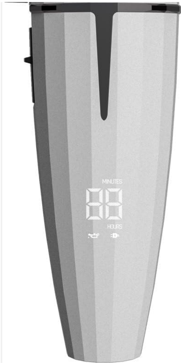
Image 1.1: The JRL GHOST Professional Cordless Hair Clipper, Model 2020C-B.