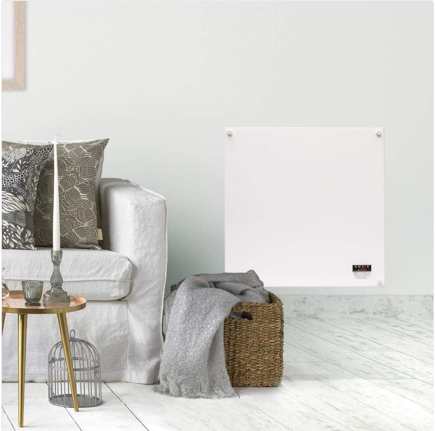
Figure 5.1: Example of the Amaze Solo Heater Panel installed on a wall.