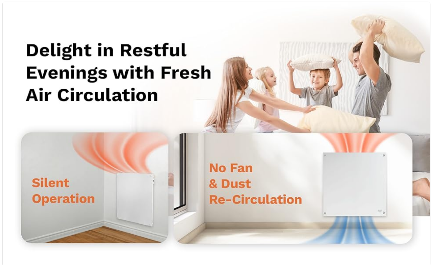
Figure 6.2: Benefits of silent operation and no dust recirculation.

The 400W power consumption of the Amaze Solo Panel Heater is designed for energy efficiency, providing effective heating for its rated coverage area while minimizing electricity usage compared to higher wattage heaters. The silent operation and lack of dust circulation contribute to a healthier and more comfortable indoor environment.