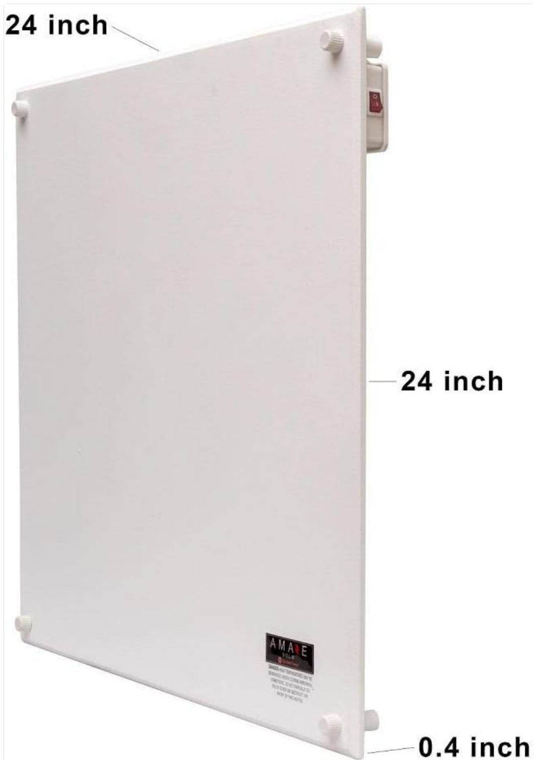
Figure 4.1: Dimensions of the Amaze Solo Heater Panel.