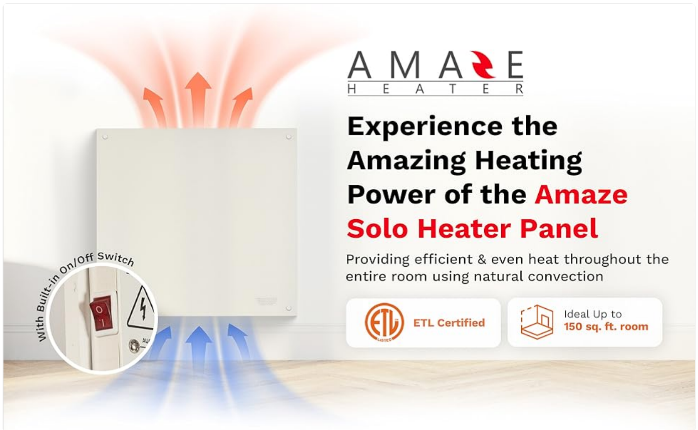
Figure 1.2: Amaze Solo Heater Panel highlighting ETL certification and coverage area.