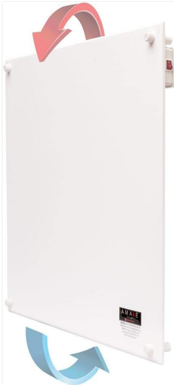
Figure 6.1: Illustration of natural convection heating.

The Amaze Solo Panel Heater operates on the principle of natural convection. Cool air near the floor is drawn into the bottom of the panel, heated by the internal element, and then rises as warm air from the top. This creates a gentle, continuous circulation of warm air throughout the room, providing even and comfortable heating without the need for a noisy fan.