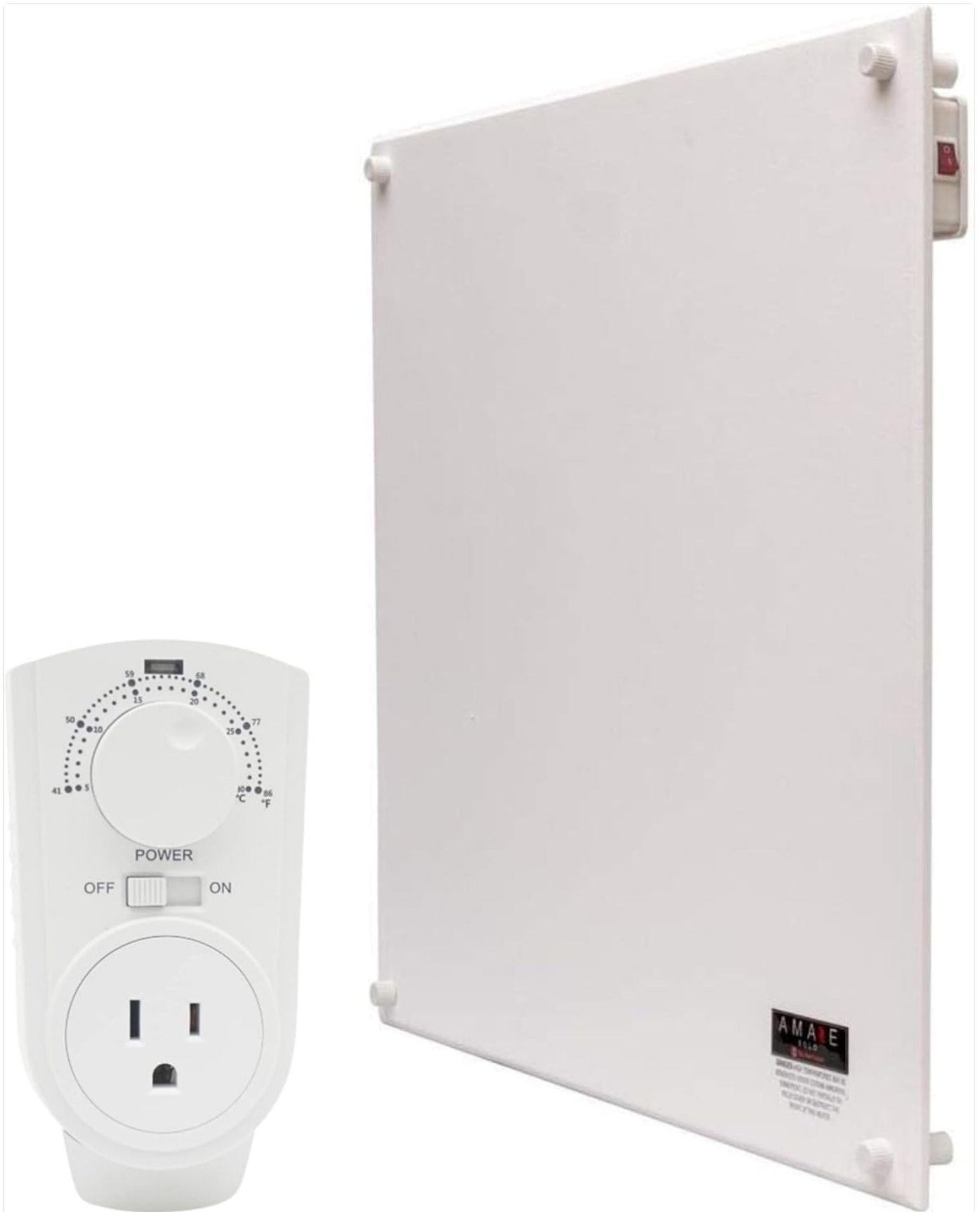
Figure 1.1: Amaze Heaters Solo 400W Convection Panel Heater and Plug-in Thermostat Bundle.

The panel heater utilizes natural convection to distribute heat evenly throughout the room without a fan, ensuring silent operation and preventing dust circulation. It is constructed from non-conducting materials with triple-layer insulation for enhanced safety and durability.