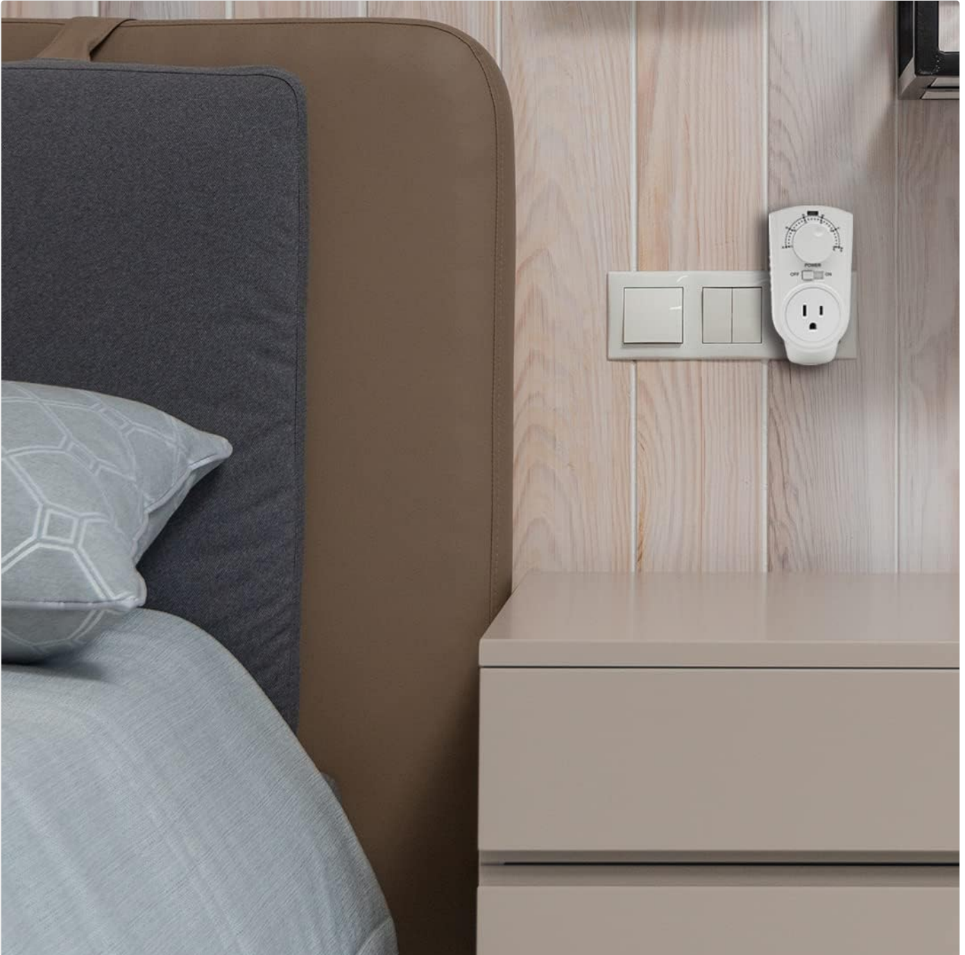
Figure 5.2: Step-by-step guide for setting up the plug-in thermostat.