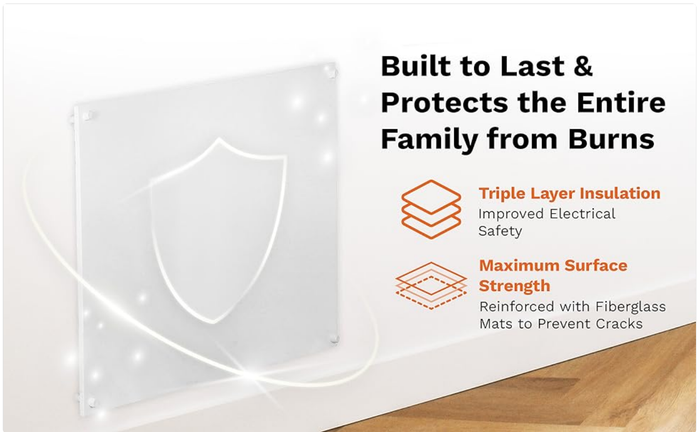
Figure 2.1: Safety features of the Amaze Solo Heater Panel, including triple layer insulation.