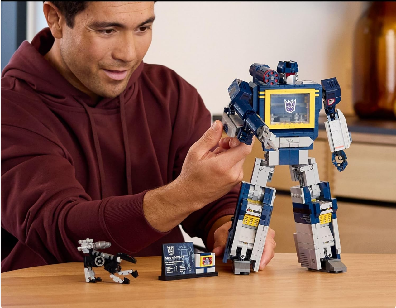
Figure 3: An adult assembling the LEGO Soundwave model.