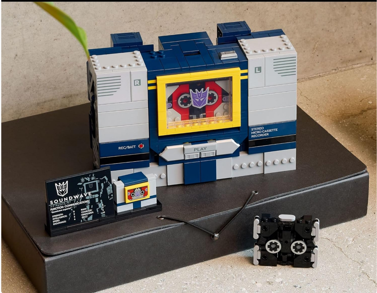
Figure 7: Soundwave displayed in cassette player mode with its power statistics plaque.

Your browser does not support the video tag.