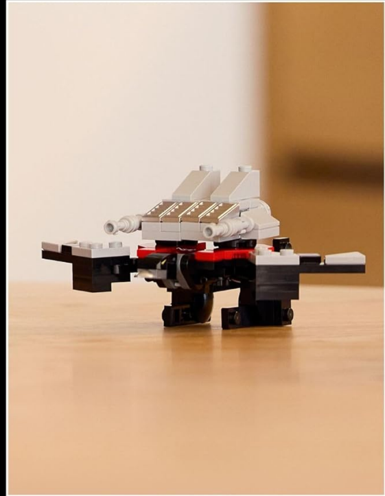
Figure 5: Ravage and Laserbeak figures, which transform into cassette tapes.