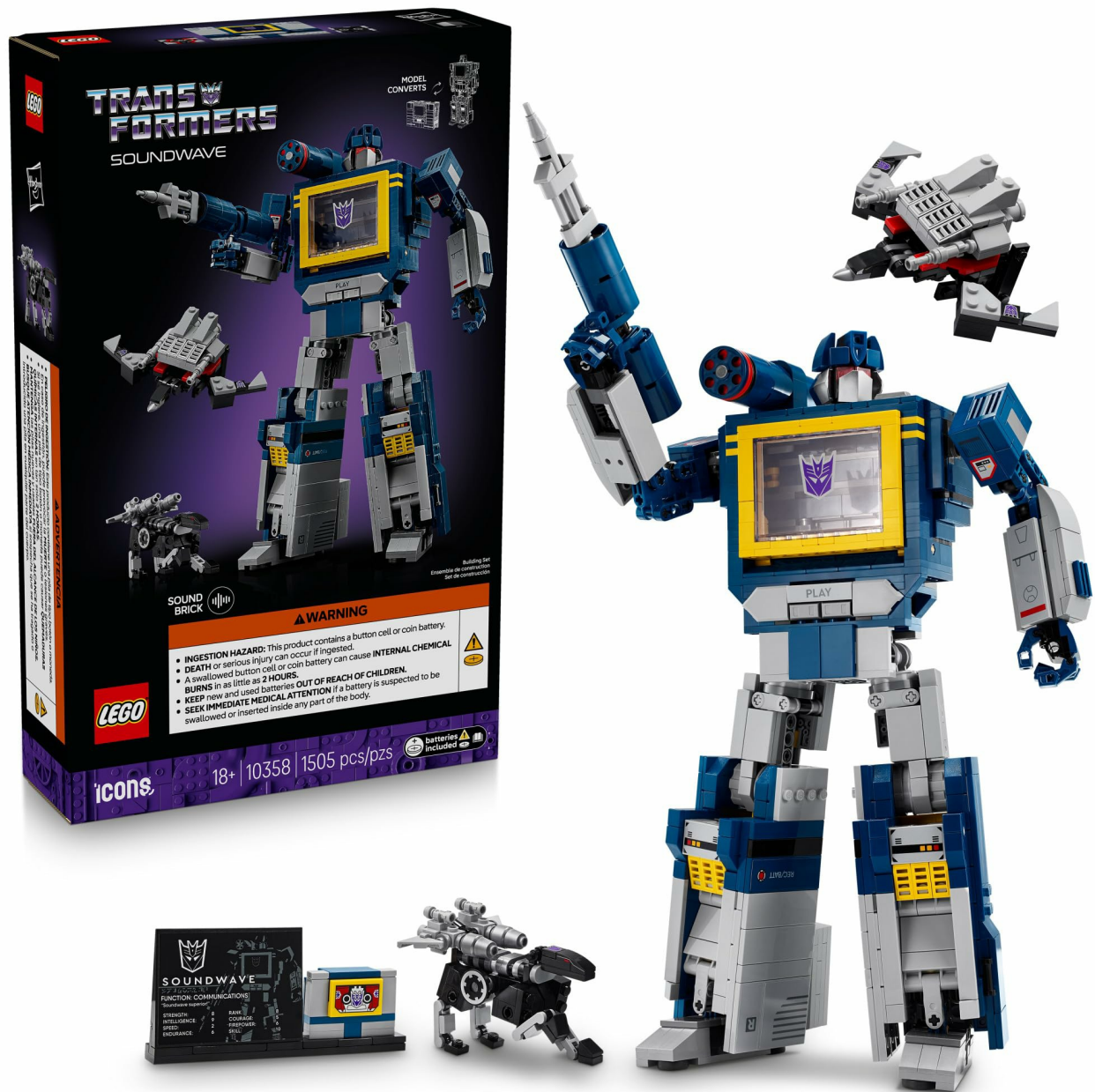
Figure 1: The fully assembled LEGO Icons Transformers Soundwave in robot mode.