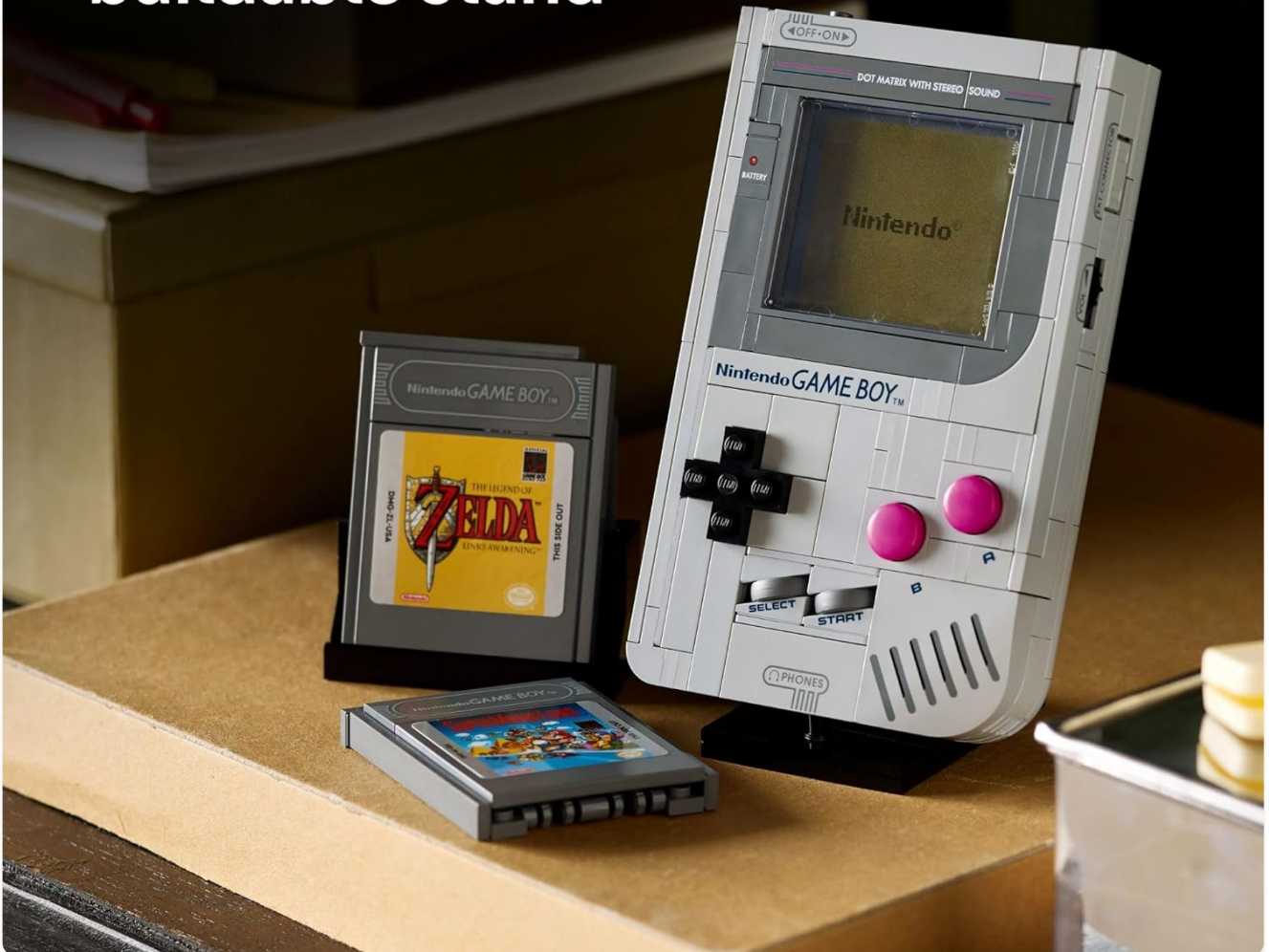
Image: The completed LEGO Game Boy model elegantly displayed on its buildable stand, accompanied by the interchangeable Game Paks.