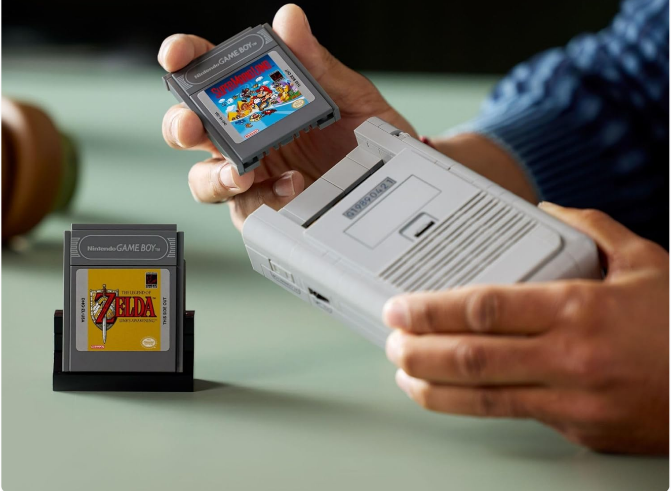
Image: A hand demonstrating the insertion of a brick-built Game Pak into the dedicated slot on the LEGO Game Boy model.