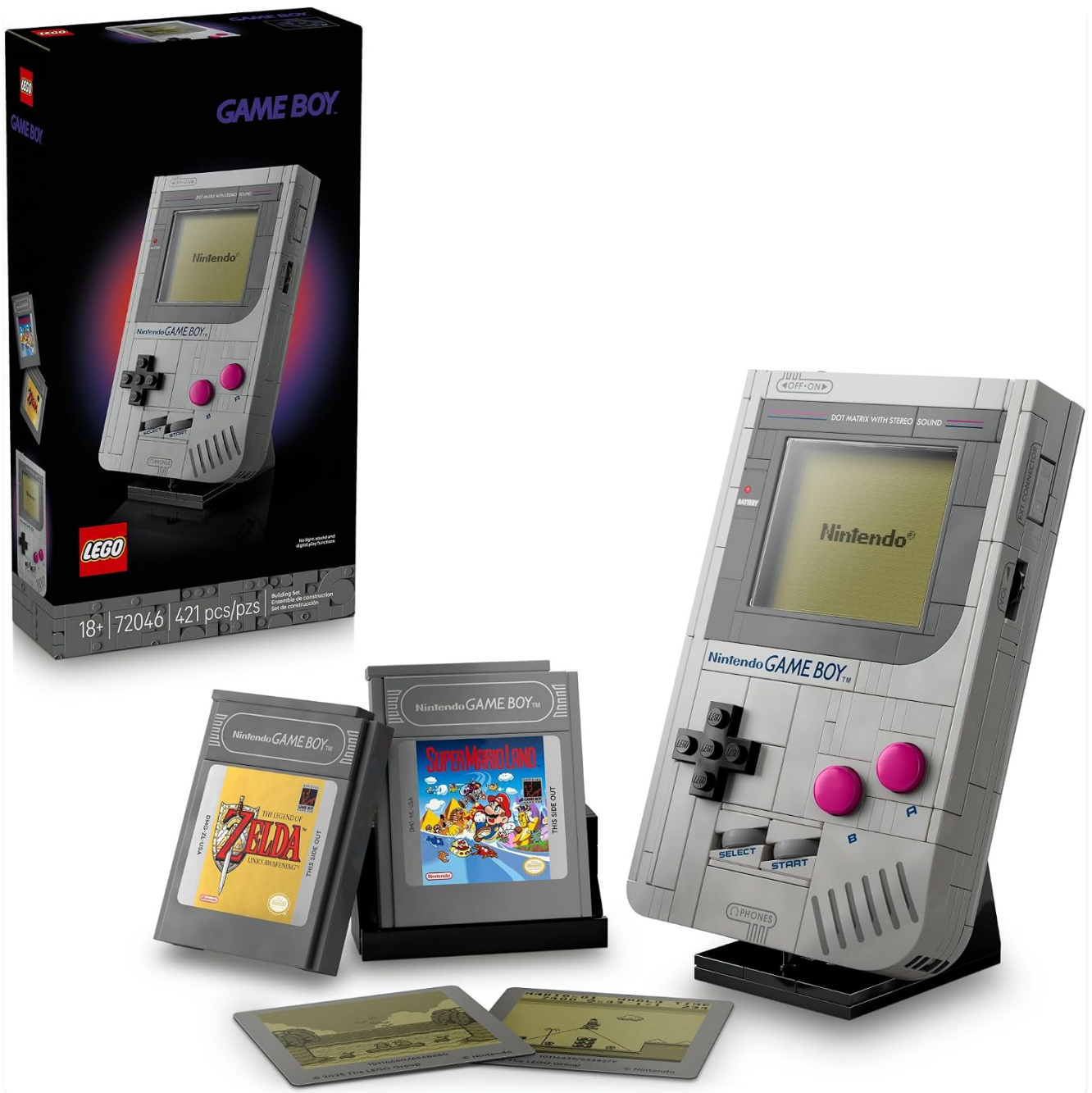
Image: The complete LEGO Super Mario Game Boy set, including the box, the assembled model, and the interchangeable Game Paks.