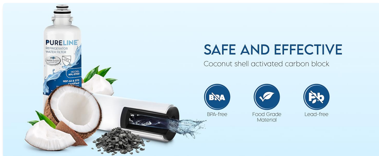
Image: Pureline water filter highlighting key features like easy installation and effective filtration.

This filter is independently certified by IAPMO for NSF-42 for comprehensive reduction of chlorine and impurities, as well as NSF-372 for material safety, ensuring quality and safety.