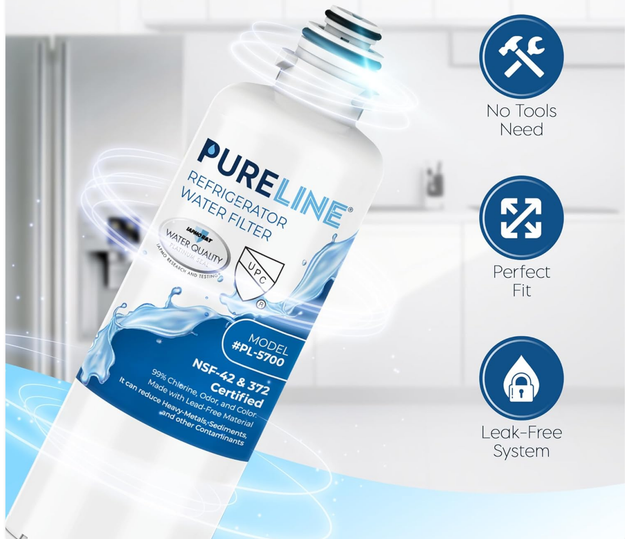
Image: Visual guide illustrating the ease of installation with no tools required.

Your browser does not support the video tag.