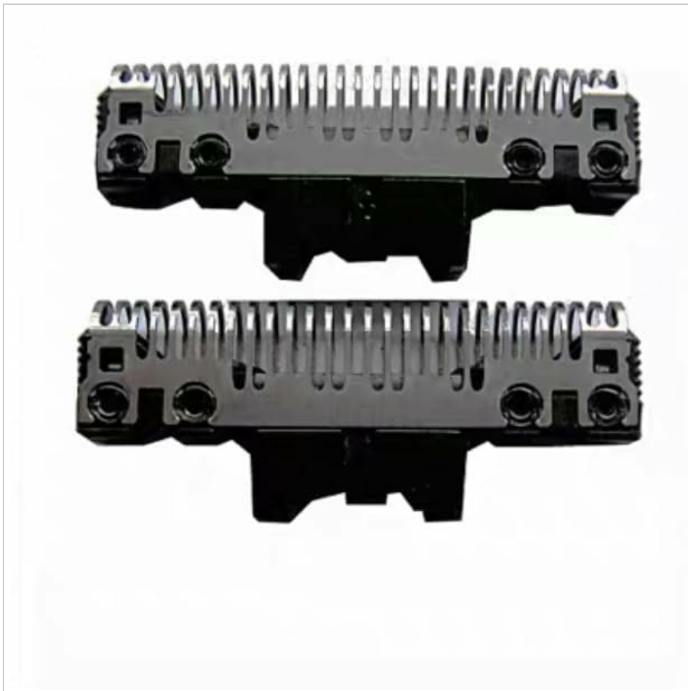
Figure 3: Replacement Inner Blades. A close-up of the sharp inner blades, designed for efficient hair cutting.