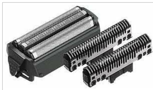
Figure 1: Oulice Replacement Outer Foil and Inner Blade Set. This image displays the complete replacement set, including the outer foil and two inner blades.

The replacement set includes one outer foil and one inner blade, engineered to work together for a close and comfortable shave.