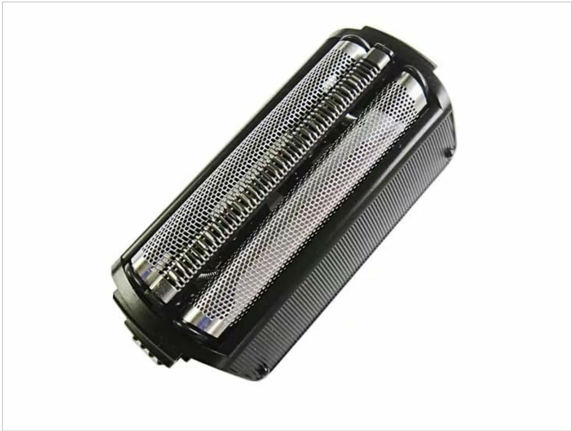
Figure 2: Replacement Outer Foil. A detailed view of the outer foil component, featuring its hypoallergenic design for skin comfort.