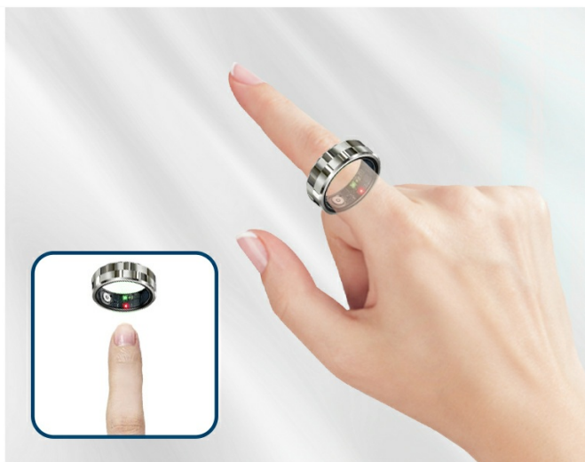
Image 4.1: Sleep tracking feature, showing how the ring monitors and analyzes sleep quality.

To ensure accurate readings, position the sensors on the inside of the ring against the pad of your index or middle finger when wearing it.