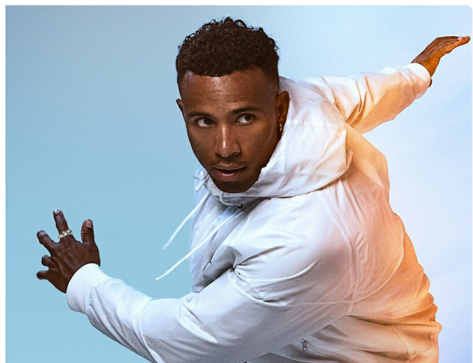
Image 3.2: Proper wearing technique for the smart ring to optimize sensor contact and data accuracy.

Use the smart ring to get a complete view of your real-time health status and embrace a healthier lifestyle!