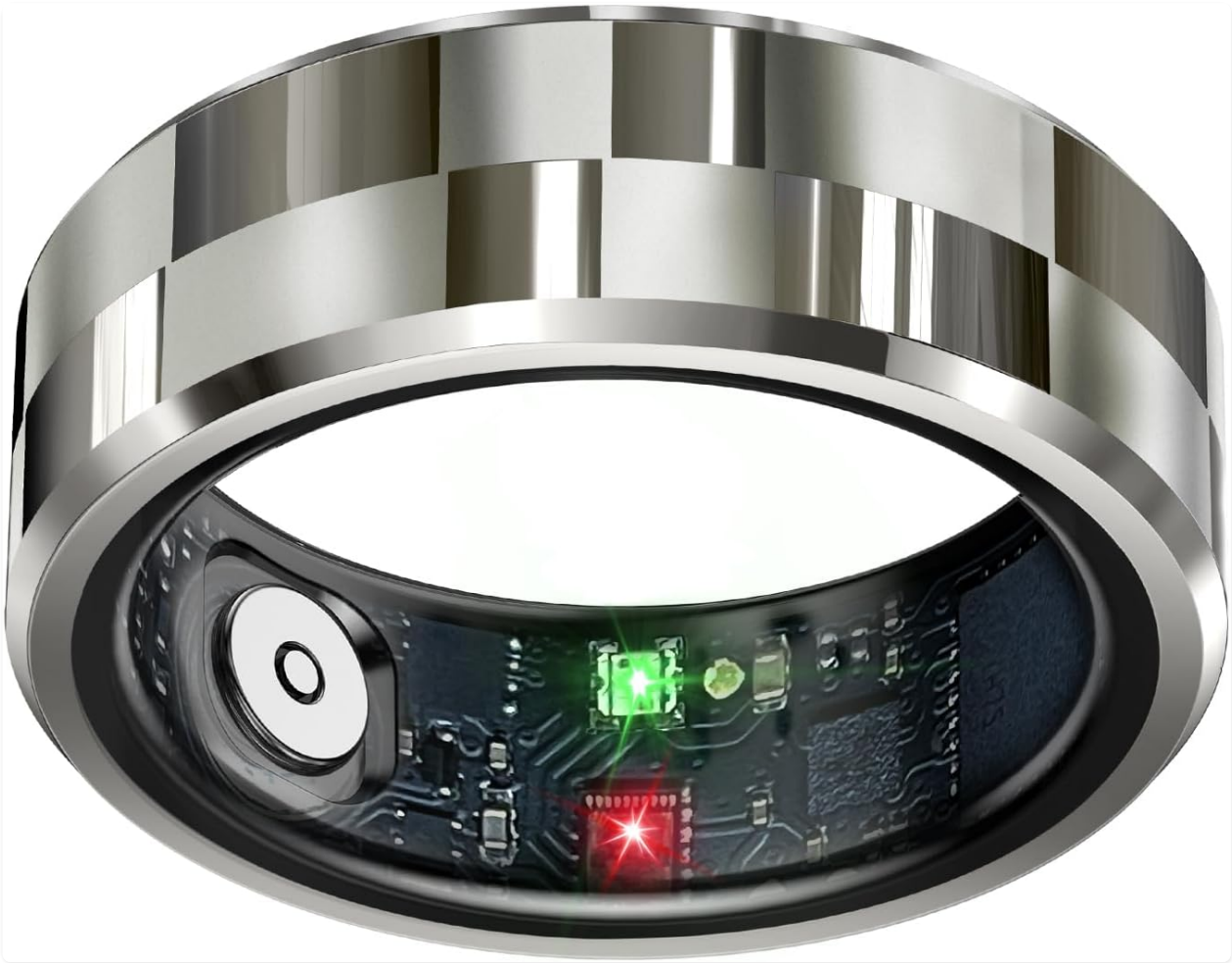
Image 1.1: The celestaura Smart Ring, highlighting its sleek design and internal sensors for health monitoring.