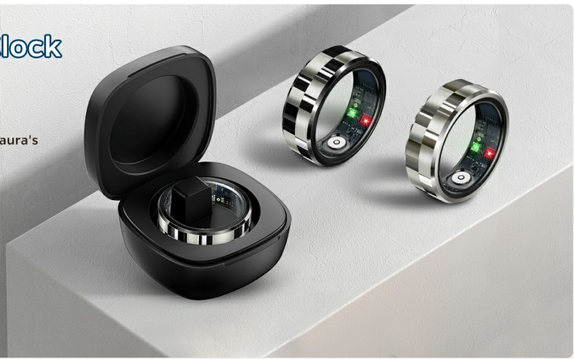
Image 2.1: Visual representation of the ring's health tracking capabilities, including sleep, activity, heart rate, and blood oxygen.