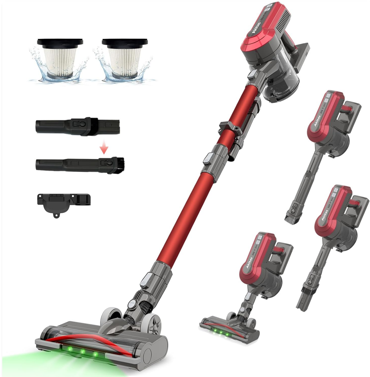
Figure 2.1: Akitas V10A Cordless Vacuum Cleaner with all included accessories, including the main unit, motorized brush, extension tubes, crevice tool, wall mount, charger, and two HEPA filters.