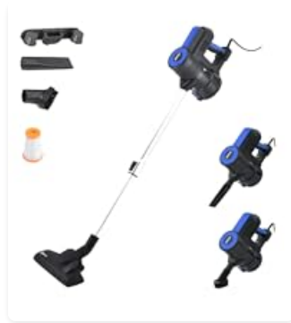
Figure 3.2: Overview of the Akitas V10A components, including the wall mount and charger, demonstrating how the vacuum can be stored and charged.