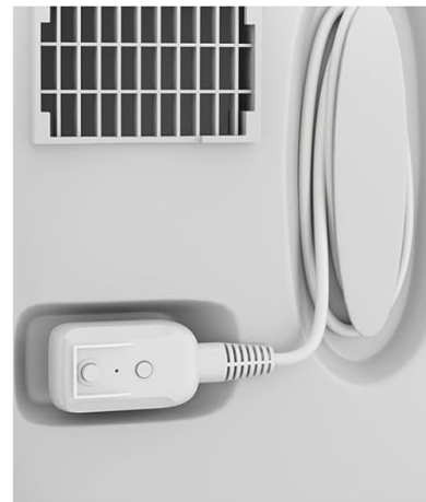
Easy Power Cord Storage

The detachable and washable filter is easy to access and clean, promoting better air quality.