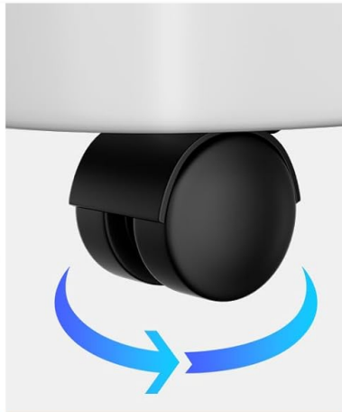
360° Rotatable Wheels