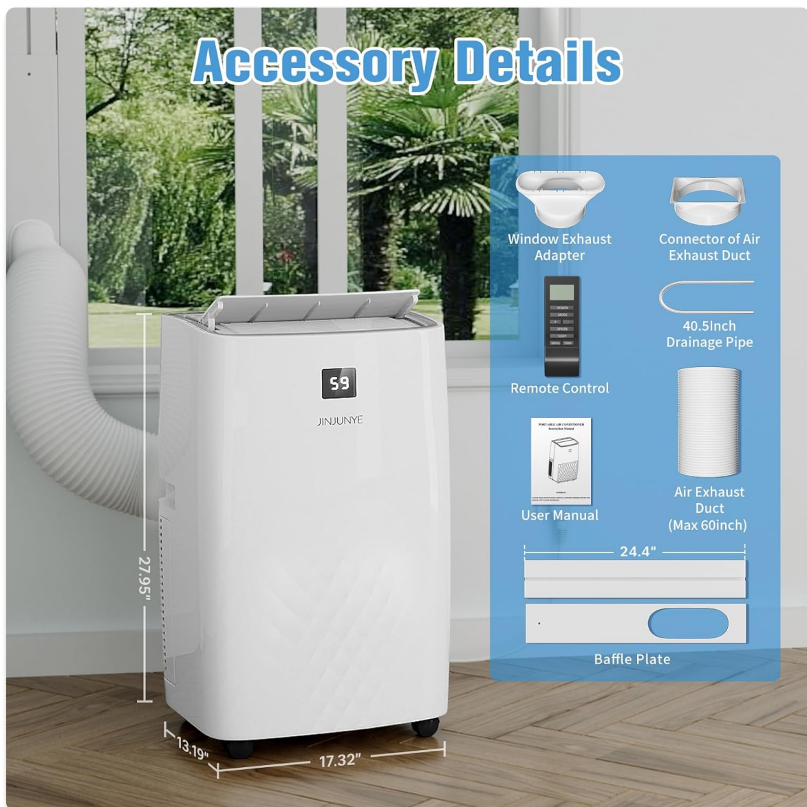
Detailed view of all components included with your JINJUNYE Portable Air Conditioner.