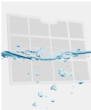
Detachable Washable Filter