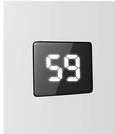
Display Real-time Temp