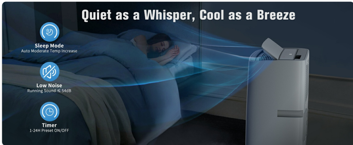
Key technical specifications of the JINJUNYE Portable Air Conditioner.