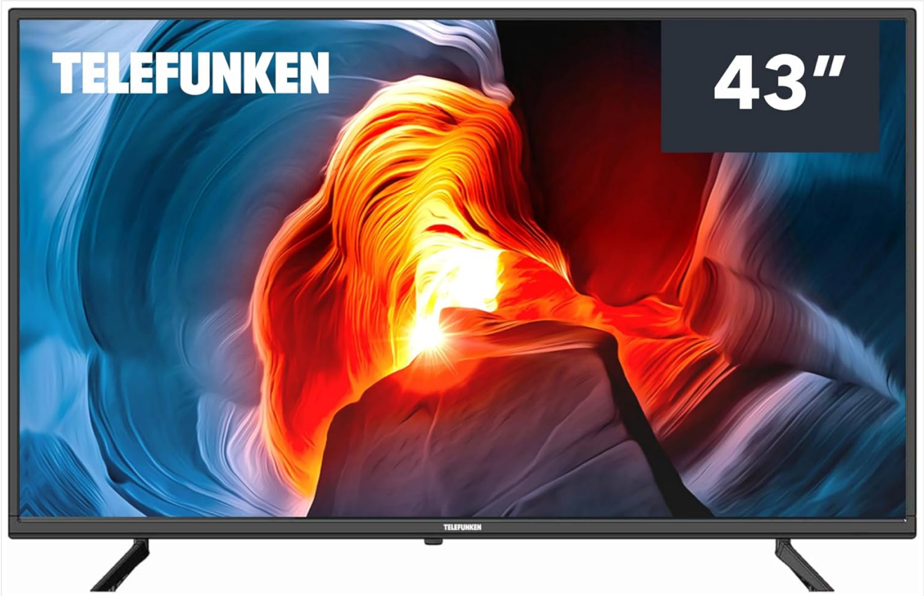
Figure 2: Front view of the television, showing the location for stand attachment.