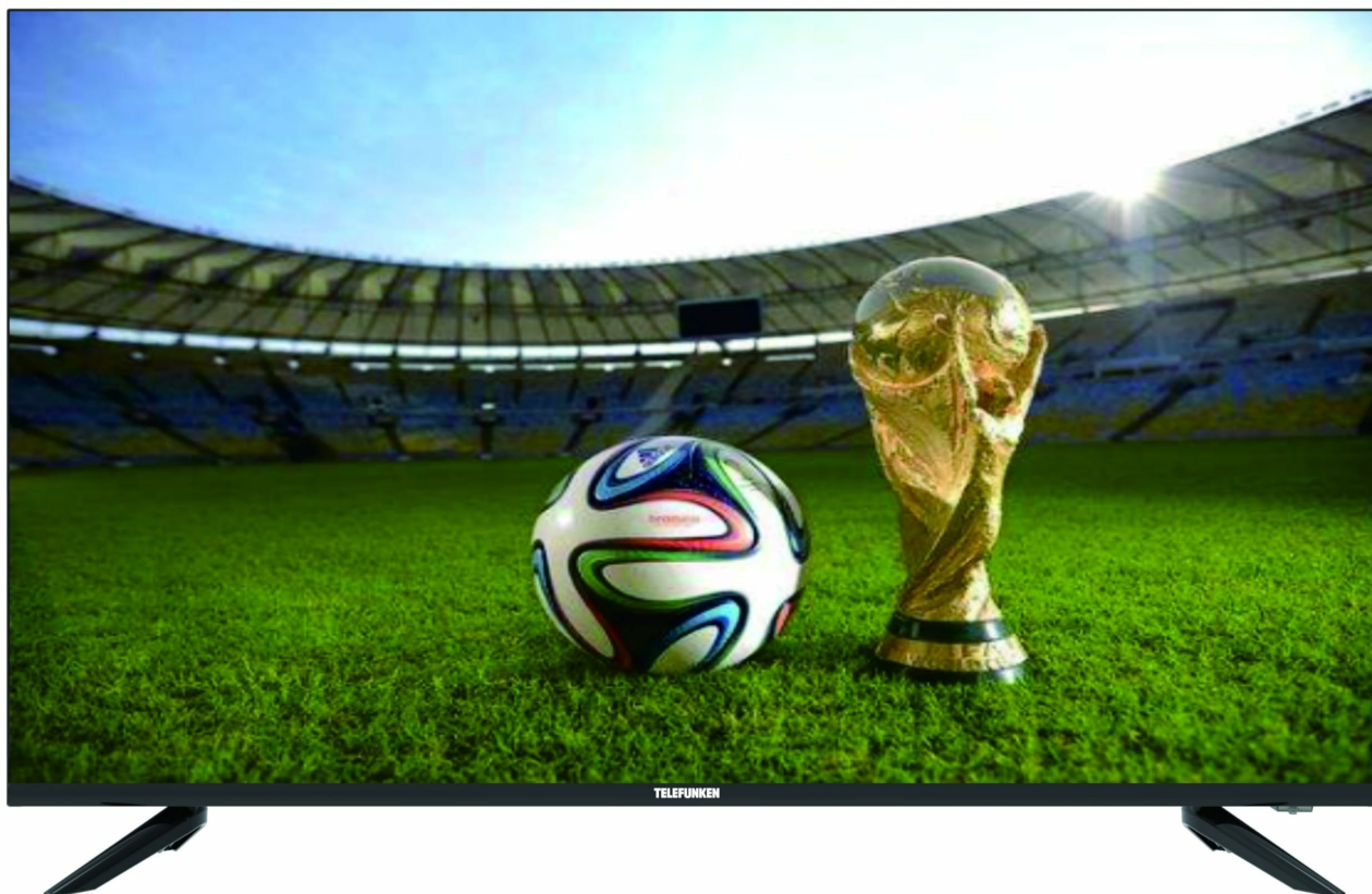
Figure 1: Front view of the Telefunken 43-Inch Full HD DLED Television.

This manual provides essential information for the safe and efficient operation of your Telefunken Full HD 43-Inch DLED Television (Model TLEDD-43FHDC). Please read it thoroughly before using the product and retain it for future reference. Your Telefunken 43-Inch Full HD DLED Television delivers vibrant colors and sharp images, making it suitable for various entertainment needs. It features multiple connectivity options, including HDMI and USB ports, and an energy-efficient design for an immersive viewing experience.