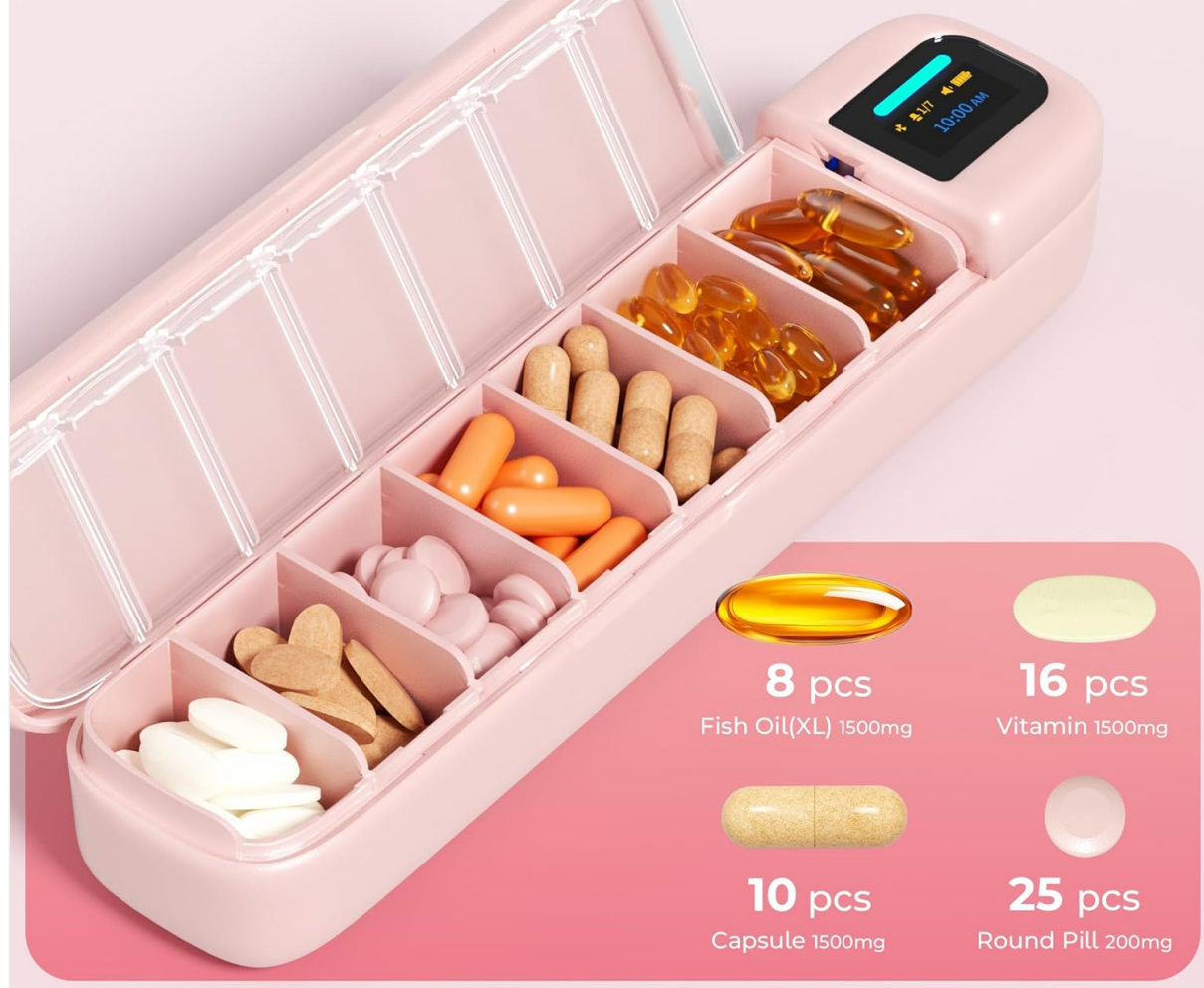
Image 6.1: The dispenser with its compartments open, illustrating capacity.