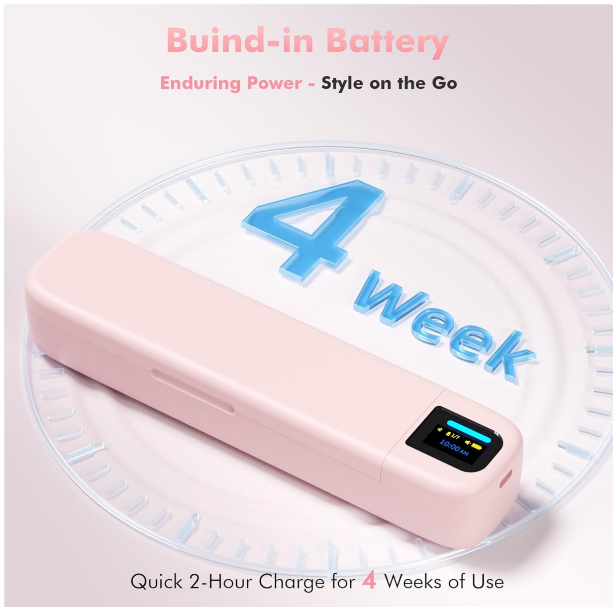
Image 7.1: The dispenser highlighting its long battery life after a quick charge.