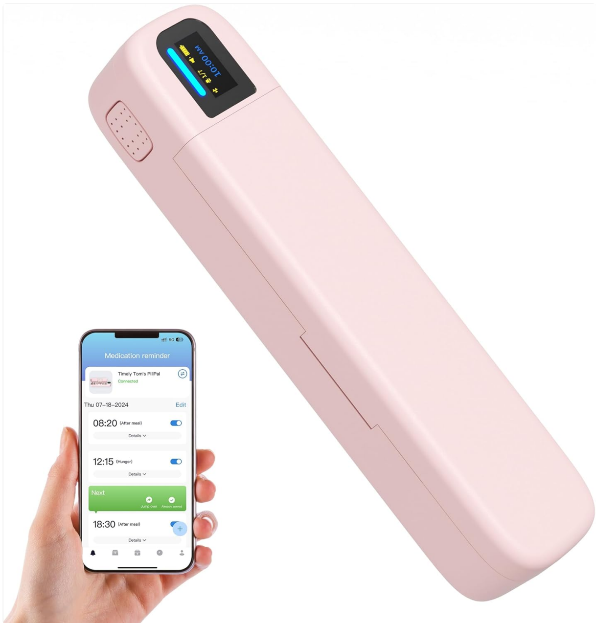
Image 1.1: The COLORWING Smart Pill Dispenser shown alongside its mobile application interface.