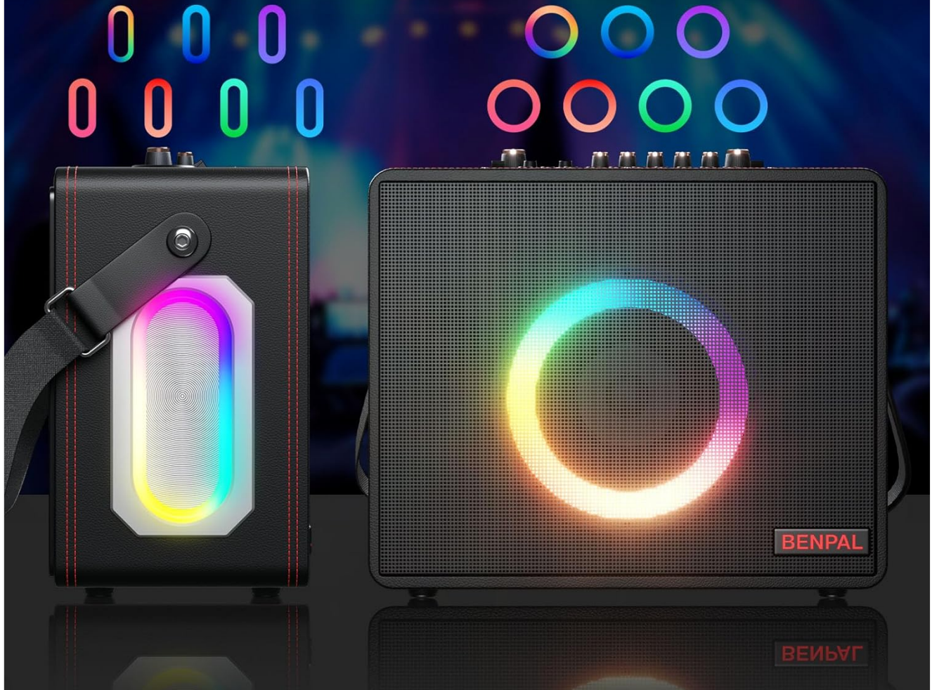
Image: Two karaoke machines demonstrating the vibrant, audio-responsive LED lights that create a dynamic party atmosphere.

Dancing with light, all-round lighting design, creating a colorful and romantic atmosphere for your party.