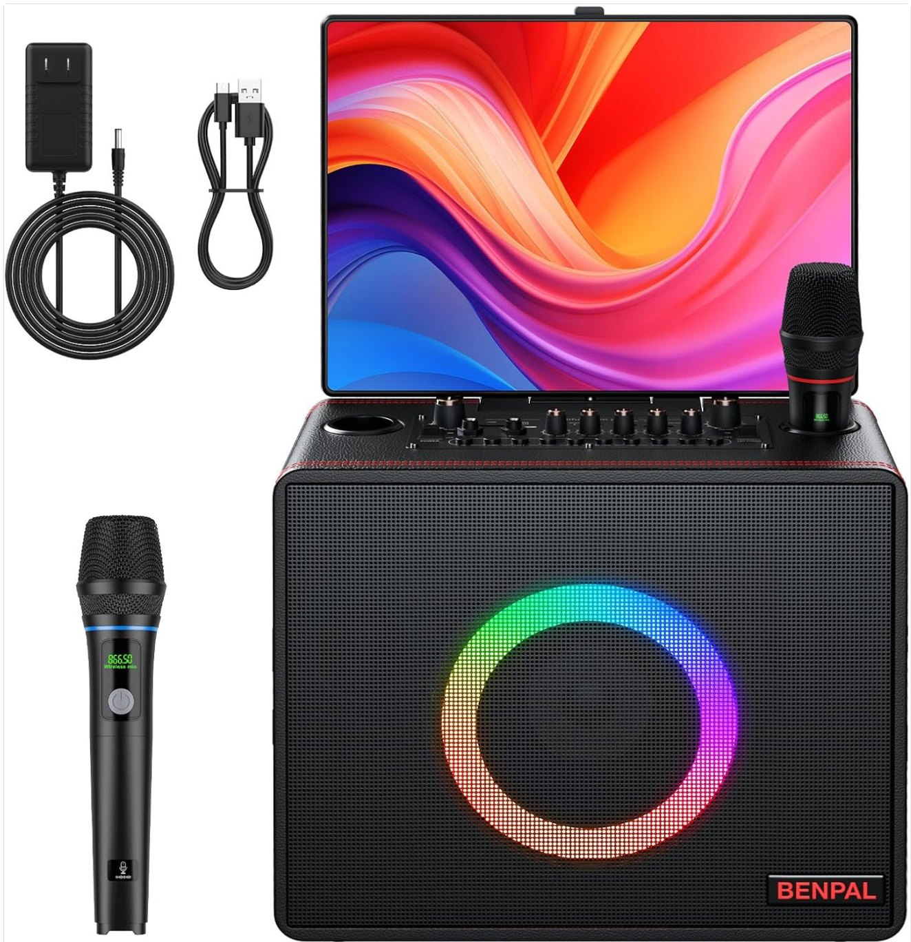
Image: The BENPAL Smart Karaoke Machine with its included accessories: two wireless microphones, power adapter, and USB charging cable.