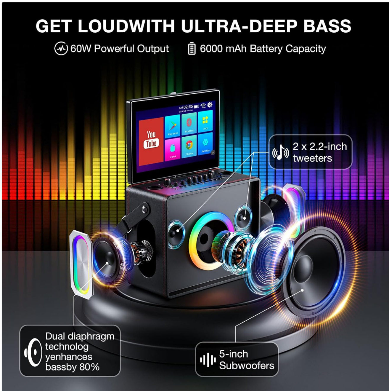
Image: An internal view diagram illustrating the 60W powerful output, 6000 mAh battery, 2x 2.2-inch tweeters, 5-inch subwoofers, and dual diaphragm technology for enhanced bass.