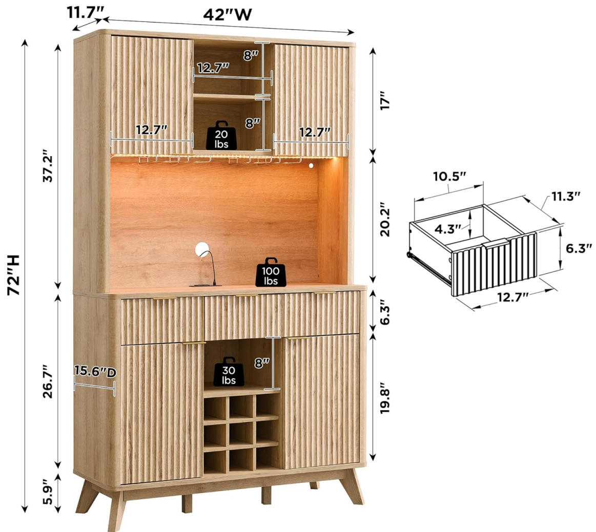
Image: Detailed dimensions of the OKD Wine Bar Cabinet, including height, width, depth, and internal shelf measurements.