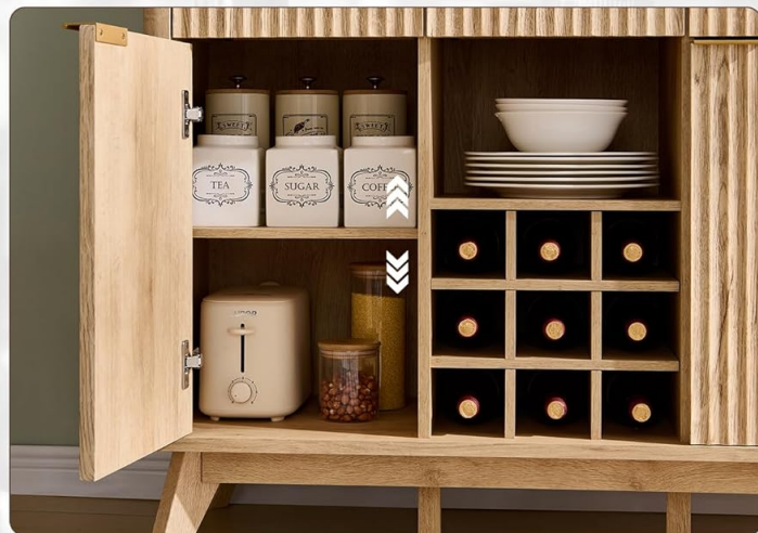
Image: Overview of the cabinet's ample and flexible storage space, detailing the upper hutch and bottom buffet sections.

4 Hidden storage grid cabinets and 9 grid open wine racks