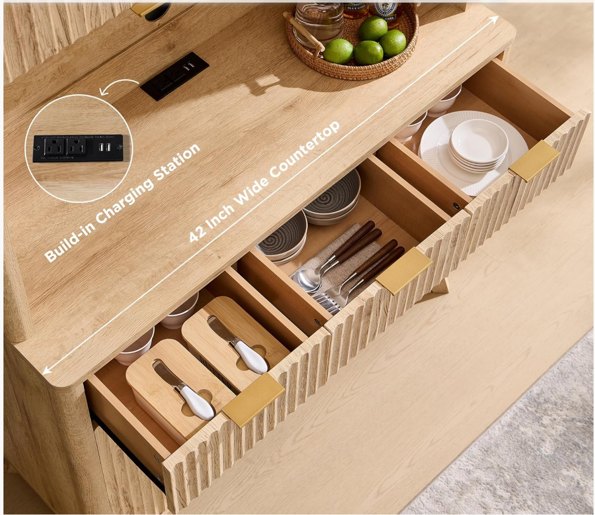
Image: Detail of the three large storage drawers, illustrating their depth and capacity for small items.

Offering easy access to store small items !