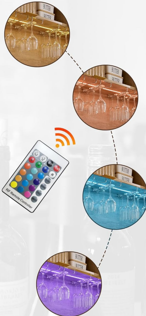
Image: The cabinet with its built-in multi-color RGB LED lights, demonstrating different color options and remote control functionality.