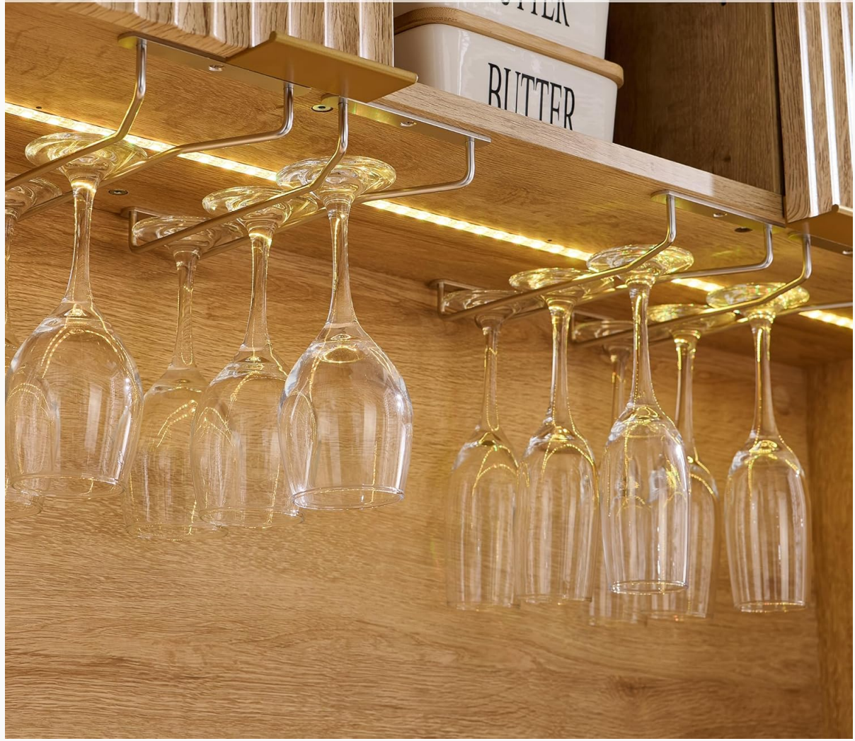
Image: Detail of the built-in 4-row wine glass holders, designed to keep glasses stable.

Keep your wine glass inplace without wobbling !